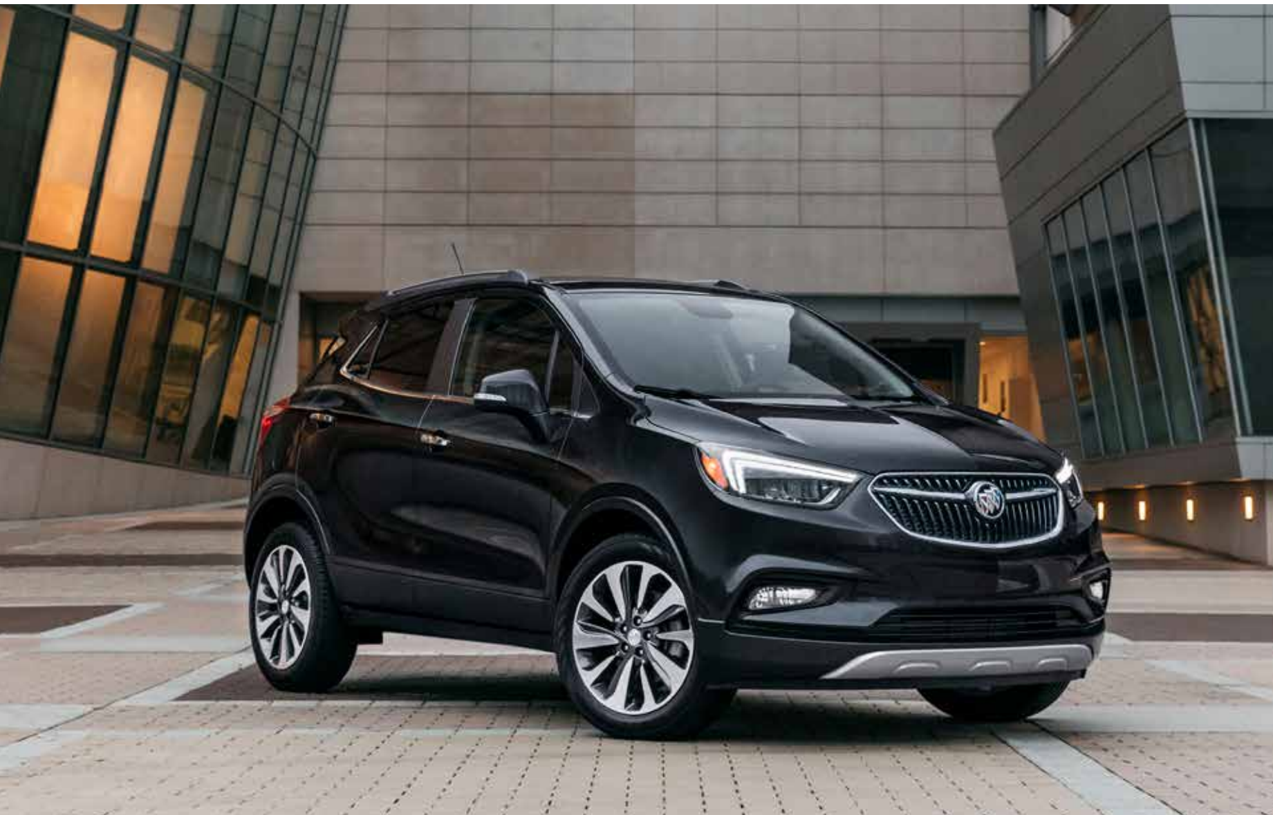
Encore Essence shown in Ebony Twilight Metallic (additional charge; premium paint) with available features.