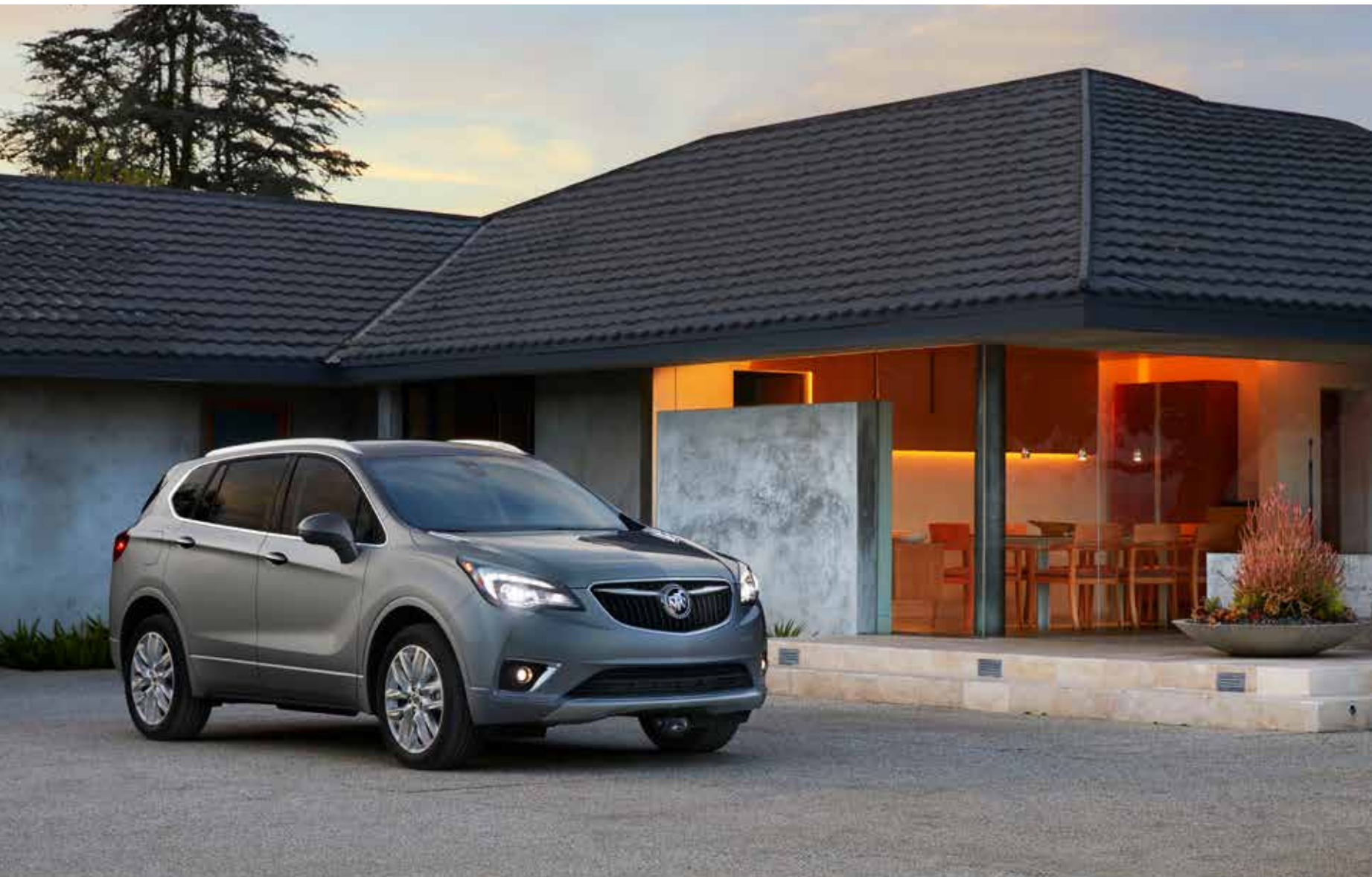
Envision Premium II shown in Satin Steel Metallic (additional charge; premium paint) with available features.