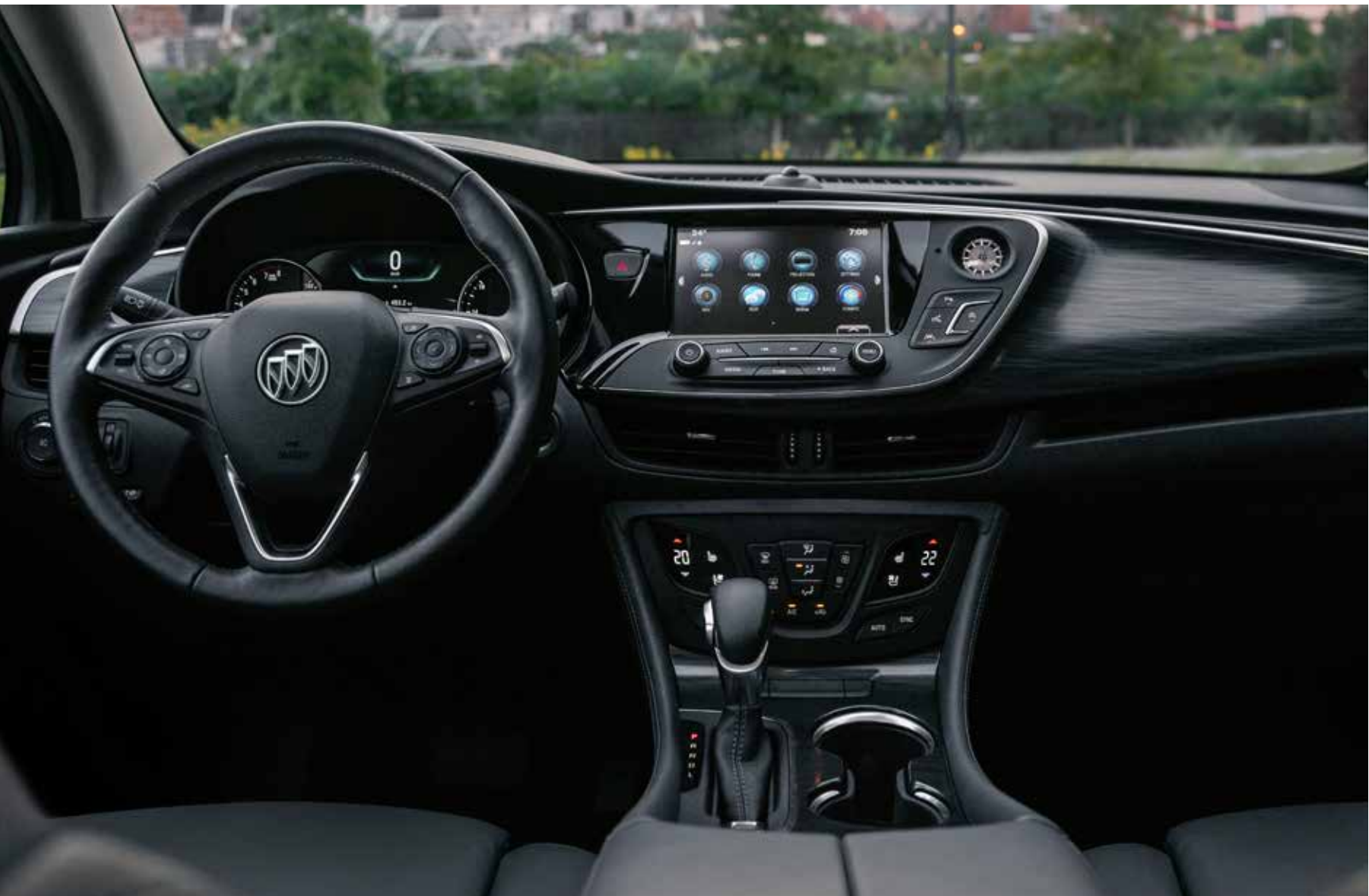
Envision Premium II interior shown in Dark Galvanized with Ebony accents and available features.