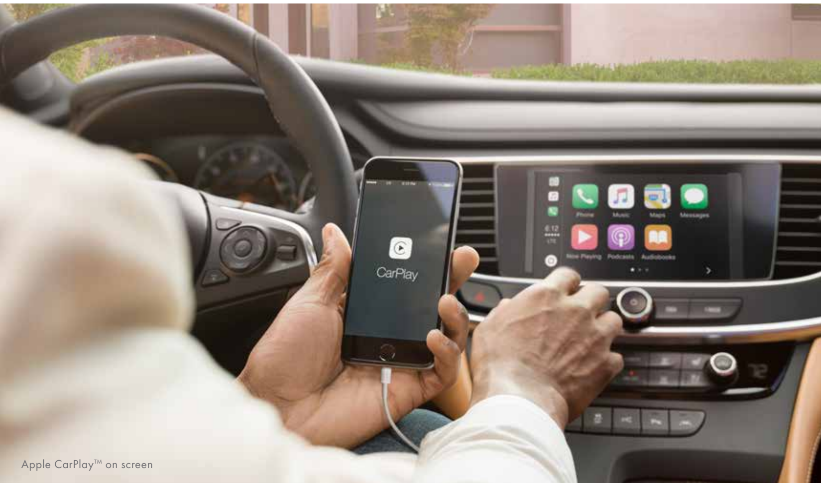
Apple CarPlay™ on screen