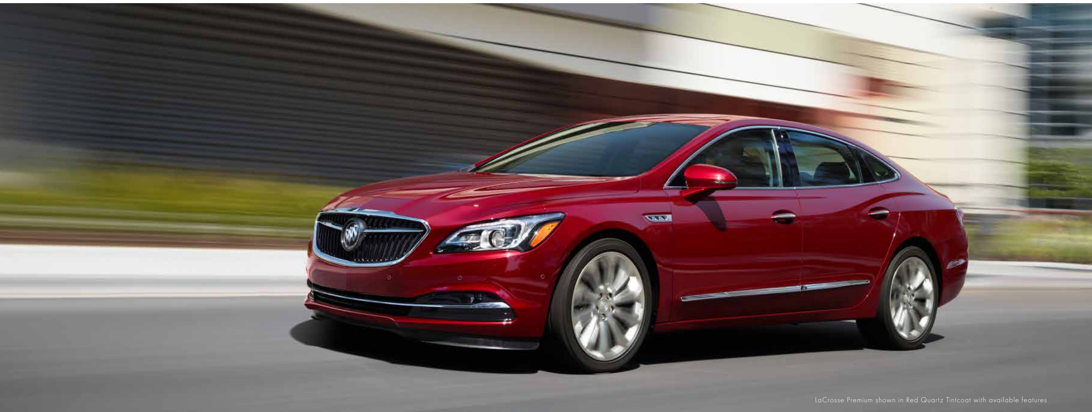
LaCrosse Premium shown in Red Quartz Tintcoat with available features

Modern yet timeless, this is the NEW 2018 BUICK LACROSSE.