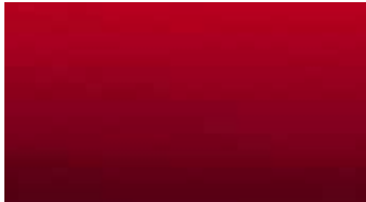
RED QUARTZ TINTCOAT 1,2