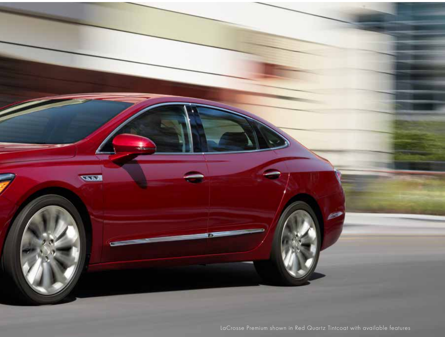
LaCrosse Premium shown in Red Quartz Tintcoat with available features