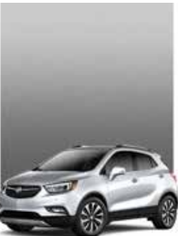
QUICKSILVER METALLIC 1