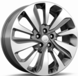
RDK 18" 10-SPOKE ALUMINUM WITH LIGHT ARGENT FINISH