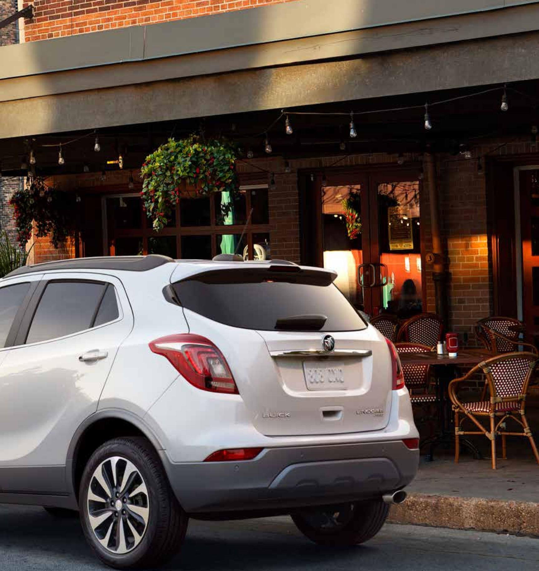
WHITE FROST METALLIC shown with Premium Group and optional equipment.