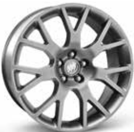
RSZ 18" MIDNIGHT SILVER ALUMINUM ALLOY