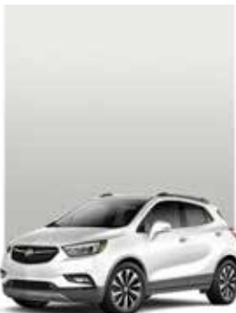
WHITE FROST METALLIC 1,2