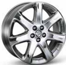
RV8 18" 7-SPOKE CHROMED ALUMINUM