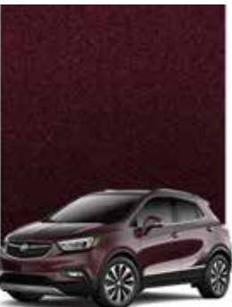
BLACK CHERRY METALLIC 1,2