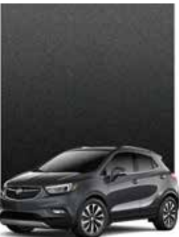
GRAPHITE GREY METALLIC 1,2