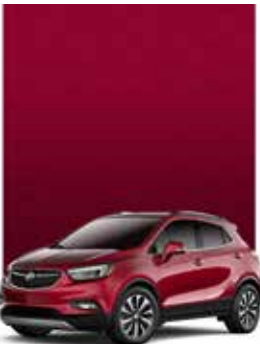
WINTERBERRY RED METALLIC 1,2