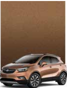
RIVER ROCK METALLIC 1,2