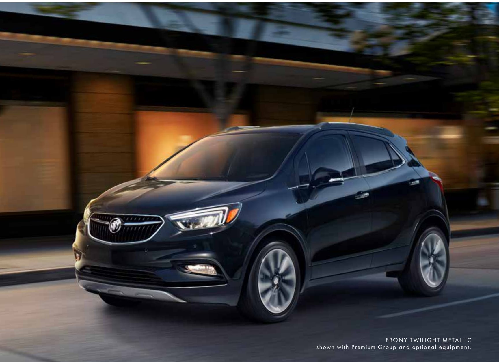
EBONY TWILIGHT METALLIC shown with Premium Group and optional equipment.