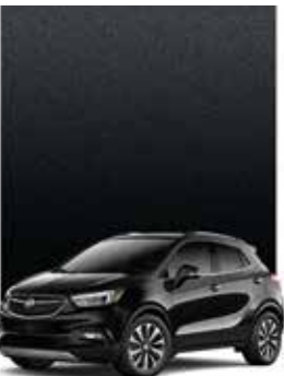
EBONY TWILIGHT METALLIC 2