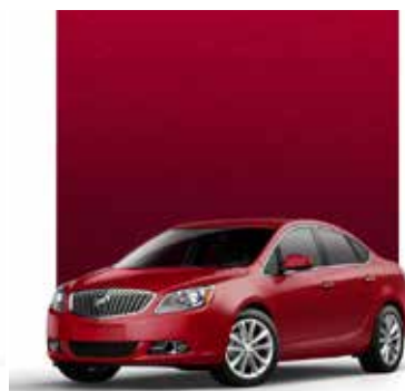
CRYSTAL RED TINTCOAT 2