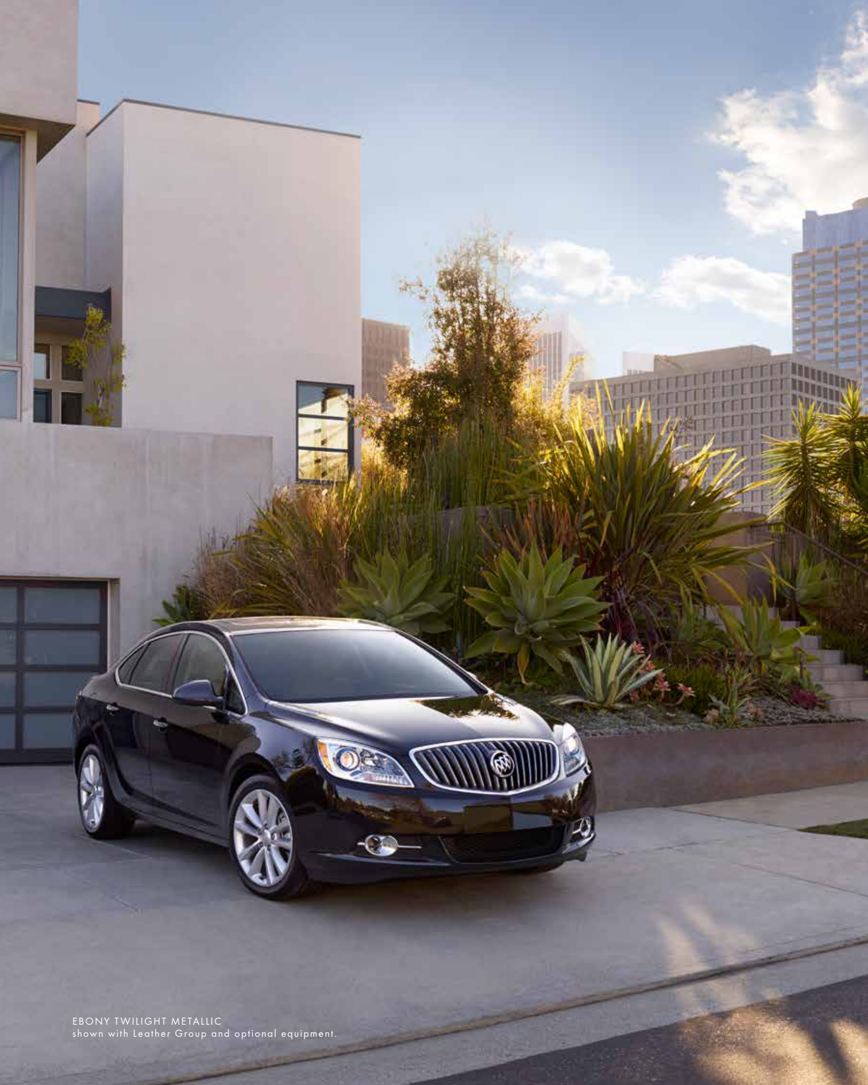
EBONY TWILIGHT METALLIC shown with Leather Group and optional equipment.