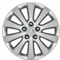
PNM 17" MULTI-SPOKE ALLOY WITH STERLING SILVER FINISH