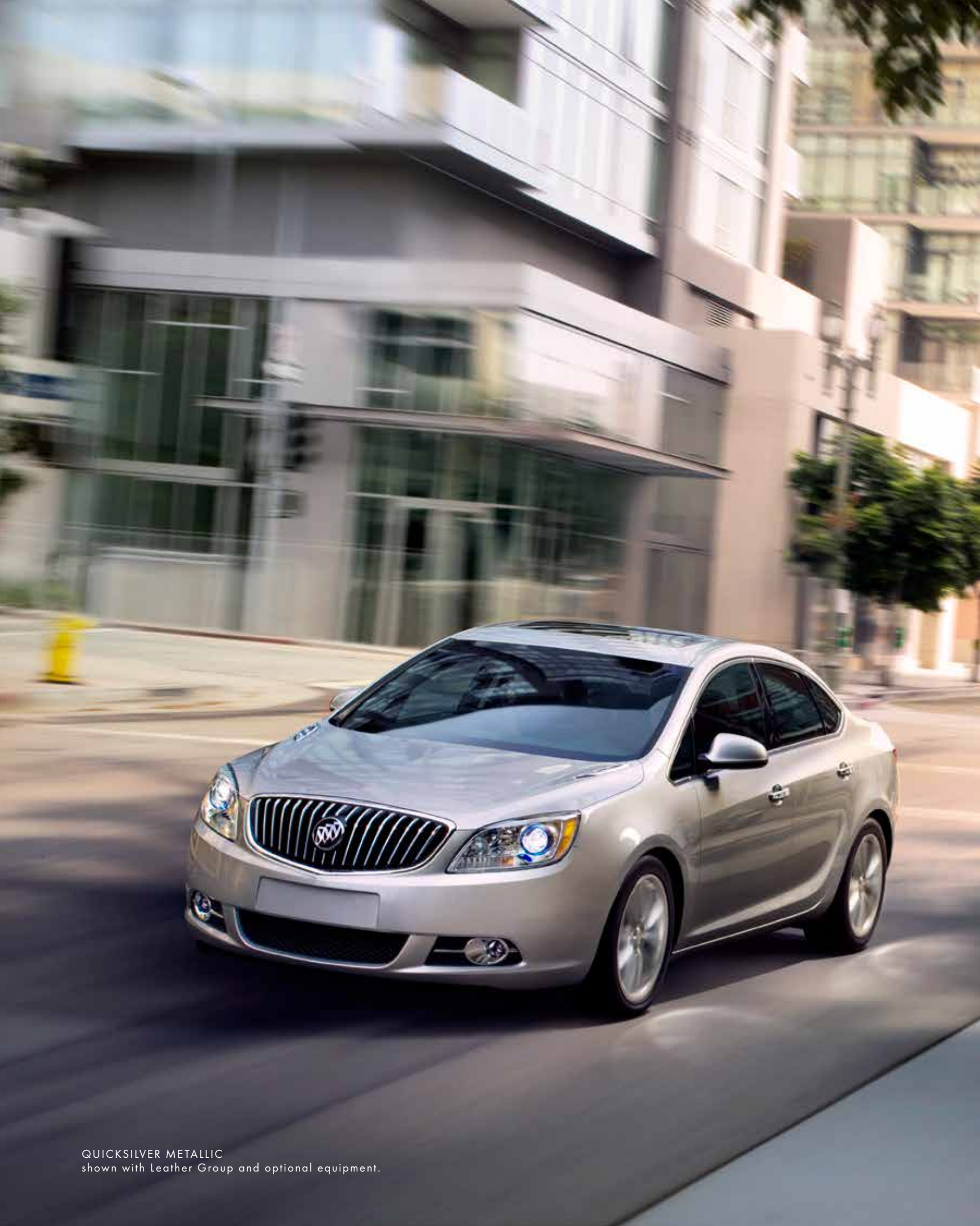
QUICKSILVER METALLIC shown with Leather Group and optional equipment.