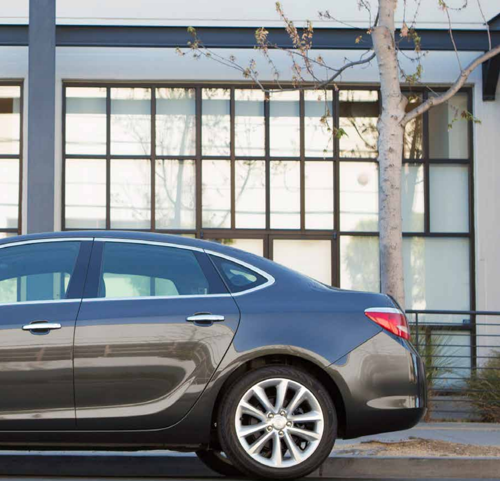
GRAPHITE GREY METALLIC shown with Leather Group and optional equipment.