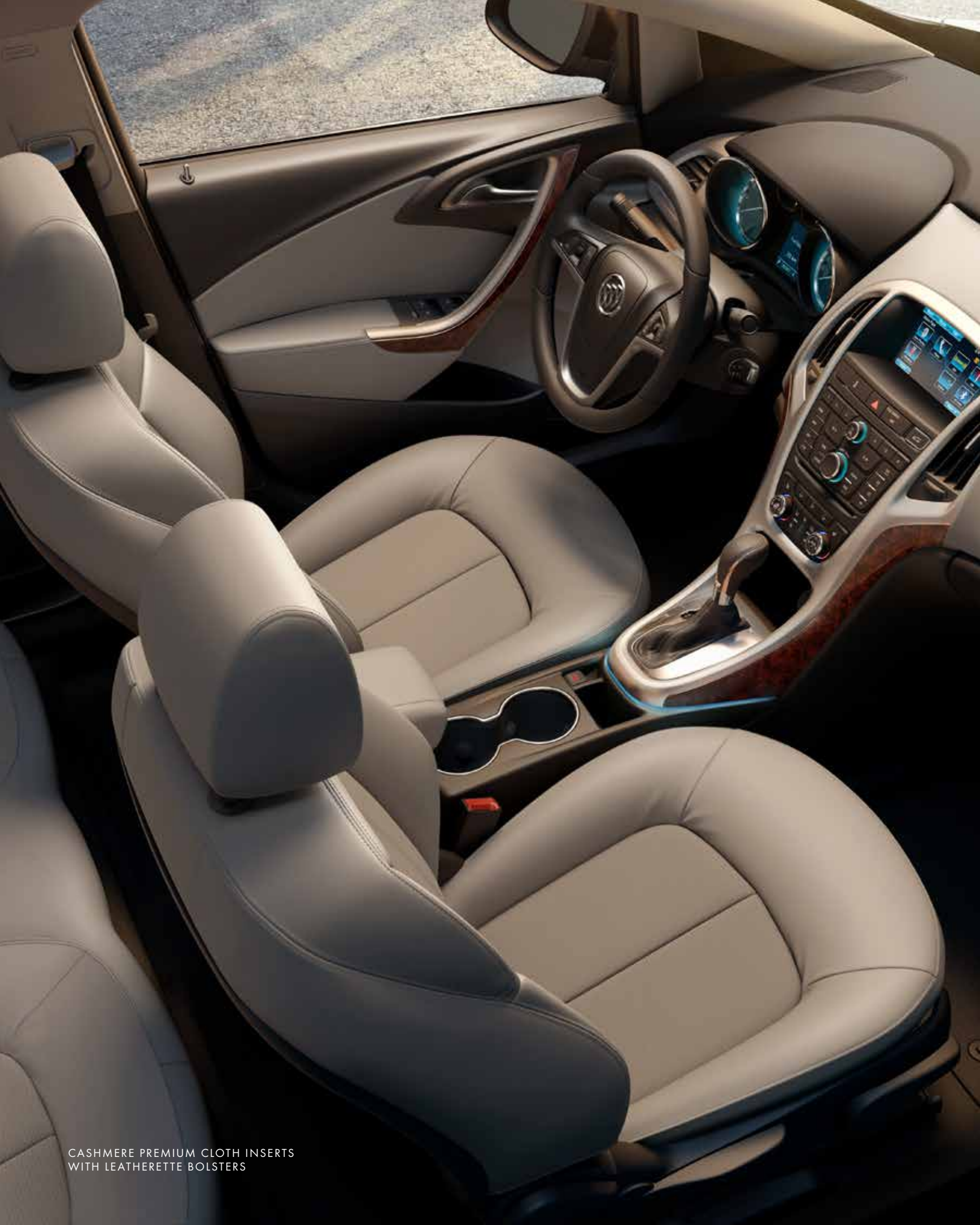
CASHMERE PREMIUM CLOTH INSERTS WITH LEATHERETTE BOLSTERS