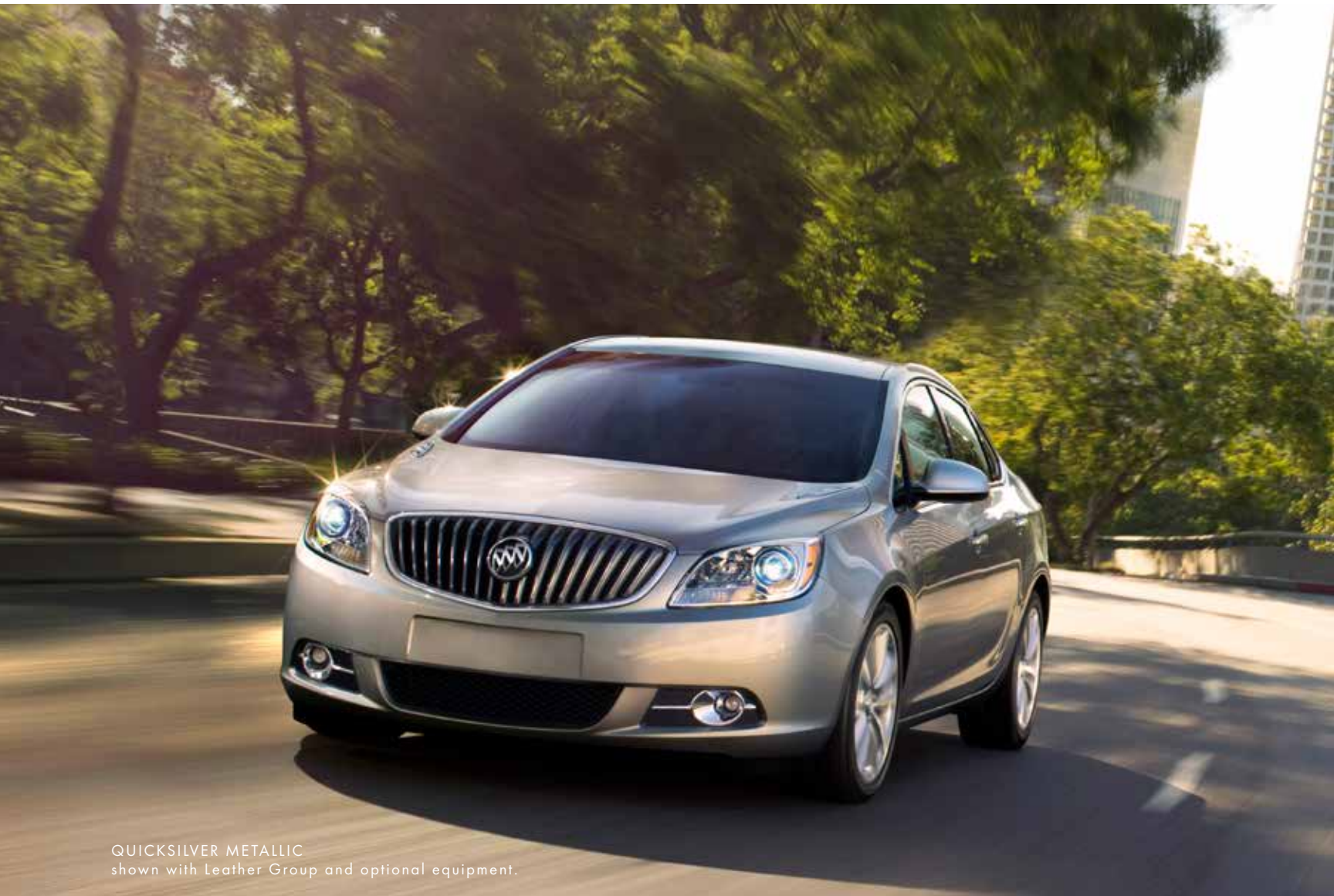
QUICKSILVER METALLIC shown with Leather Group and optional equipment.

What's it feel like to drive the 2017 Buick Verano? The answer may shatter your expectations. After all, Verano is A SEDAN DESIGNED TO SURPRISE you with its premium features and refined finishes. And with its responsive power and nimble handling, Verano is simply fun to drive. So what are you waiting for? It's time to experience Verano for yourself.