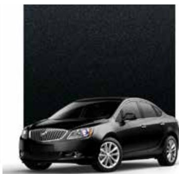
EBONY TWILIGHT METALLIC 1,2