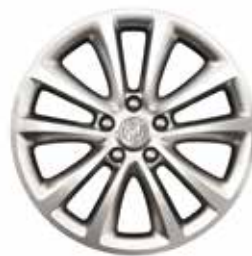
RV3 18" MULTI-SPOKE MACHINED ALLOY WITH STERLING SILVER FINISHED POCKETS