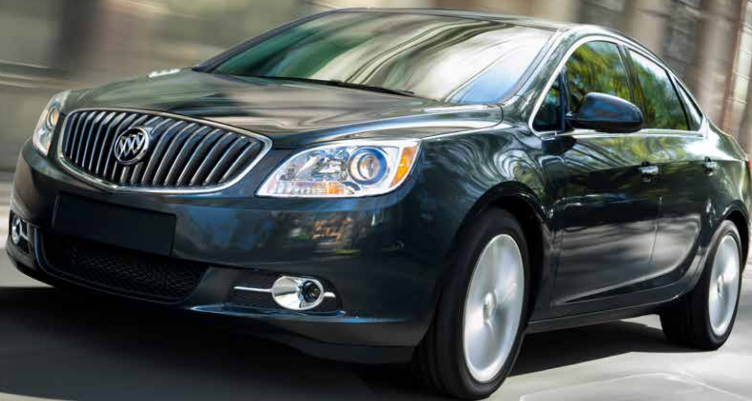
EBONY TWILIGHT METALLIC shown with Leather Group and optional equipment.