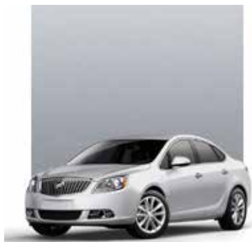
QUICKSILVER METALLIC 1