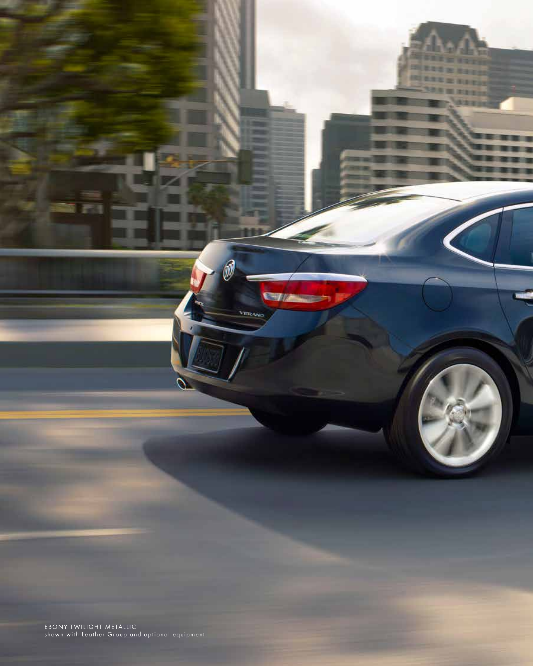
EBONY TWILIGHT METALLIC shown with Leather Group and optional equipment.