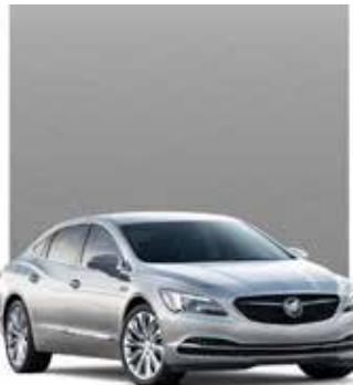
QUICKSILVER METALLIC 2