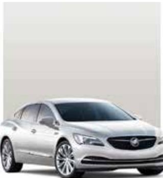
WHITE FROST TRICOAT 1,2