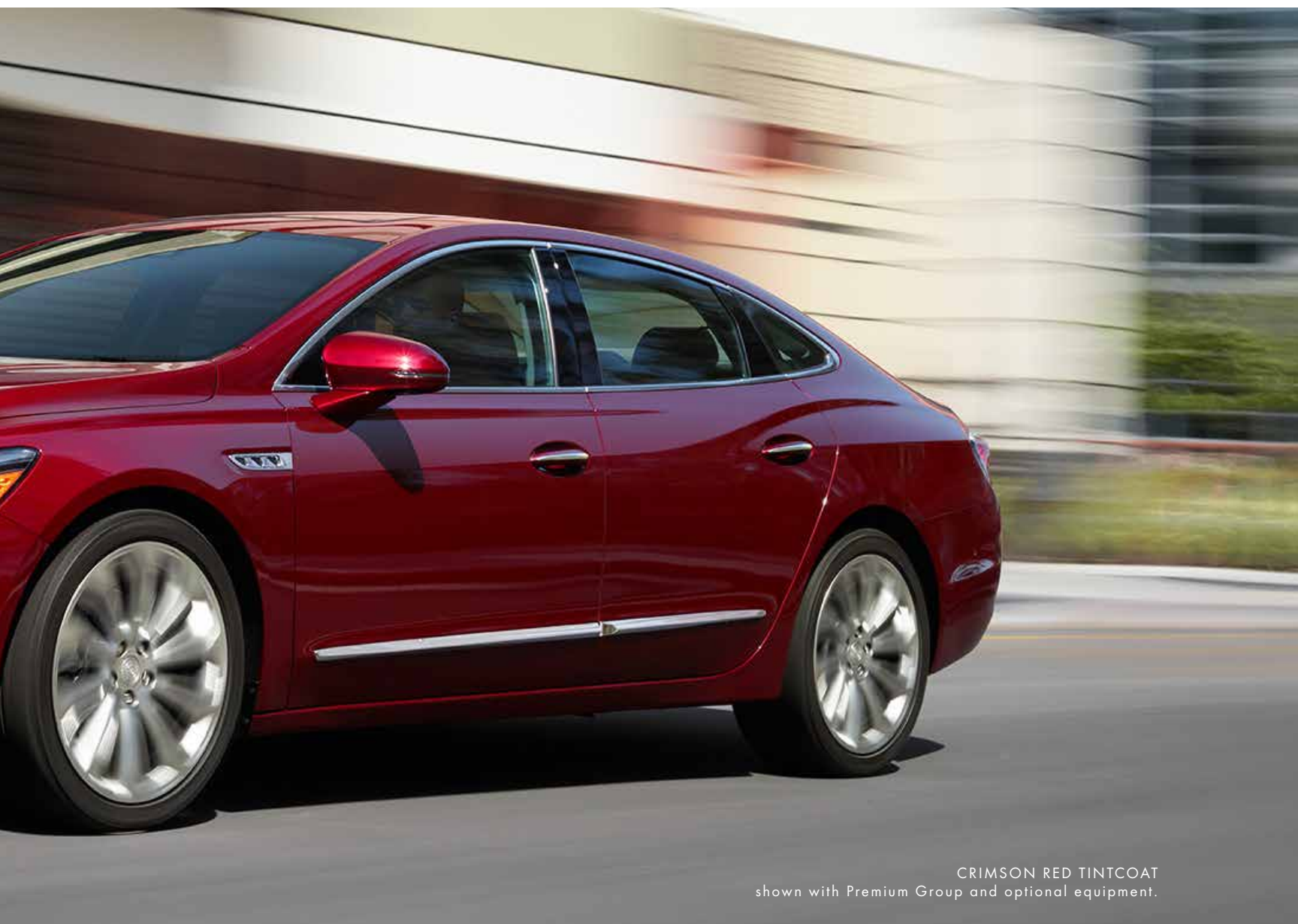
CRIMSON RED TINTCOAT shown with Premium Group and optional equipment.