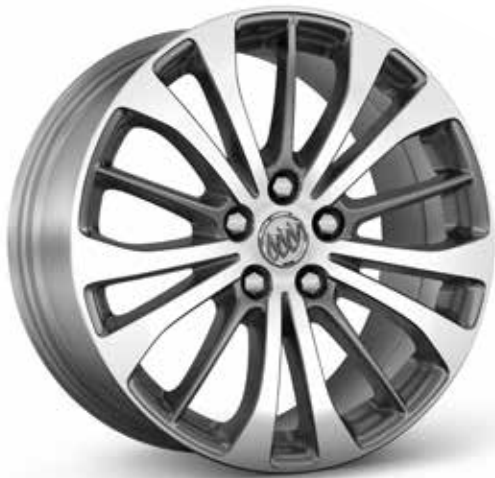
RDA 18" ULTRA-BRIGHT MACHINE-FACED ALUMINUM