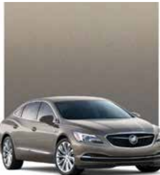
PEPPERDUST METALLIC 2