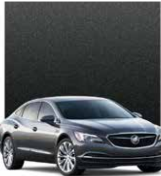
GRAPHITE GREY METALLIC 2