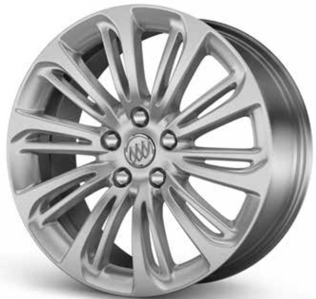
Q7A 18" ALUMINUM ALLOY