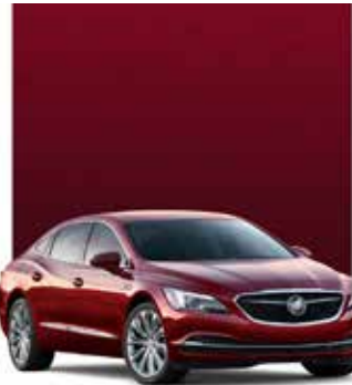
CRIMSON RED TINTCOAT 1,2