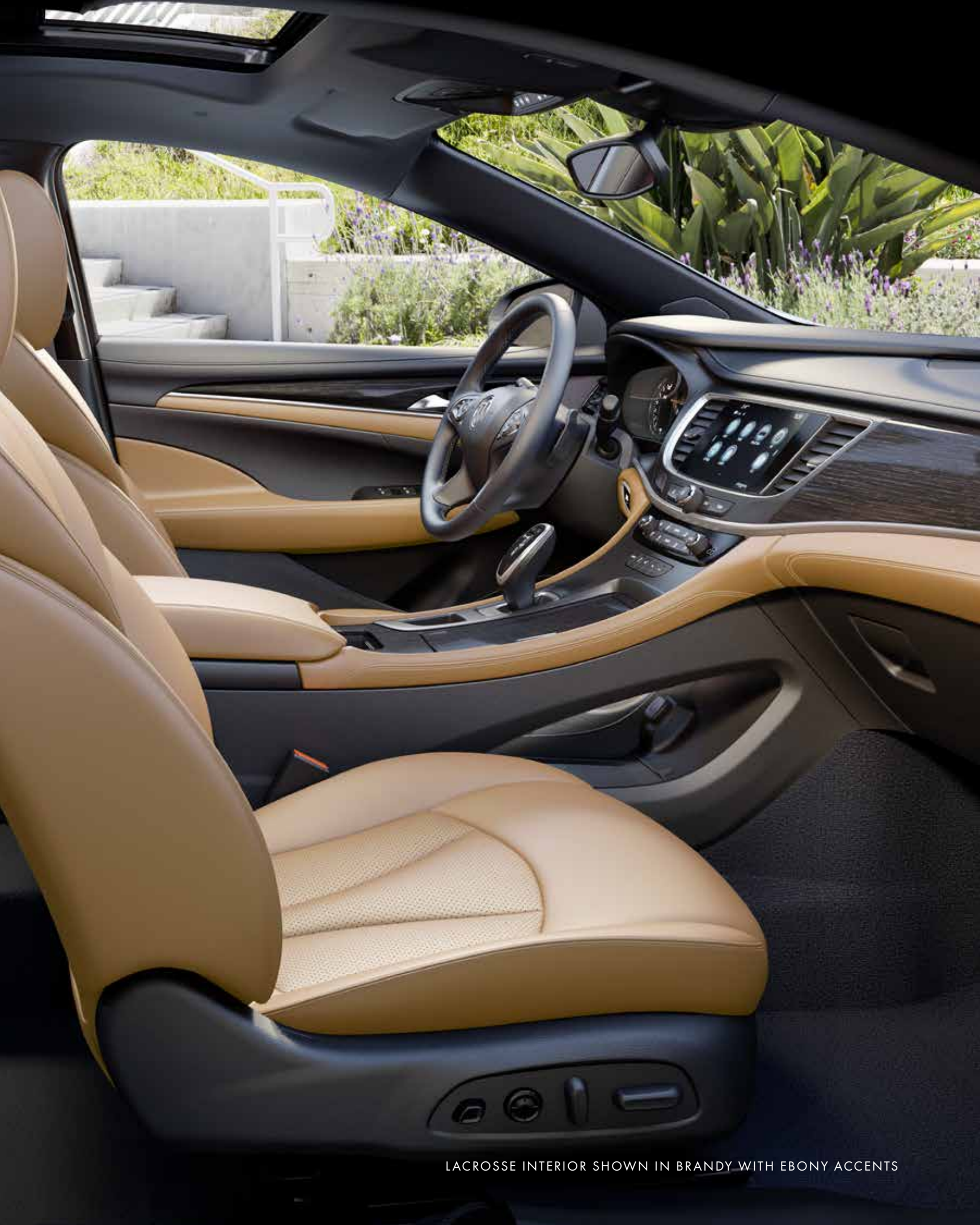
LACROSSE INTERIOR SHOWN IN BRANDY WITH EBONY ACCENTS