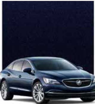
DARK SAPPHIRE BLUE METALLIC 1,2