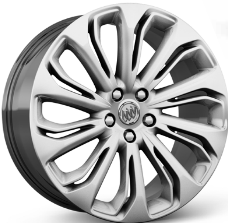
Q7Q 20" ALUMINUM ALLOY