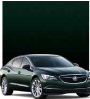
DARK FOREST GREEN METALLIC 2