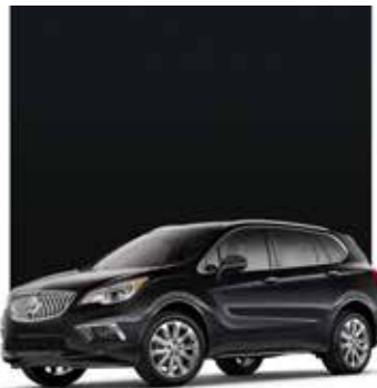
EBONY TWILIGHT METALLIC 1