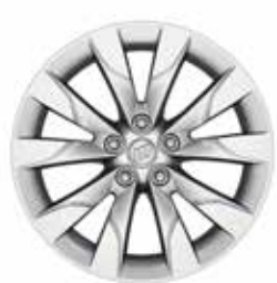
PZW 18" 10-SPOKE POLISHED ALUMINUM