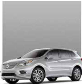
GALAXY SILVER METALLIC