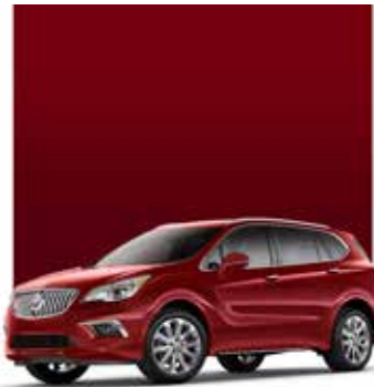
CHILI RED METALLIC 1