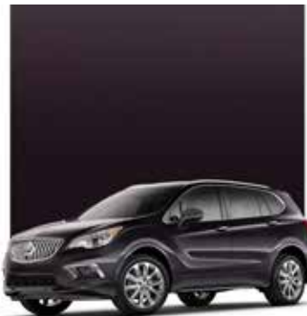
MIDNIGHT AMETHYST METALLIC 1