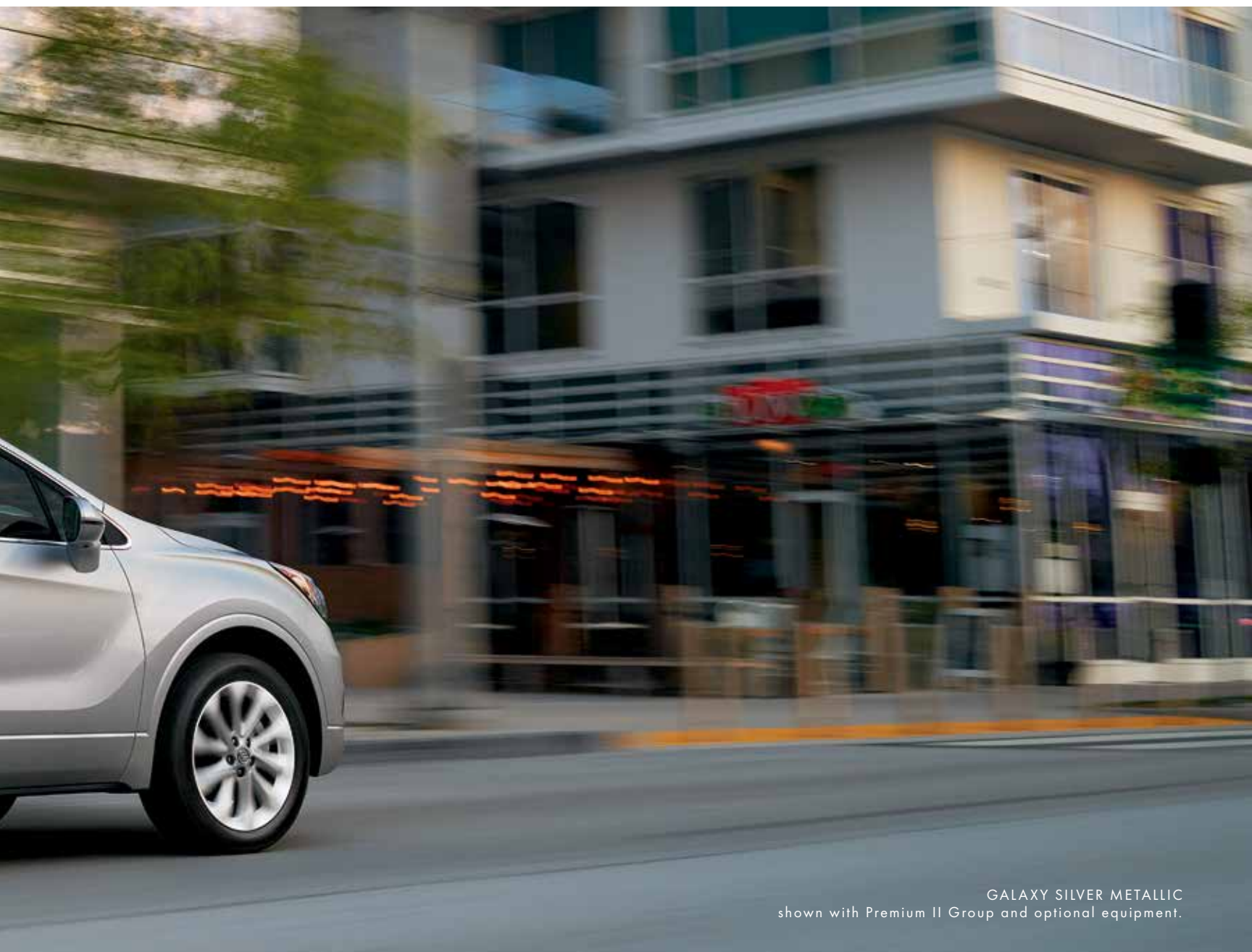
GALAXY SILVER METALLIC shown with Premium II Group and optional equipment.