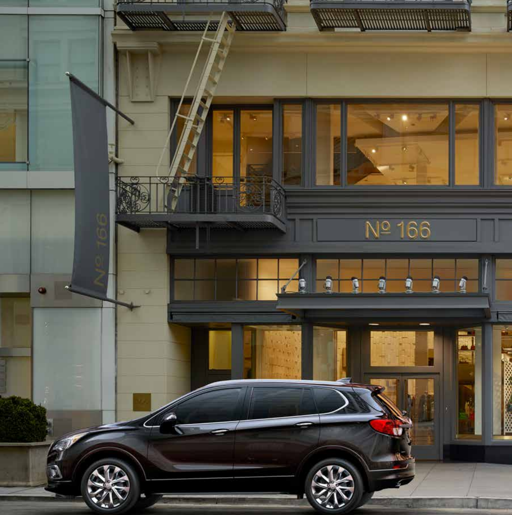
EBONY TWILIGHT METALLIC shown with Premium II Group and optional equipment.