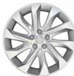
RT7 19" 10-SPOKE ALUMINUM WITH PREMIUM MANOOGIAN SILVER FINISH