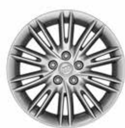
RQH 18" 10-SPOKE PAINTED ALUMINUM