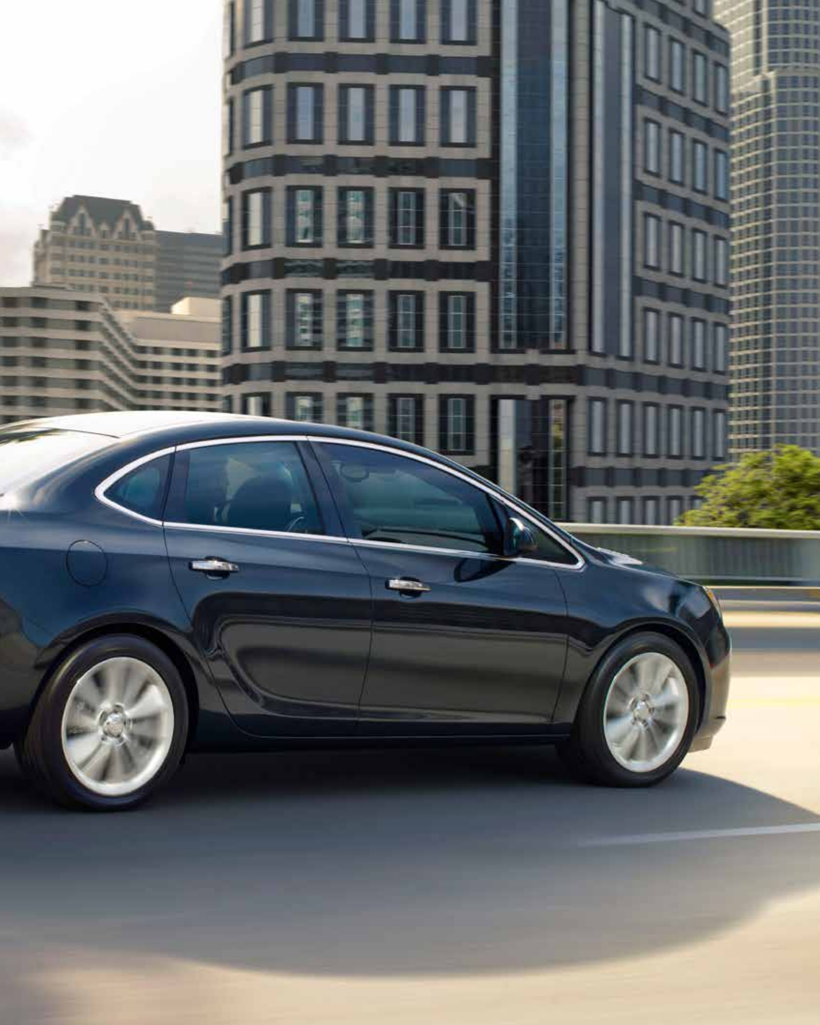
EBONY TWILIGHT METALLIC shown with Premium Group and optional equipment.