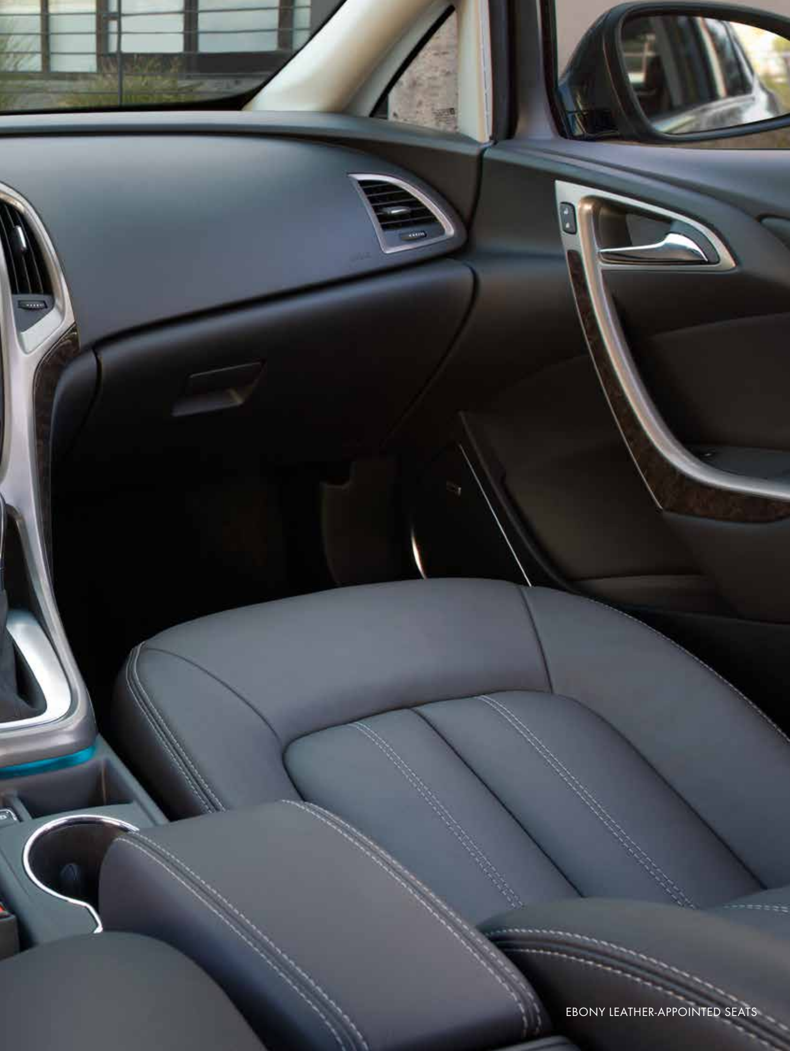
EBONY LEATHER-APPOINTED SEATS