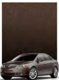
MOCHA BRONZE METALLIC 1