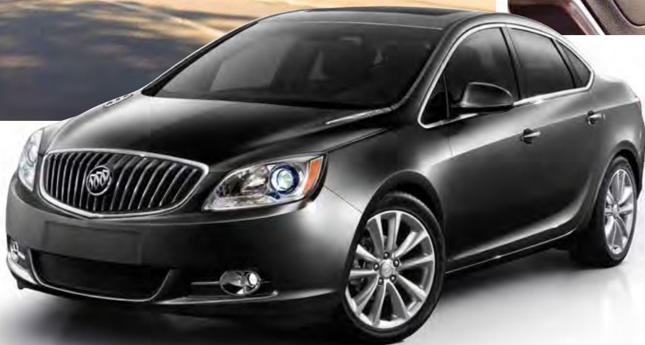
EBONY TWILIGHT METALLIC shown with Leather Group and optional equipment.