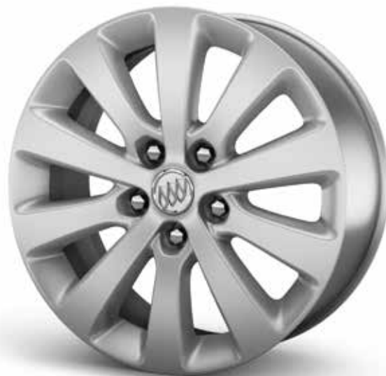
PNM 17" MULTI-SPOKE ALLOY WITH STERLING SILVER FINISH