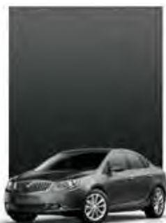
GRAPHITE GREY METALLIC 1