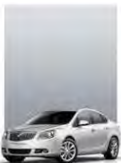
QUICKSILVER METALLIC 1