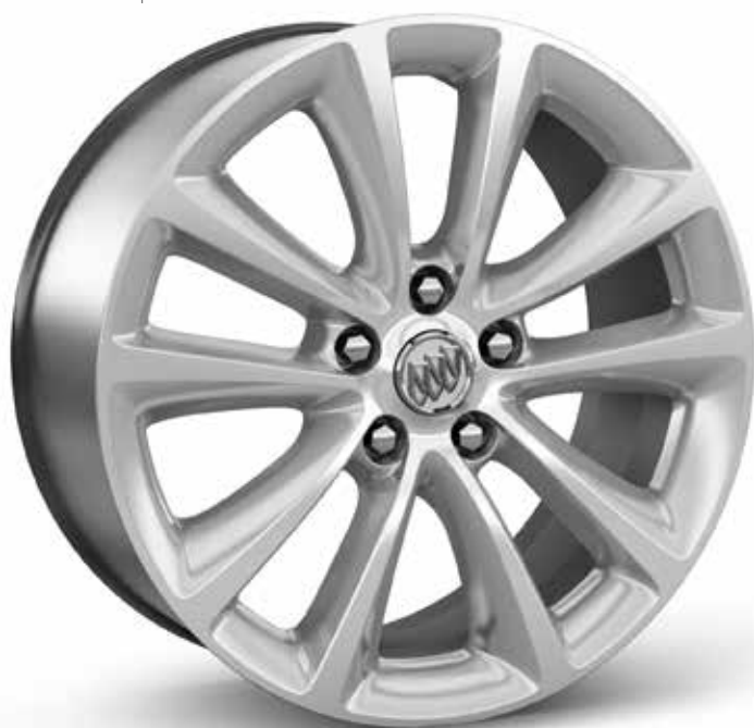
RV3 18" MULTI-SPOKE MACHINED ALLOY WITH STERLING SILVER FINISHED POCKETS