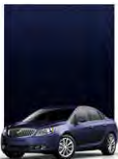
DARK SAPPHIRE BLUE METALLIC 1