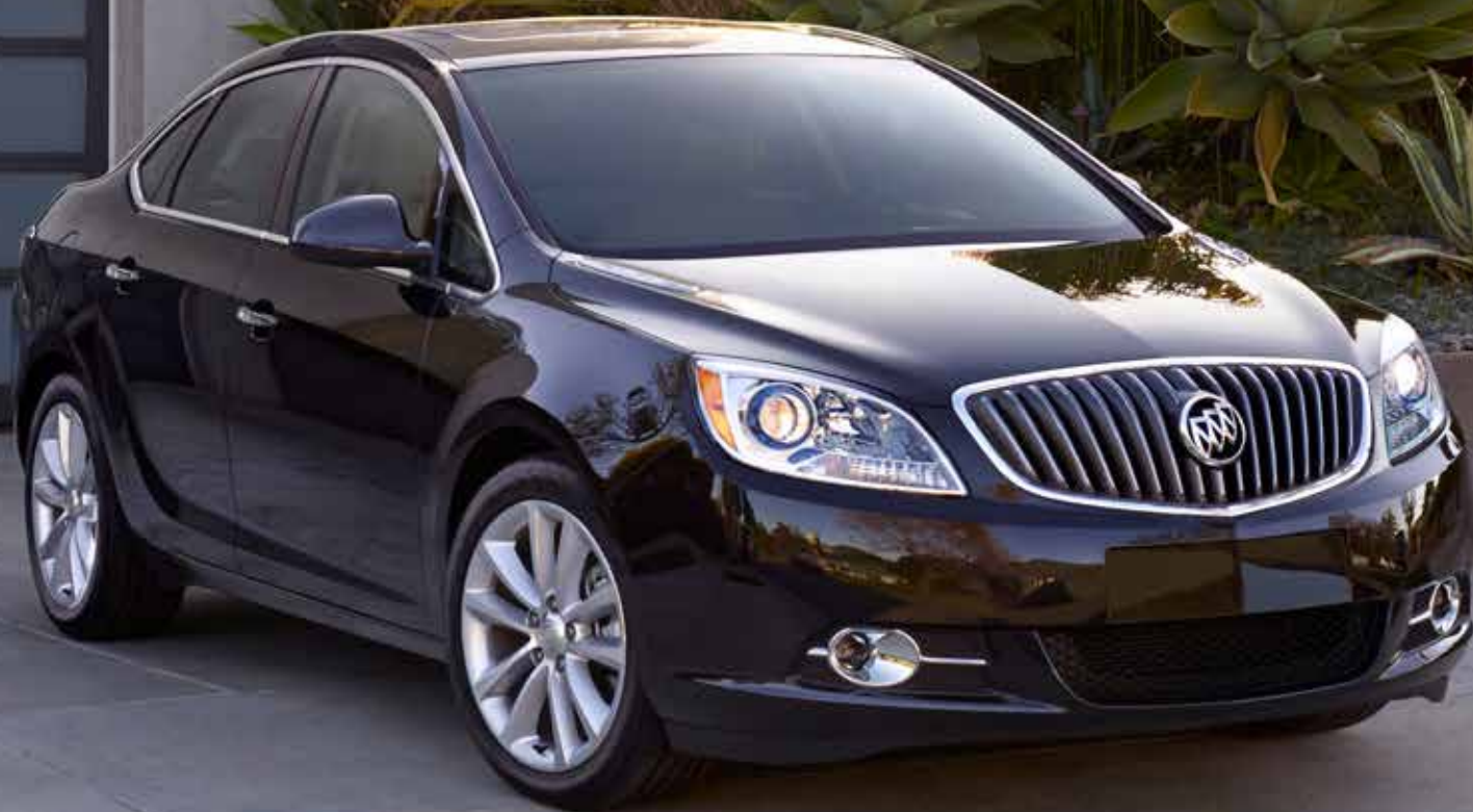
EBONY TWILIGHT METALLIC shown with Premium Group and optional equipment.