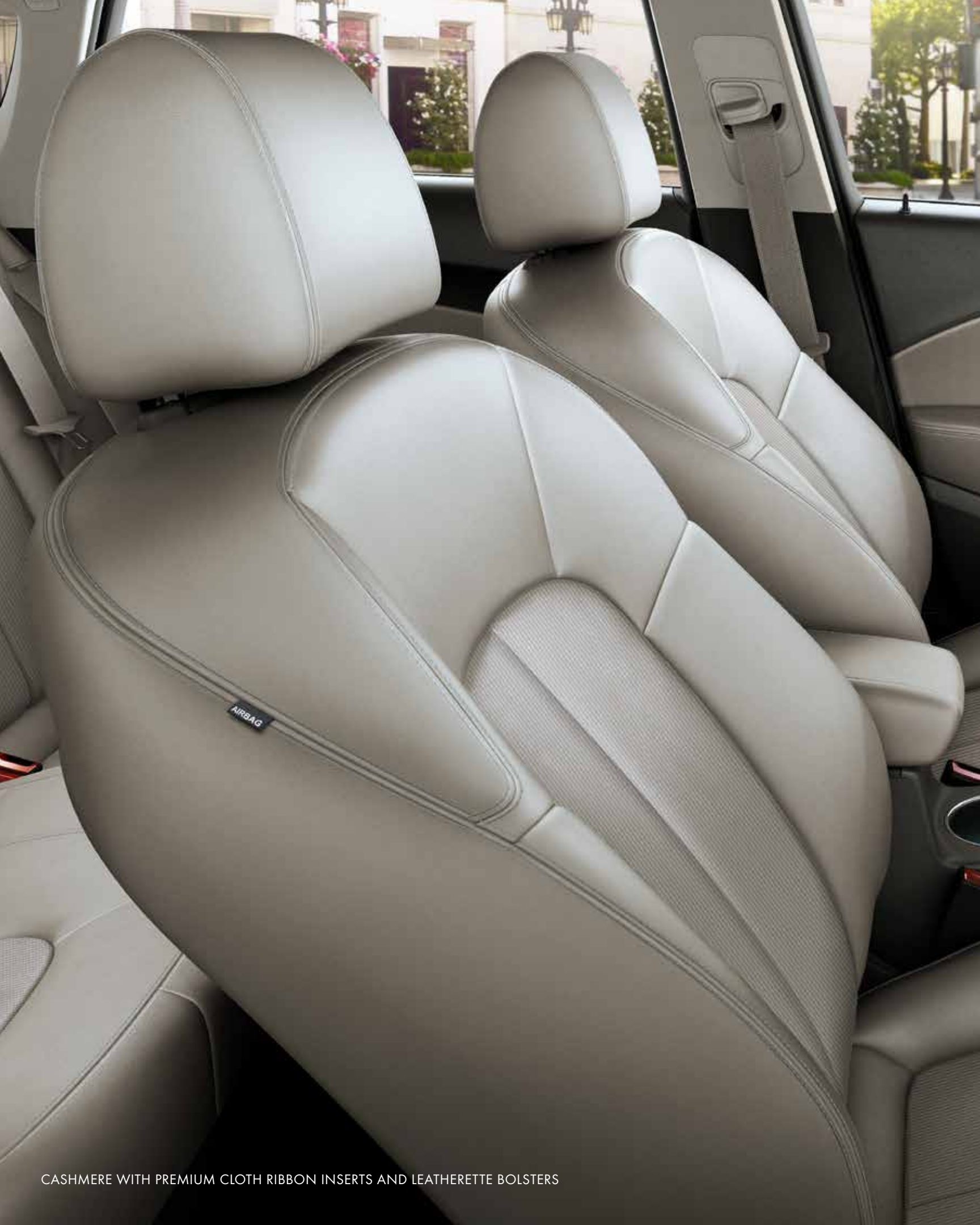
CASHMERE WITH PREMIUM CLOTH RIBBON INSERTS AND LEATHERETTE BOLSTERS