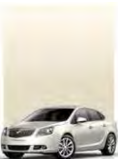
WHITE DIAMOND TRICOAT 1