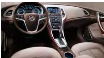
CASHMERE LEATHER-APPOINTED SEATING OR CLOTH