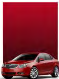
CRYSTAL RED TINTCOAT 1