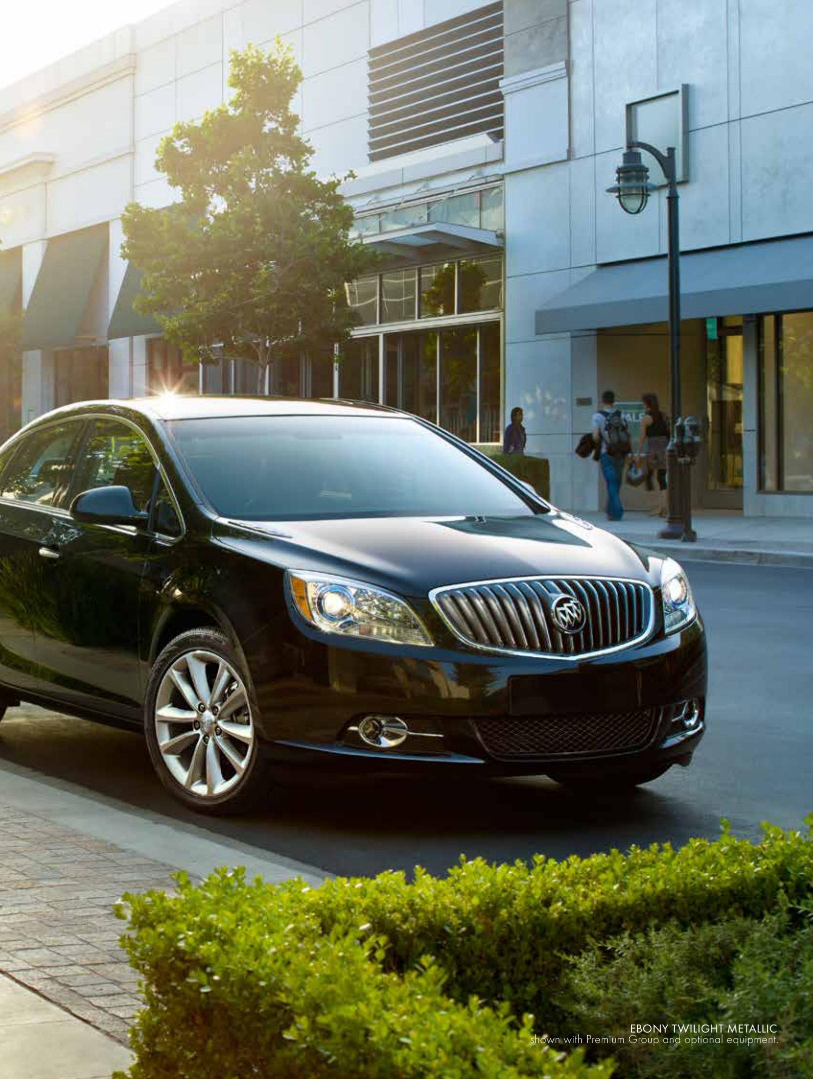
EBONY TWILIGHT METALLIC shown with Premium Group and optional equipment.