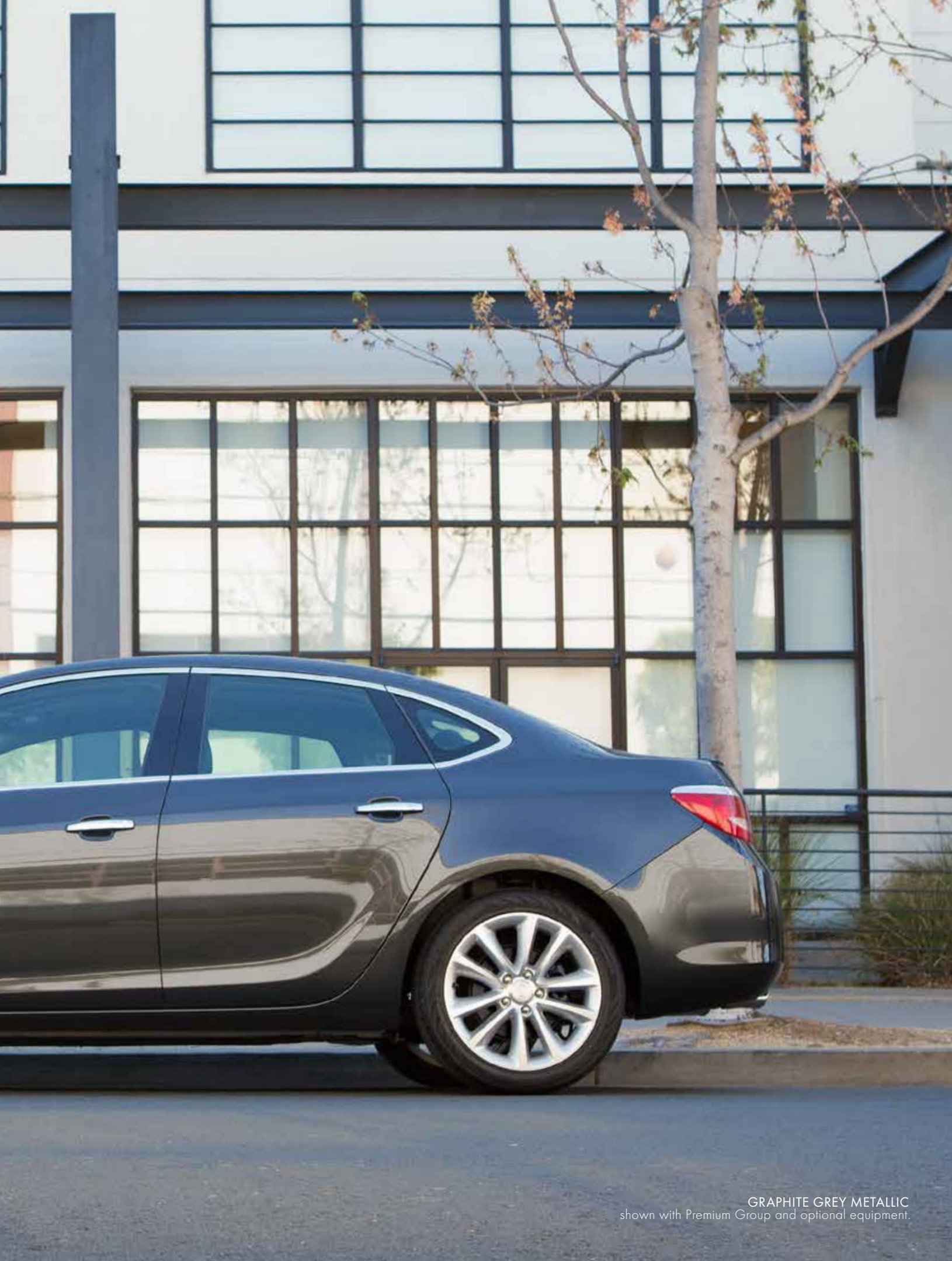
GRAPHITE GREY METALLIC shown with Premium Group and optional equipment.