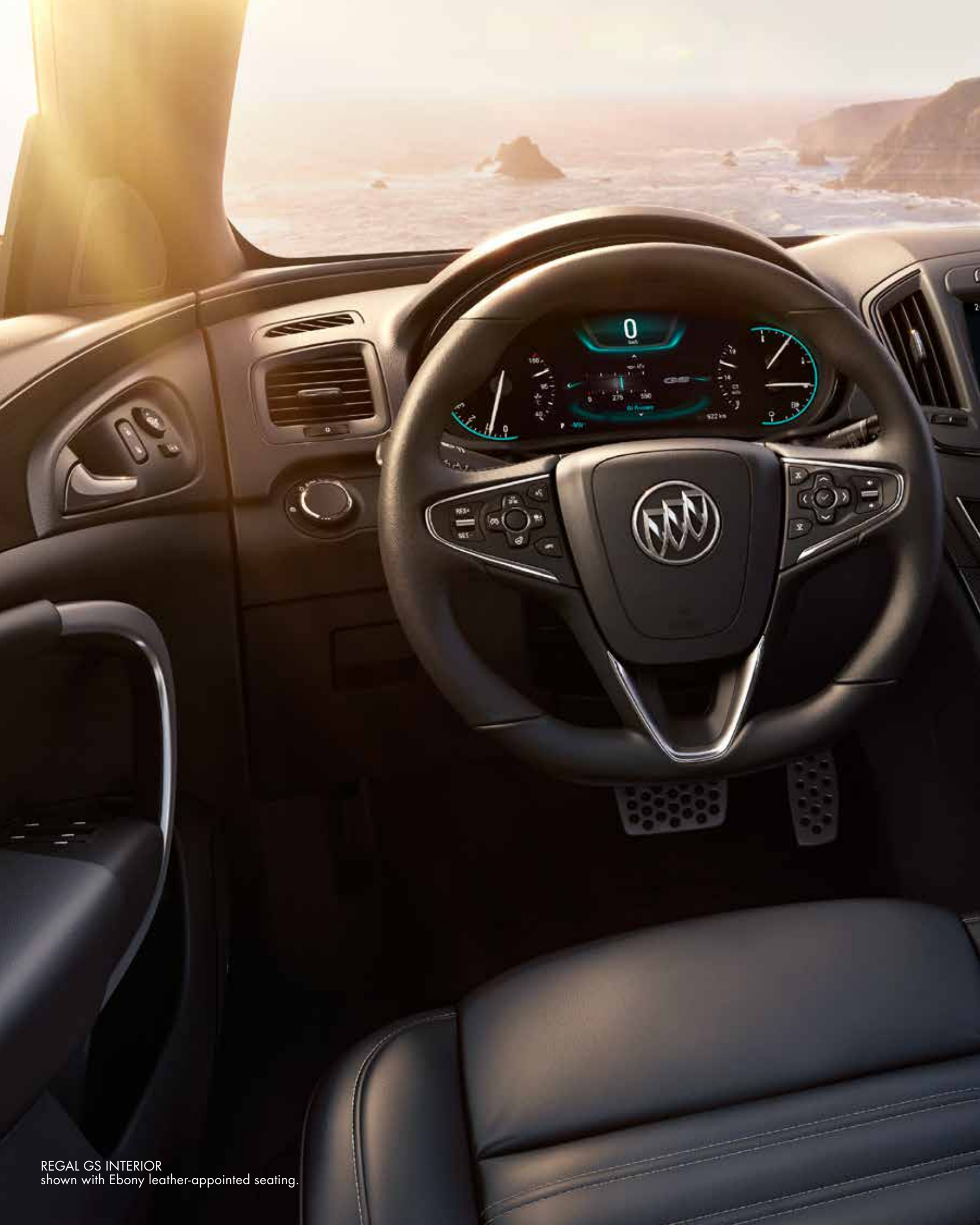
REGAL GS INTERIOR shown with Ebony leather-appointed seating.