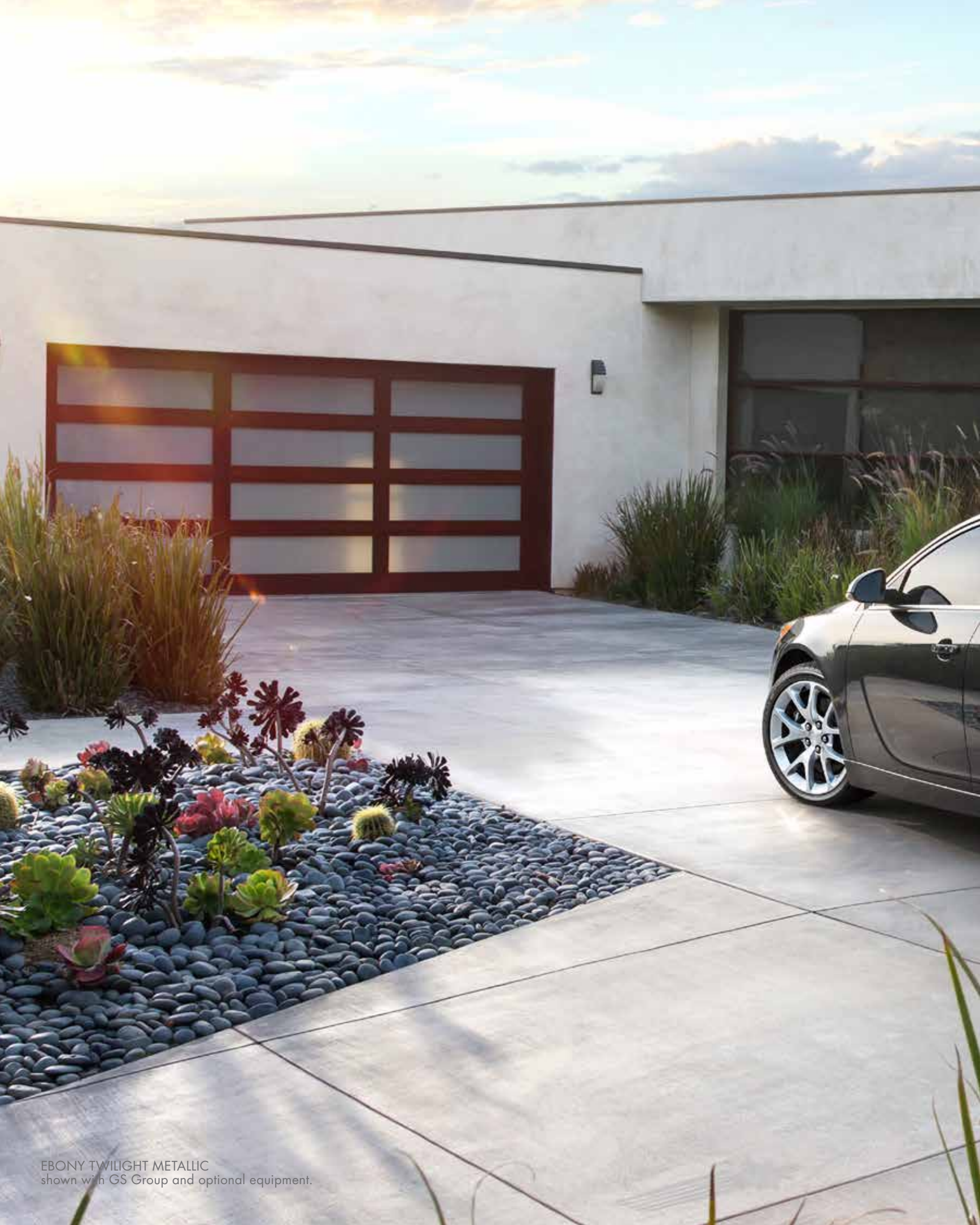
EBONY TWILIGHT METALLIC shown with GS Group and optional equipment.