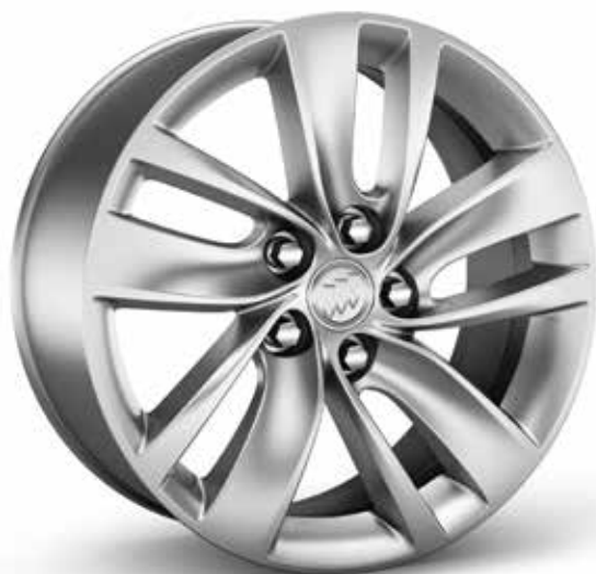
PXR 18" SILVER ALLOY