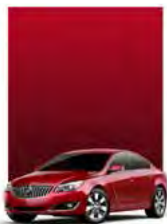
CRIMSON RED TINTCOAT 2