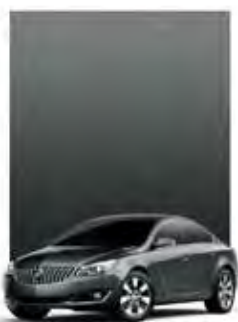
SMOKY GREY METALLIC