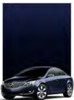
DARK SAPPHIRE BLUE METALLIC 1