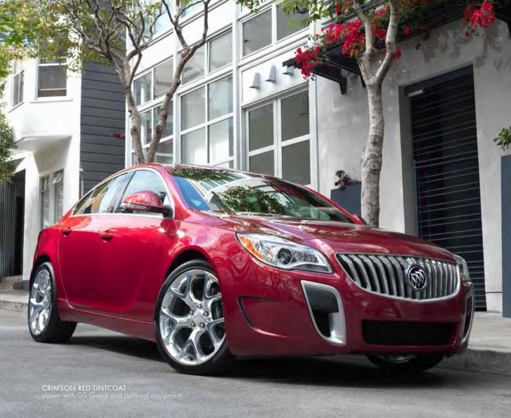
CRIMSON RED TINTCOAT shown with GS Group and optional equipment.