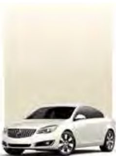
WHITE FROST TRICOAT 2