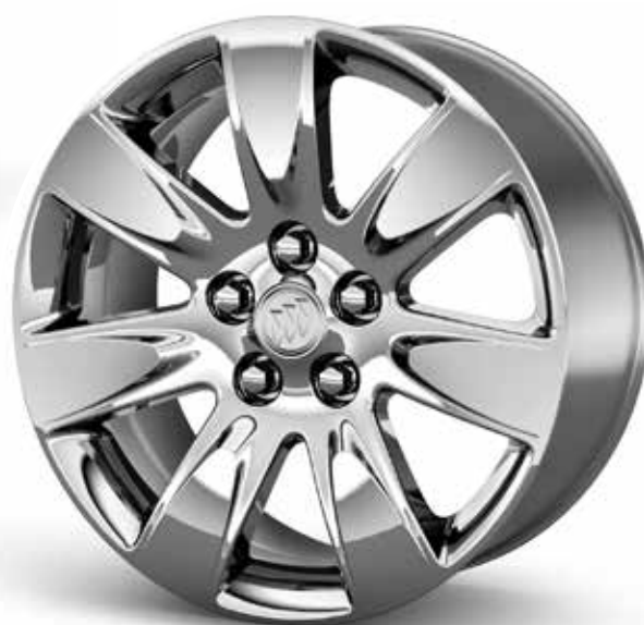
Q6Y 18" CHROMED ALLOY