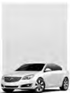
SUMMIT WHITE 1