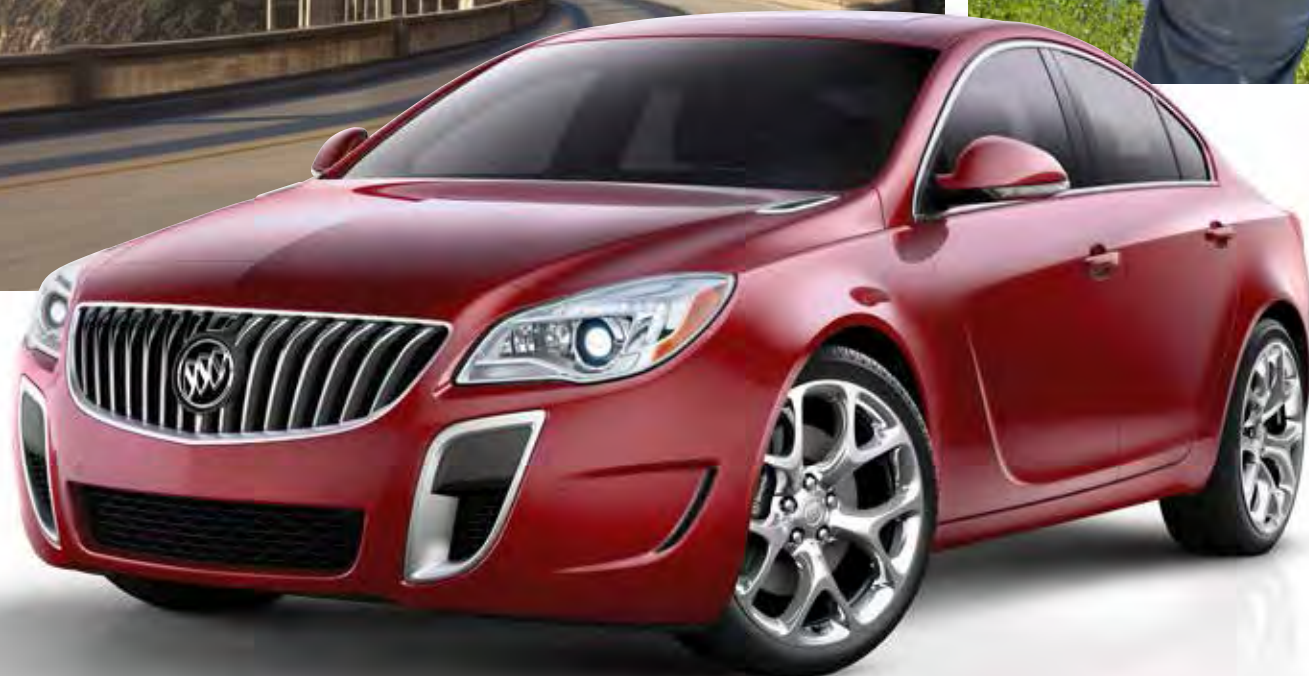
CRIMSON RED TINTCOAT shown with GS Group and optional equipment.