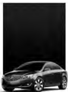
EBONY TWILIGHT METALLIC