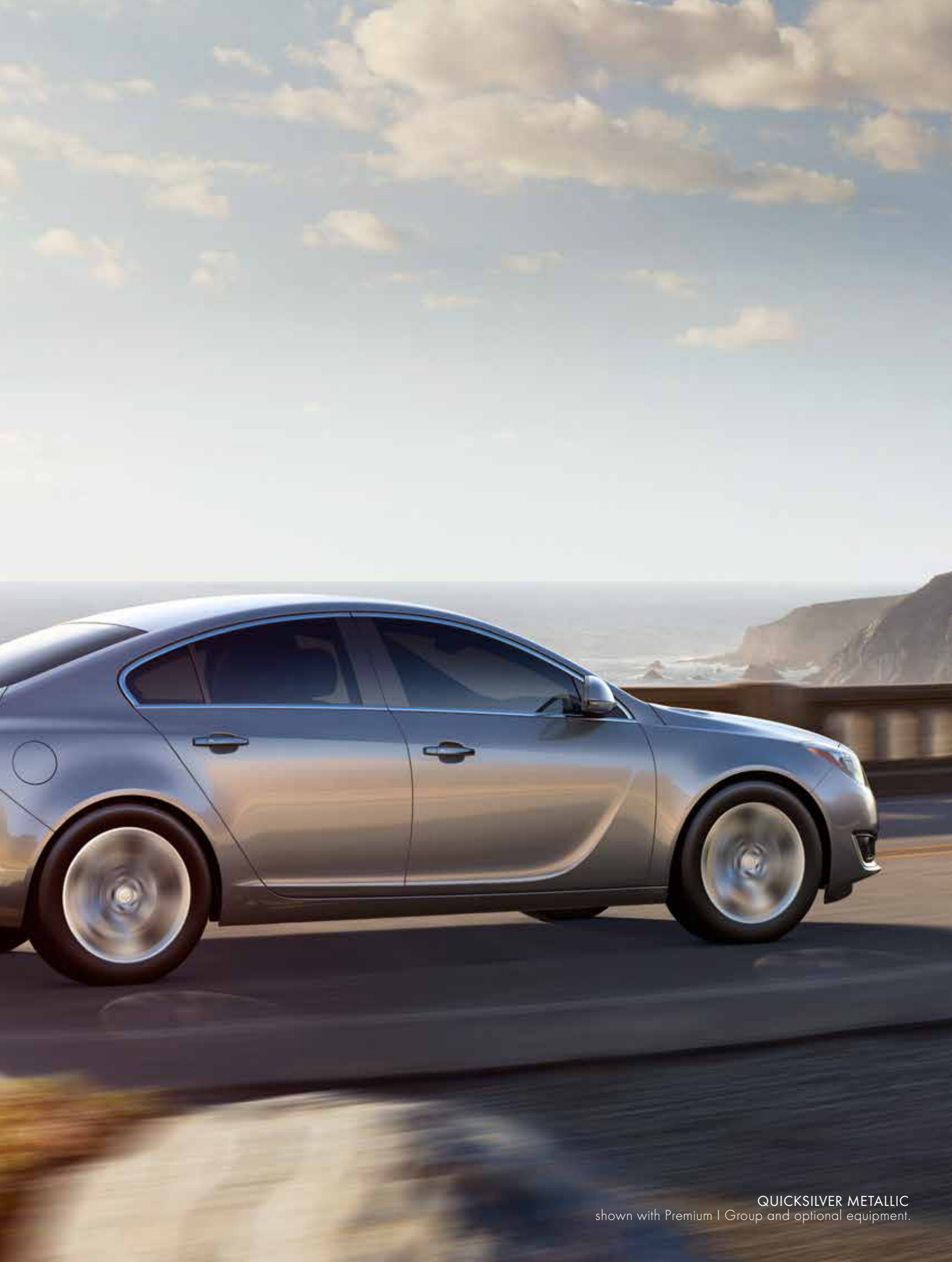
QUICKSILVER METALLIC shown with Premium I Group and optional equipment.