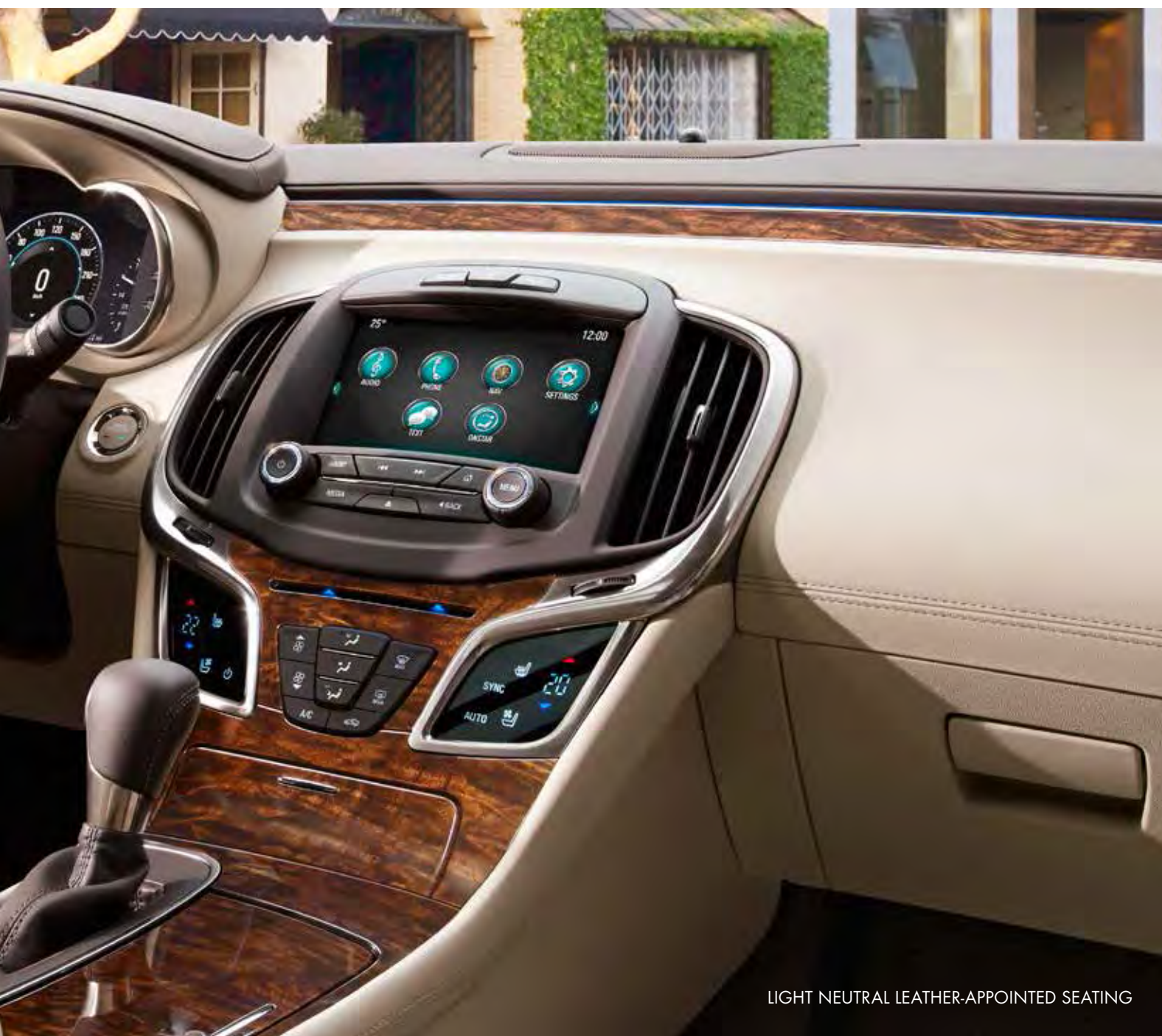
LIGHT NEUTRAL LEATHER-APPOINTED SEATING

Settle into the available premium leather-appointed seating. Ice-blue ambient lighting and the soft-touch instrument panel surround you to make your ride more comfortable and enjoyable. Directly in front of the driver, there's a 203 mm (8") diagonal Driver Information and Cluster Display that can be configured with the information you use most often. Atop the centre console is a 203 mm (8") diagonal colour touch-screen that makes it easy to use the latest generation of IntelliLink, 1 Buick's acclaimed infotainment system. Below the centre screen, the dual-zone climate controls and available heated and ventilated front seats can be easily controlled by using intuitive capacitive touch controls, meaning fewer buttons and putting every control just where you need it. Your passengers' comfort isn't left to chance, either. In fact, our engineers designed first-class rear seating in this luxury sedan to have more rear leg room than even the Lexus ES 350, Acura TL and Infiniti Q70 sedans. 2