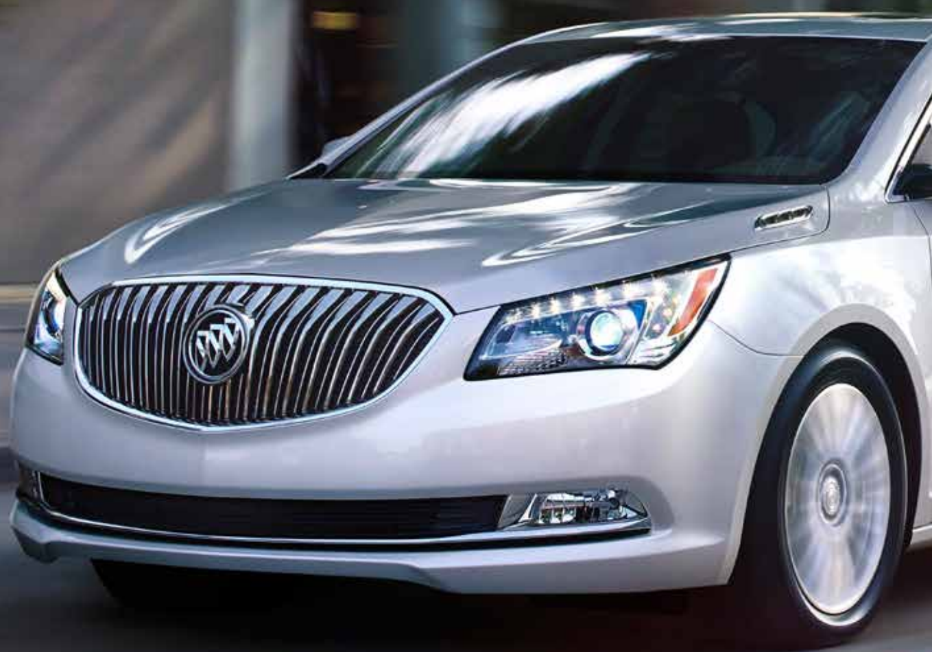
QUICKSILVER METALLIC shown with Premium II Group and optional equipment.