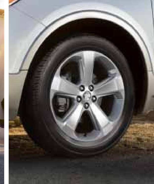
18" PAINTED CAST ALUMINUM