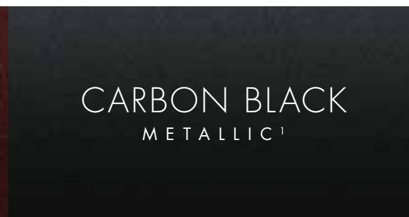
CARBON BLACK METALLIC 1