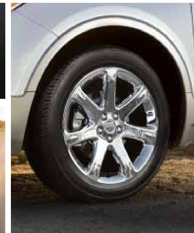
18" CHROMED ALUMINUM