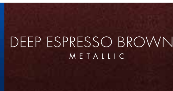
DEEP ESPRESSO BROWN METALLIC