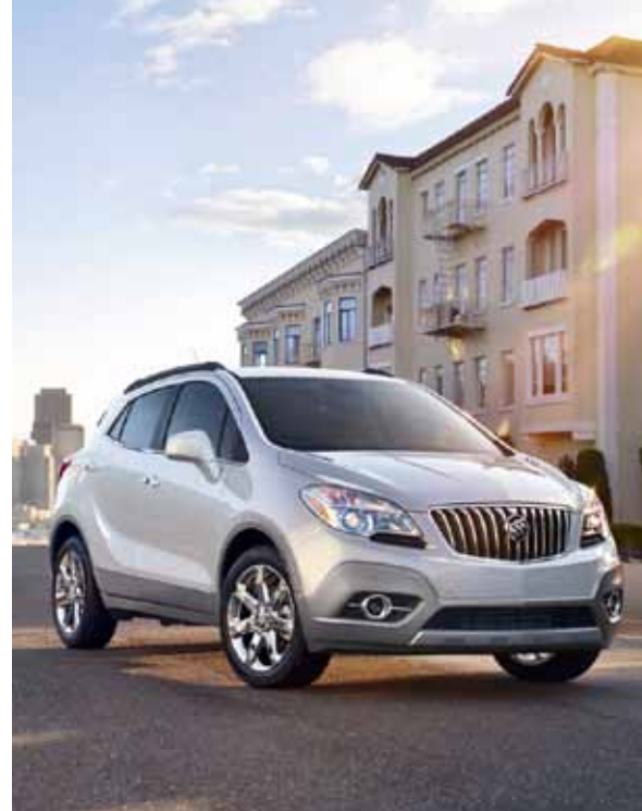
WHITE PEARL TRICOAT 1