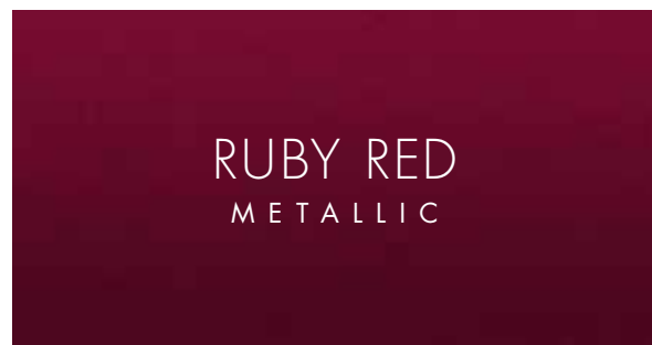
RUBY RED METALLIC