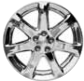
RV8 18" CHROMED ALUMINUM (AVAILABLE)