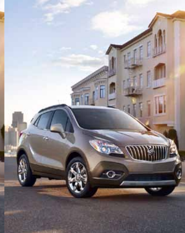
COCOA SILVER METALLIC