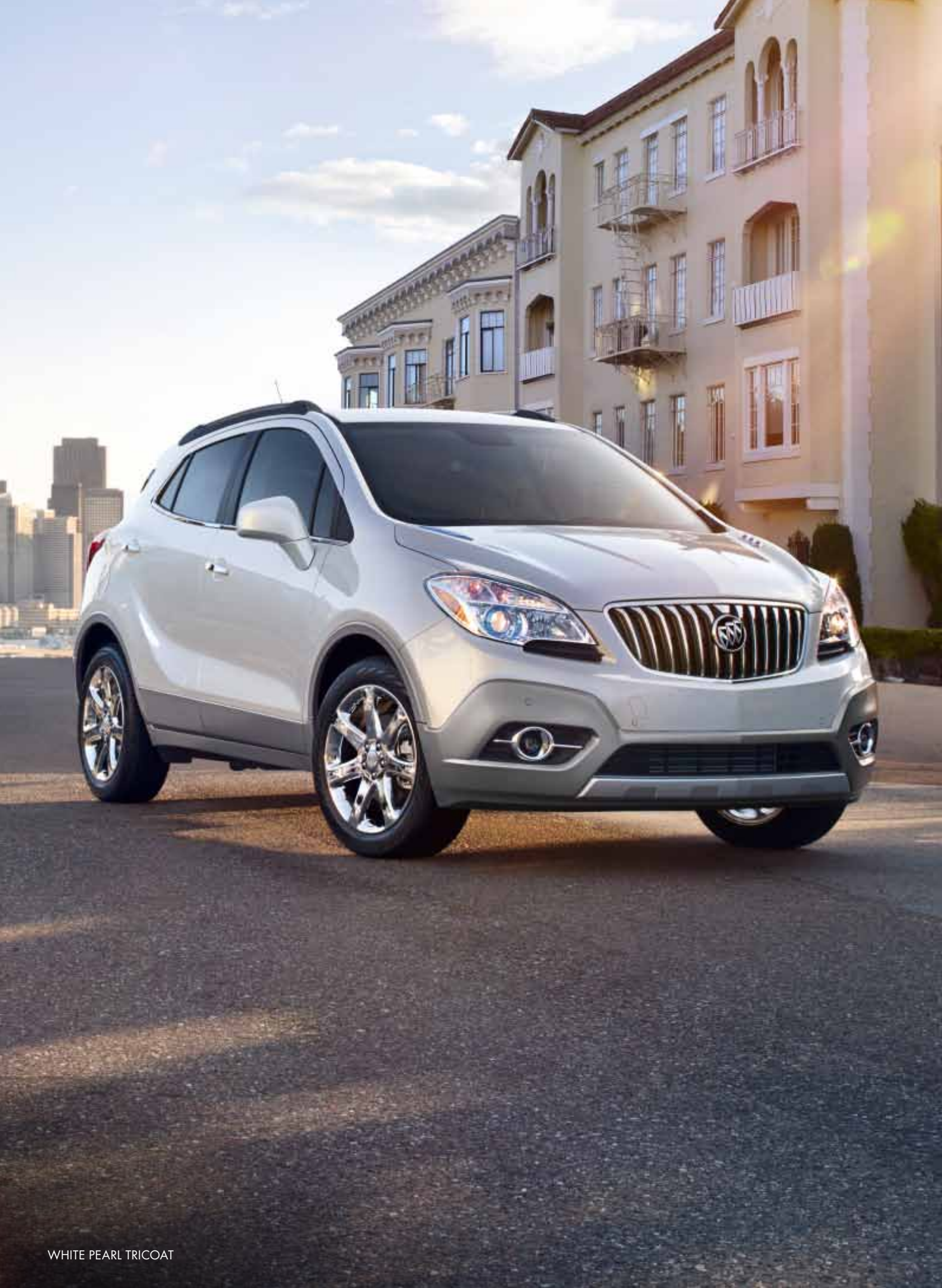
WHITE PEARL TRICOAT