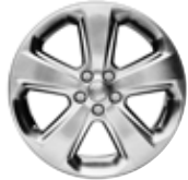
RV6 18" CAST ALUMINUM, PAINTED (STANDARD)