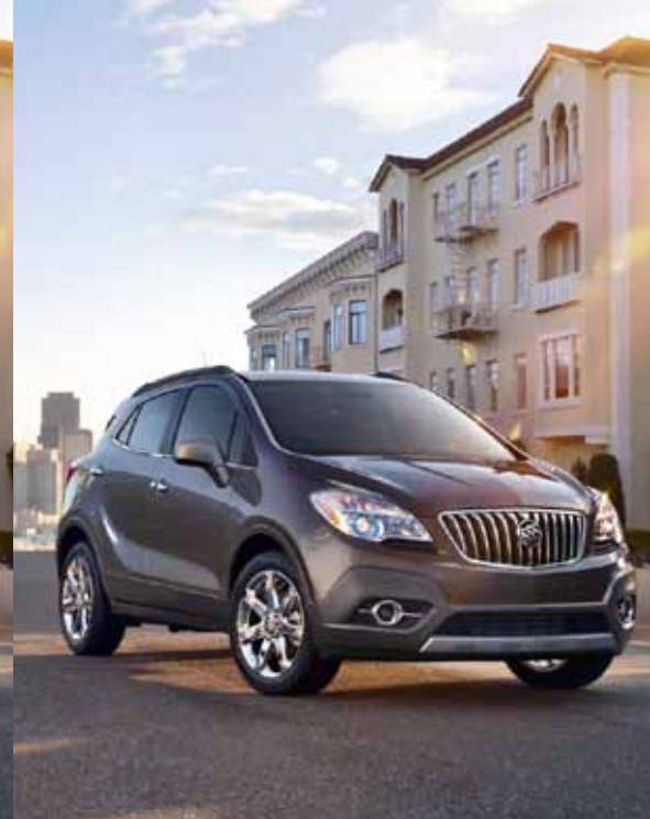
SATIN STEEL GRAY METALLIC