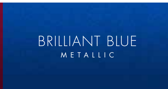
BRILLIANT BLUE METALLIC