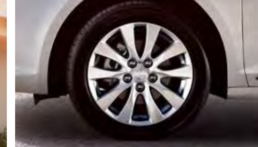
17" MACHINE-FACED SILVER PAINTED ALLOY