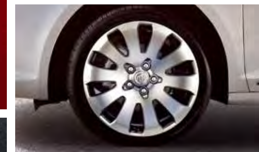
19" SILVER PAINTED ALLOY