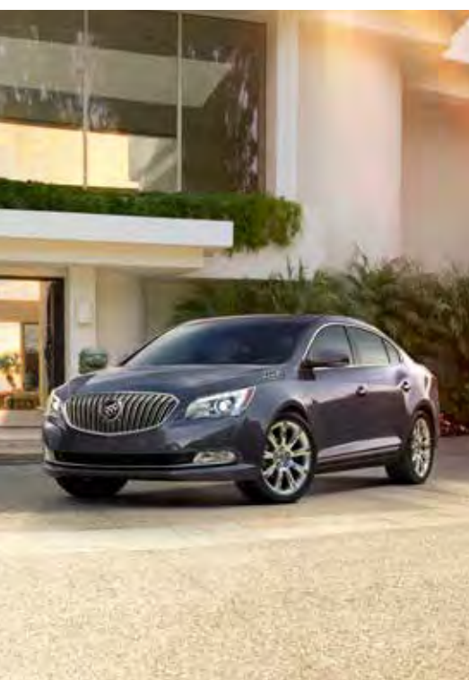
CARBON BLACK METALLIC 1