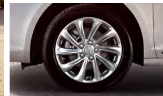
18" STERLING SILVER PAINTED ALLOY