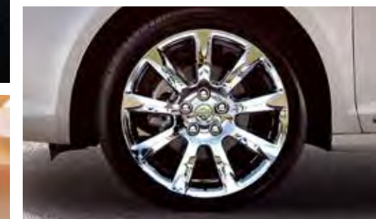
19" CHROME ALLOY