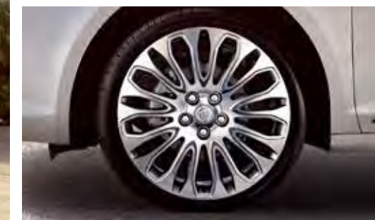
20" MACHINE-FACED SILVER PAINTED ALLOY