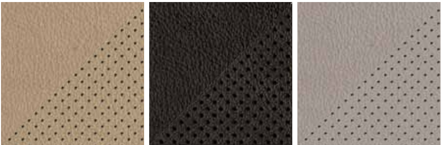
Cashmere leather-appointed seating Ebony leather-appointed seating Titanium leather-appointed seating