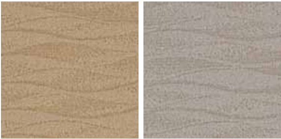
Cashmere Cloth Titanium Cloth