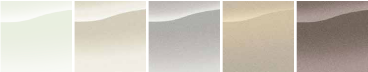
Summit White White Diamond Tricoat 1 Quicksilver Metallic Gold Mist Metallic Mocha Steel Metallic