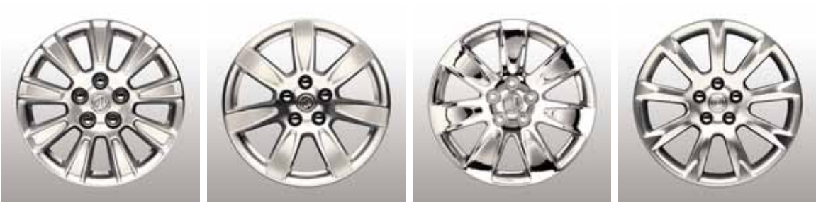
Q05 17" machined alloy PW2 18" machine-faced alloy, painted Q52 18" chrome Q70 19" 9-spoke painted, machined alloy