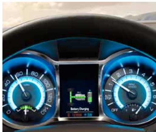
THE ECOTEC ENGINE WITH eASSIST TECHNOLOGY ACHIEVES A CLASS-LEADING 25 CITY AND 36 HIGHWAY MPG. 1