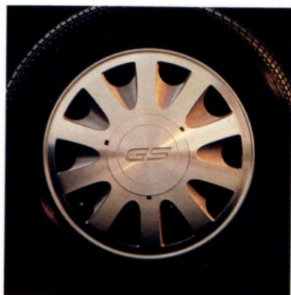
Gran Sport aluminum wheels