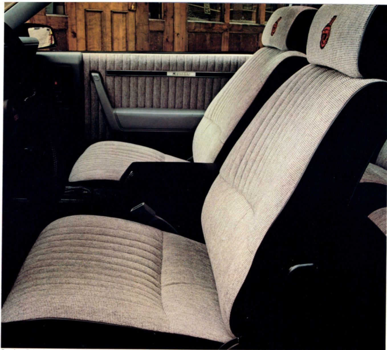
Front reclining bucket seats

Inside and out, the new Century Gran Sport comes with an impressive number of standard features, and special touches that make this a sensational sport coupe.