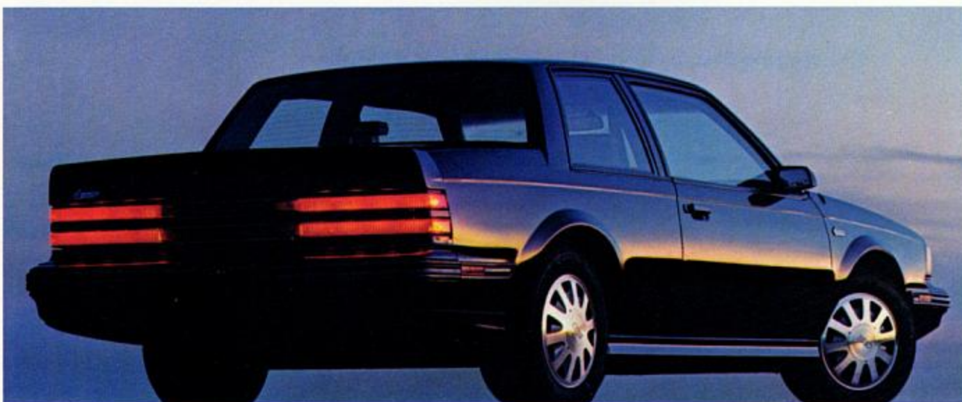
Rakish deck lid spoiler