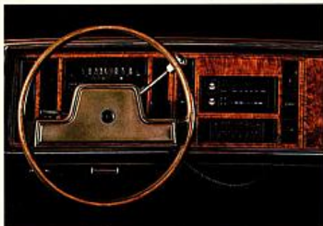
Instruments in Canada are metric where required.

The original Riviera was designed to be a personal luxury car. In the intervening two decades, that singular concept has remained unchanged. The car makes a forceful statement about you. The looks are classic. Elegant. Inside, the Riviera maintains its panache in the grand Buick tradition. Comfort abounds, providing luxury in exceptional amounts.