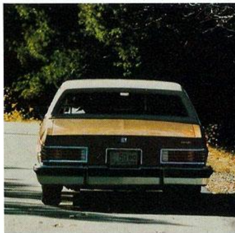
LeSabre Limited Sedan

Outside, it's LeSabre styling at its best. Inside, it treats you to a choice of standard all-cloth or all-vinyl interiors with a notchback front seat. Or, you can have a cloth front, vinyl rear seat combination. The practical side of LeSabre is its 87.9 cubic feet (2488 litres) of