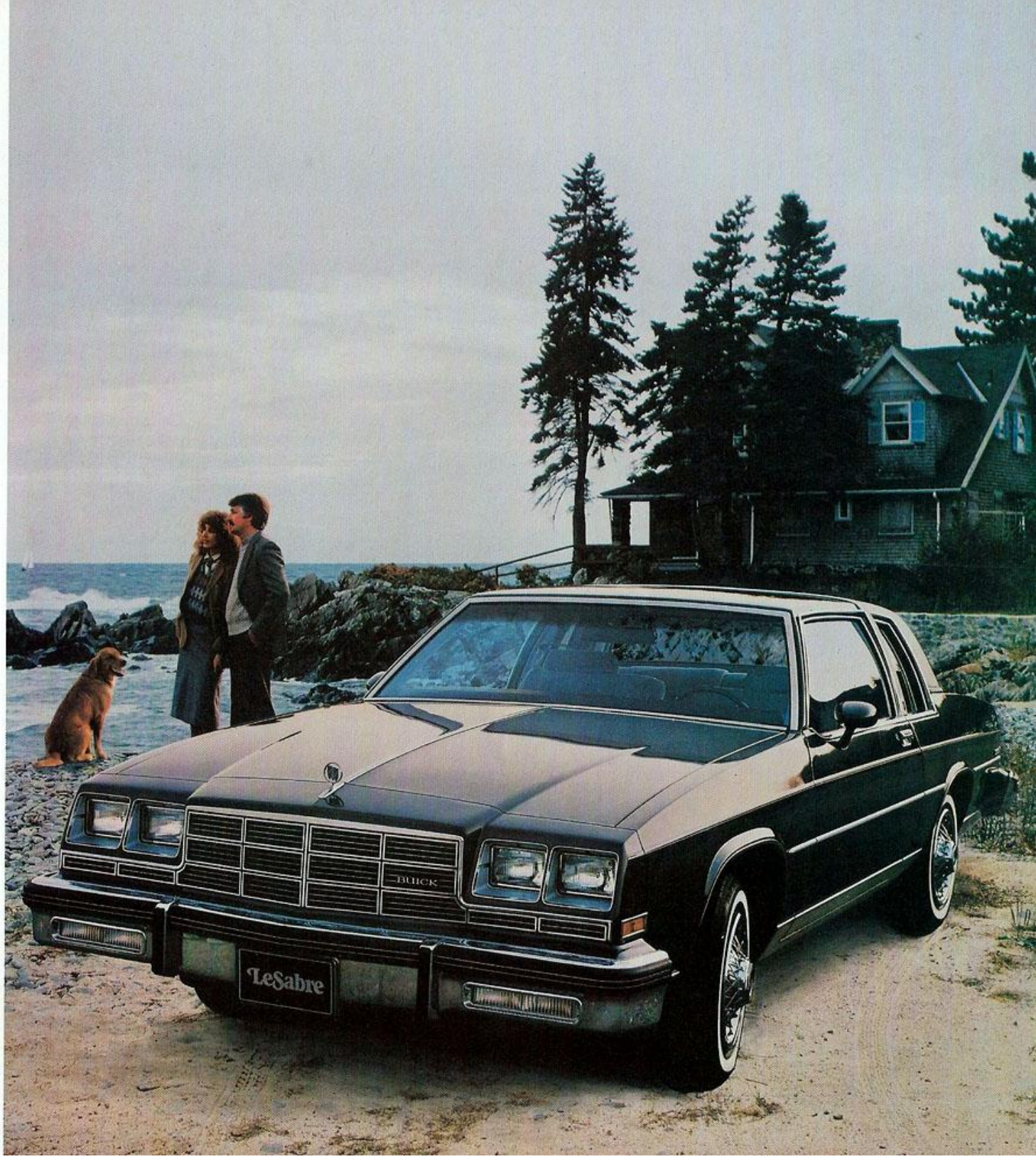
LeSabre Custom Coupe

LeSabre. Practical? Of course. Luxurious? Naturally; it's a Buick. But ordinary? Never.