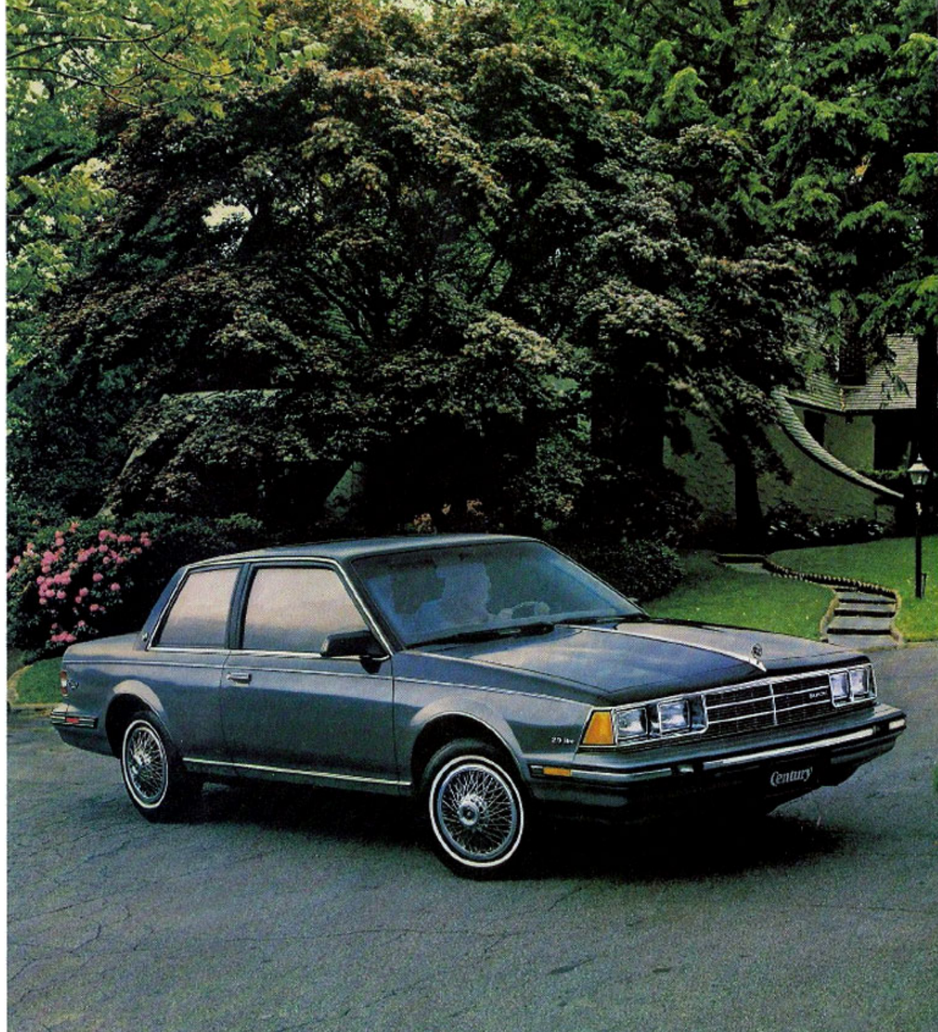
Century Custom Coupe

But you have to drive one of Buick's front-wheel-drive Centurys to appreciate all that we've told you. Once you do, we feel that you'll become convinced.