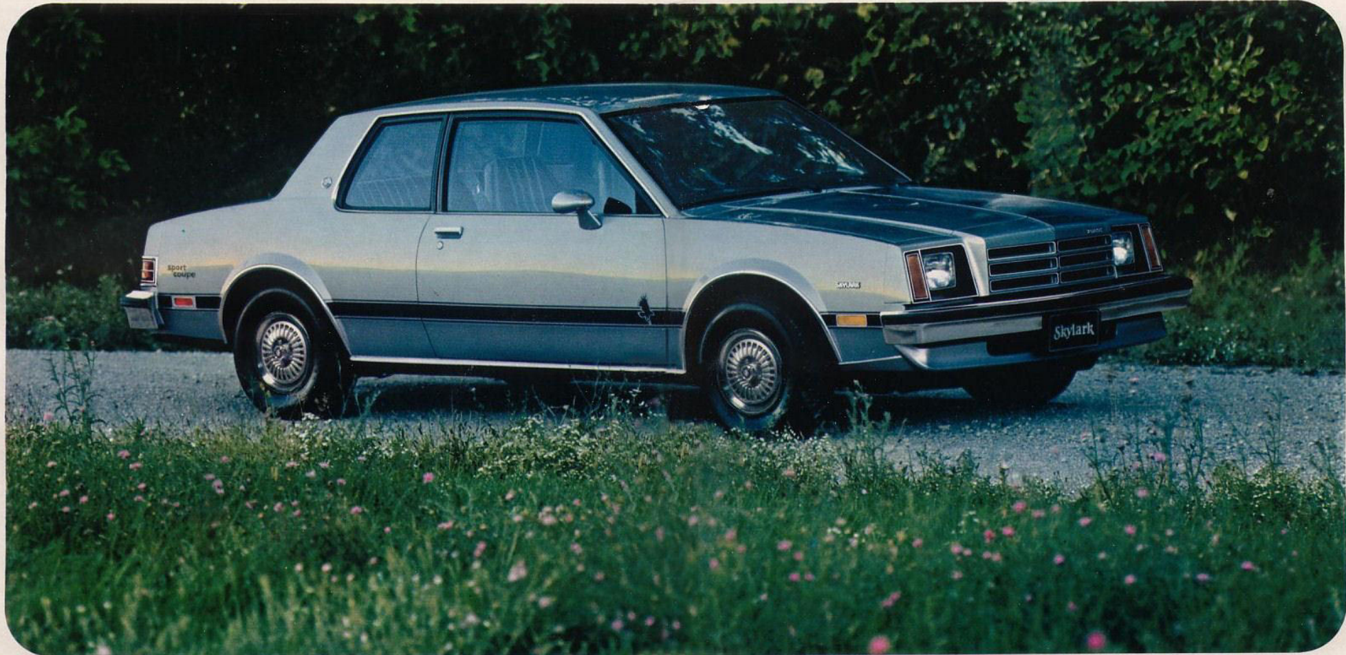
A Skylark Sport Coupe.

So, all you really have to do to select your Skylark is decide what kind of car you want it to be.