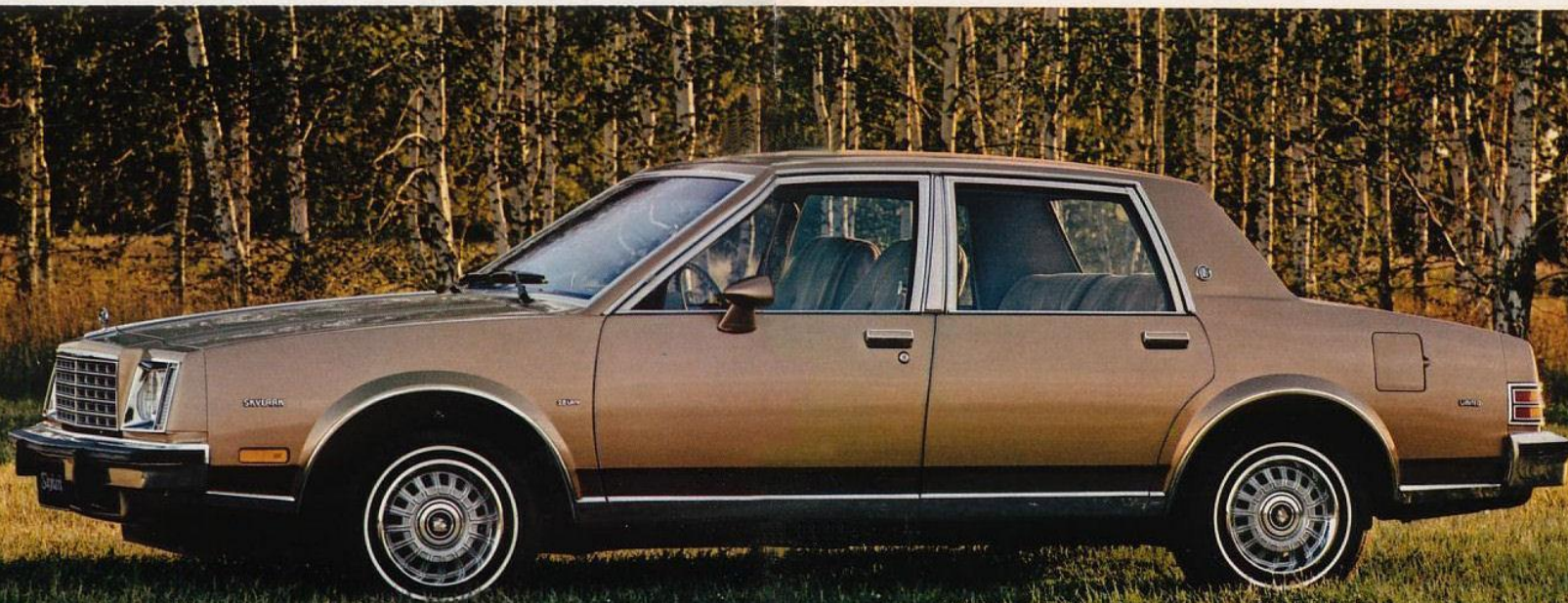
A Skylark Limited Sedan.

All in all, Skylark is a car that will hold a very special appeal for the driver in you, while it treats your passengers with the utmost consideration.