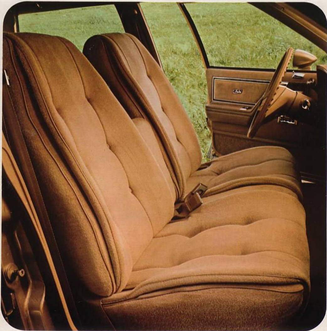
A Skylark Limited interior.