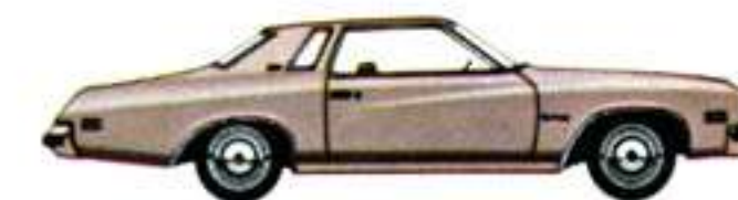
Century Luxus Colonnade Hardtop Coupe

Traditionally great. Traditionally Buick.