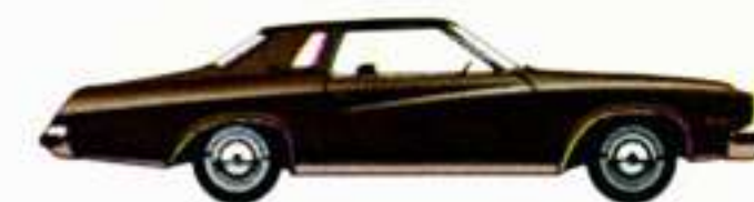
Regal Colonnade Hardtop Coupe

Foreground —Century Regal Colonnade Hardtop Sedan.