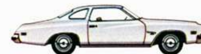
Century 350 Colonnade Hardtop Coupe

With all this going for you, wouldn't you really rather have a Buick?