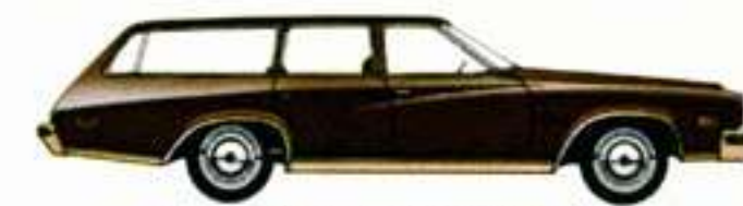
Century Luxus Station Wagon

Now, wouldn't you really rather have a Buick?