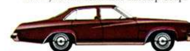
Century Luxus Colonnade Hardtop sedan