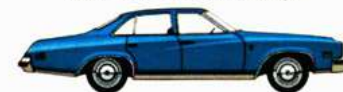
Regal Colonnade Hardtop Sedan