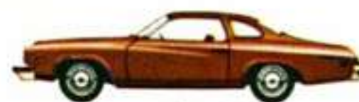
Century Gran Sport

And if you want a little more engine in your Gran Sport, you can choose from a 350 4-bbl., a 455 2-bbl., a 455 4-bbl., or the 455 Stage 1. The Stage 1 package includes the modified, high-performance 455 4-bbl. V8, a high-energy ignition system, dual exhaust, dual snorkel air cleaner, power front disc brakes, and Positive Traction differential.