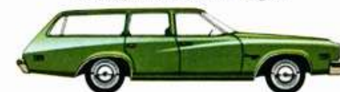
Century 350 Station Wagon