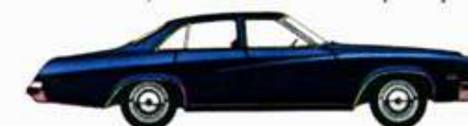
Century 350 Colonnade Hardtop Sedan

CENTURY 350 STANDARD EQUIPMENT All reassurance features plus: 350-2 bbl. V8 engine. Turbo Hydra-matic transmission. Bright roof drip moldings. Bright rear window reveal molding. Dome lamp with driver's door switch. Armrests front and rear. Depressed-park windshield wipers. Variable-ratio power steering. Manual front disc brakes. Trued tires and concentric wheels. Bright hubcaps. Rear quarter window moldings. Indicator lamps for brake, water temperature, alternator and oil pressure. Exhaust emission control system. Semi-closed cooling system. Foot-operated parking brake. Cigarette lighter. Ashtrays front and rear. Full-width bench seat in cloth and vinyl or all-vinyl. Narrow rocker panel molding. Full-Flo ventilation. Trunk compartment mat. Hood rear molding. Nylon-blend, cut-pile carpeting. Set-and-close door locking system. Time-modulated choke. Nickel-plated exhaust valves. Deluxe steering wheel.