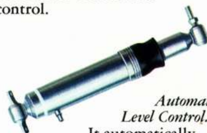
Automatic Level Control.

On any mid-size Buick, standard left-hand mirror may be ordered with remote control.