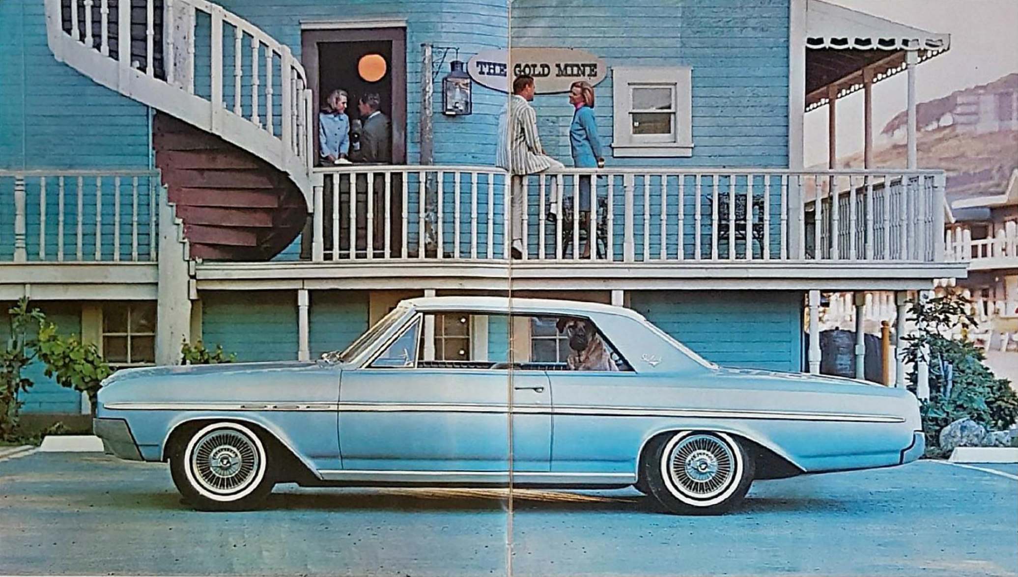
Illustrated: The Buick Skylark Sedan Sport Coupe with custom fabric roof cover

This is the Buick SKYLARK. It's bigger, sleeker and smoother in '64 yet it's light on its feet as a kitten. We've put a big helping of performance, comfort and luxury into this one. Don't let the size fool you. All in all, a very personal car.