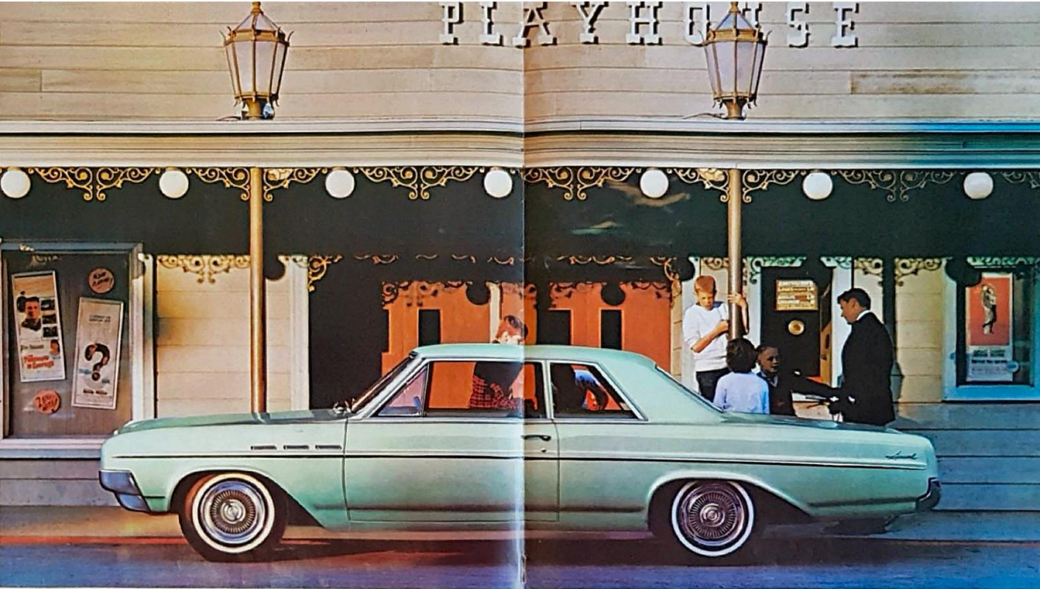
Illustrated: The Buick Special Deluxe 2-door coupe

THIS IS A BUICK SPECIAL. If you're particular about how you spend a dollar, this car will hold out a bundle of appeal. It's now almost full-size, but still goes at "compact" prices. With this great one, the name of the game is "value."