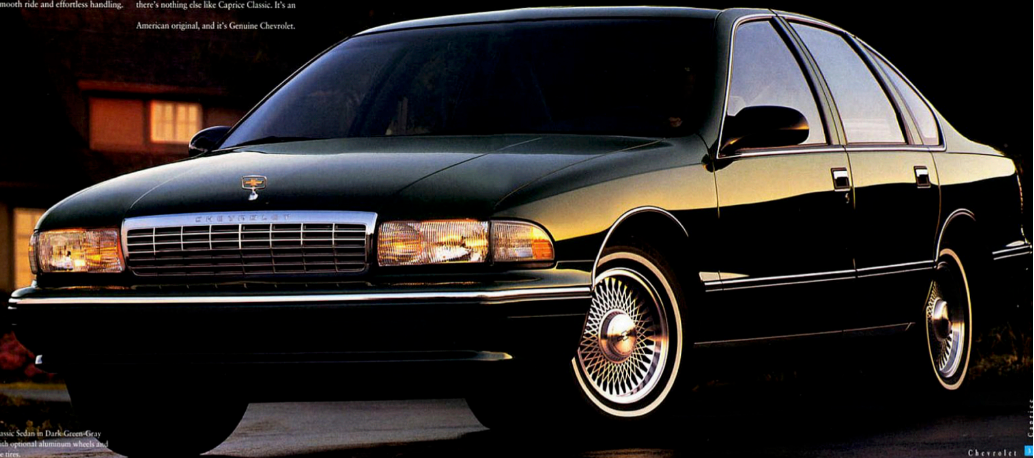
Caprice Classic Sedan in Dark Green-Gray Metallic with optional aluminum wheels and white-stripe tires.

When it comes to luxury that's affordable, there's nothing else like Caprice Classic. It's an American original, and it's Genuine Chevrolet.