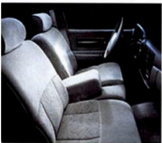
Shown above: Caprice Classic Custom Cloth interior in Gray. Shown at right: Caprice Classic interior with optional leather seating surfaces. Other options shown.

You could settle for less than the quiet, spacious world of Caprice Classic. But why would you want to?