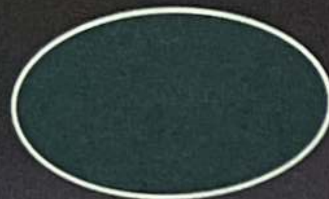
Dark Green-Gray Metallic