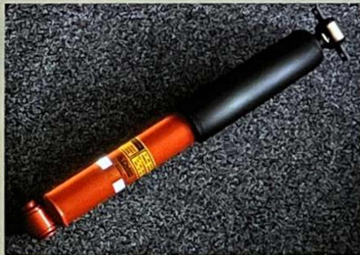
A specially-tuned de Carbon shock absorber and coil spring at each wheel deliver impressive ride characteristics while maintaining road feel. The Special Ride and Handling Suspension also includes tuned front and rear stabilizer bars.