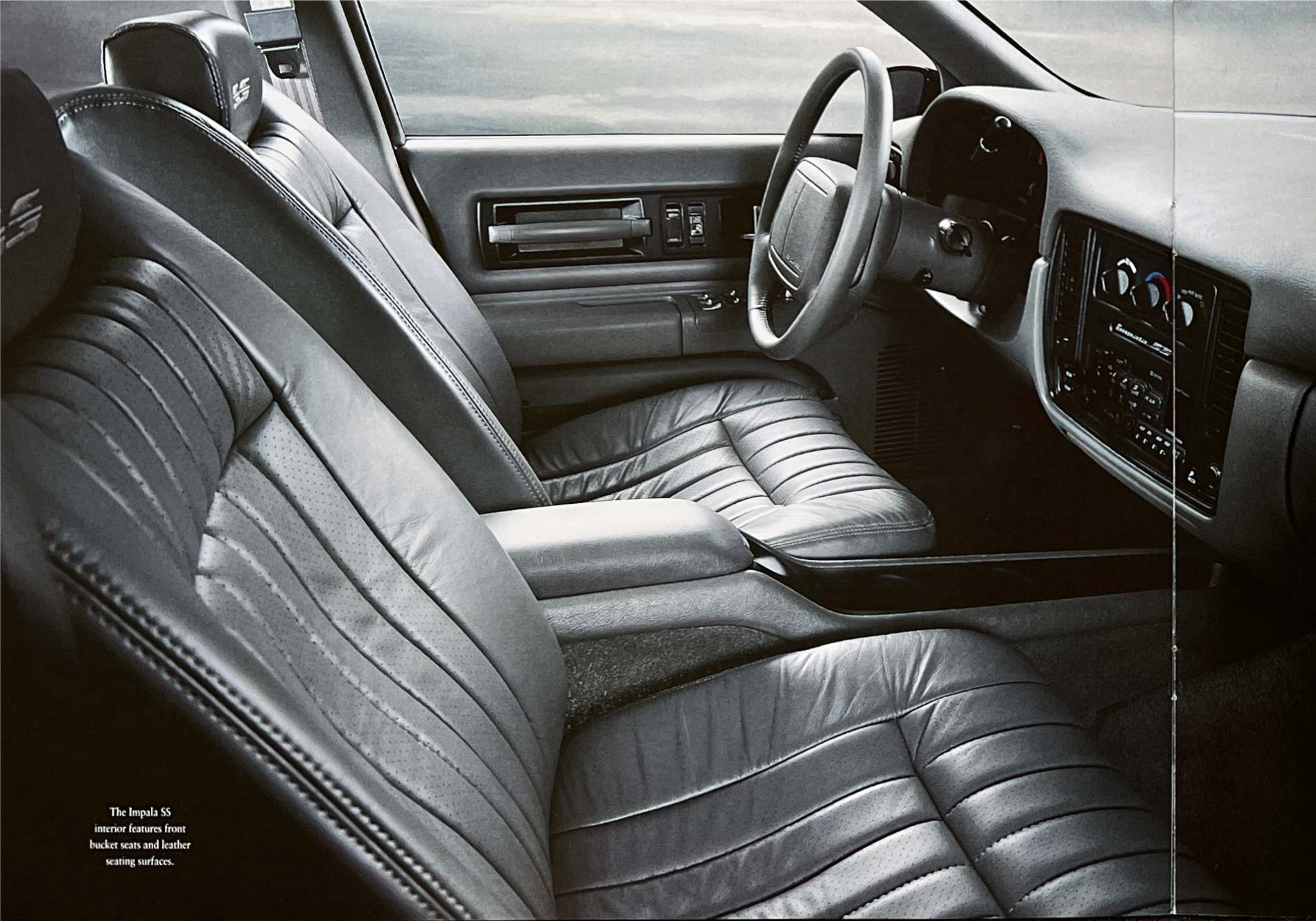
The Impala SS interior features front bucket seats and leather seating surfaces.

Impala SS surrounds you with luxury and quality appointments. Accommodations are for five.