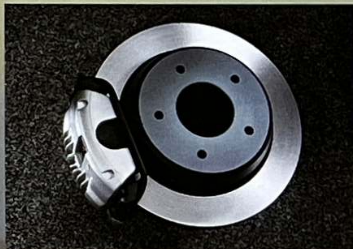
Standard on Impala SS: a large-diameter disc brake at each wheel and a four-wheel anti-lock brake system (ABS).