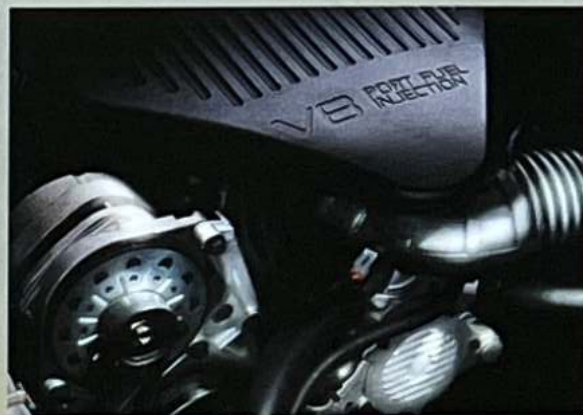
The 5.7 Liter V8 with Sequential-Port Fuel Injection delivers 260 horsepower at 4800 rpm. Platinum-tipped spark plugs are designed to last up to 100,000 miles.

There are other sport sedans offering similar V8 power and performance technology. They also happen to cost thousands more than the 1995 Impala SS.