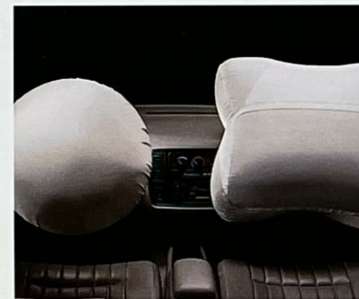
Driver- and front passenger-side air bags are standard in every 1995 Impala SS. Always wear safety belts, even with air bags.

Also standard: PASS-Key II, a totally passive theft-deterrent system. Only your special coded ignition key starts your Impala SS. If an attempt is made to start the car without the proper key, the ignition system is disabled.