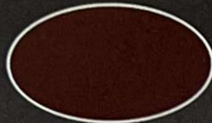
Dark Cherry Metallic