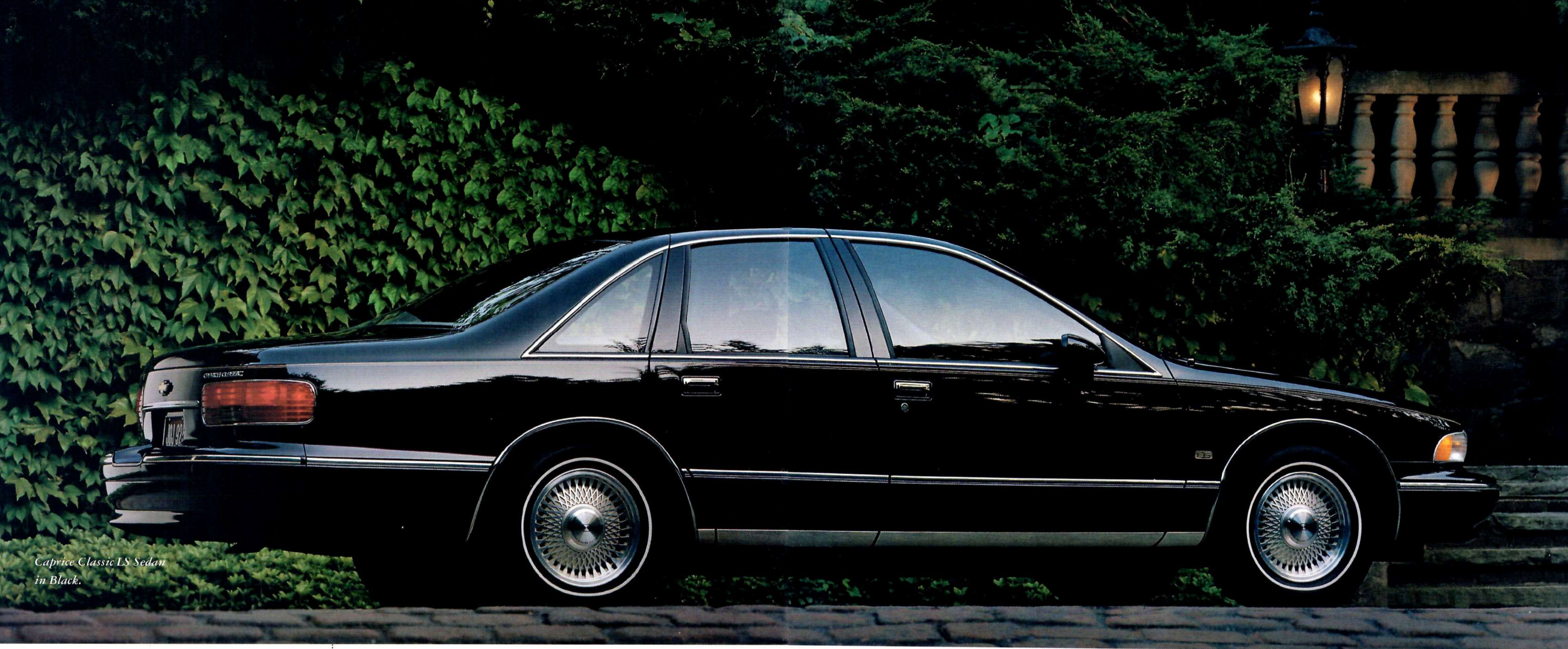
Caprice Classic LS Sedan in Black.

Caprice Classic LS is the top-of-the-line Chevrolet sedan. And it offers just about anything you could want in a full-size car.