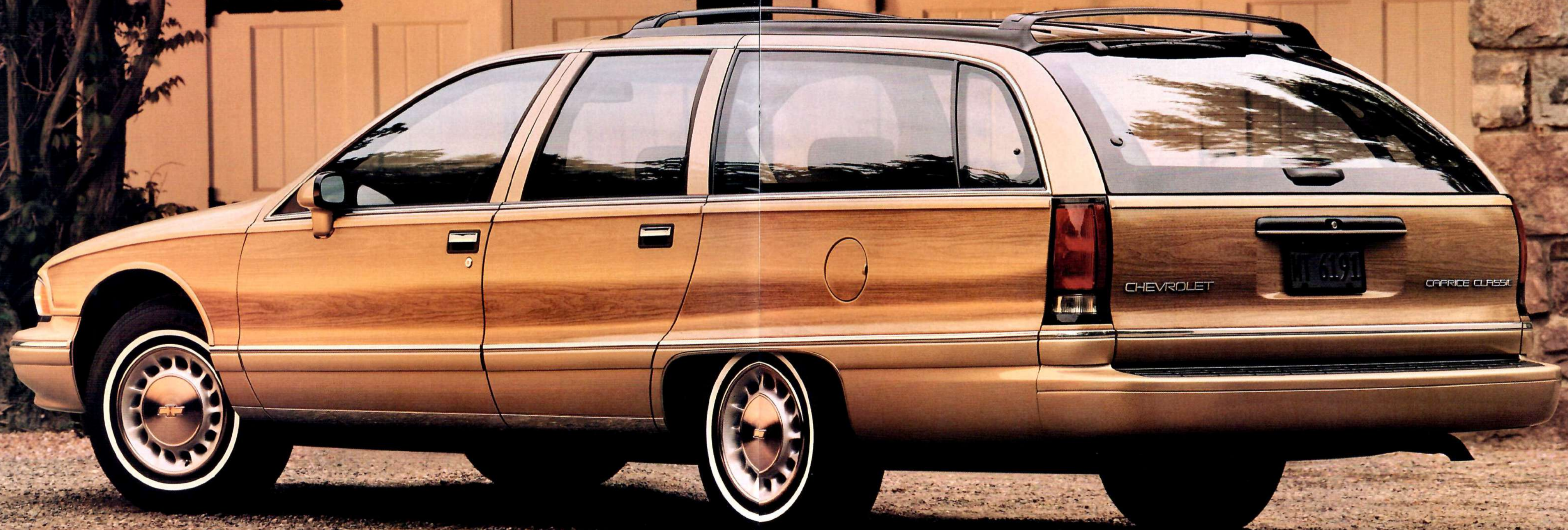
Caprice Classic Wagon in Light Driftwood Metallic with optional simulated woodgrain trim.

Classic Wagon in a while, you're in for a real treat. The new 4300 V8 delivers 200 smooth horsepower. Or you can select a new optional 260-hp LT1 V8. You just can't buy a more powerful, more spacious wagon than this Chevrolet.