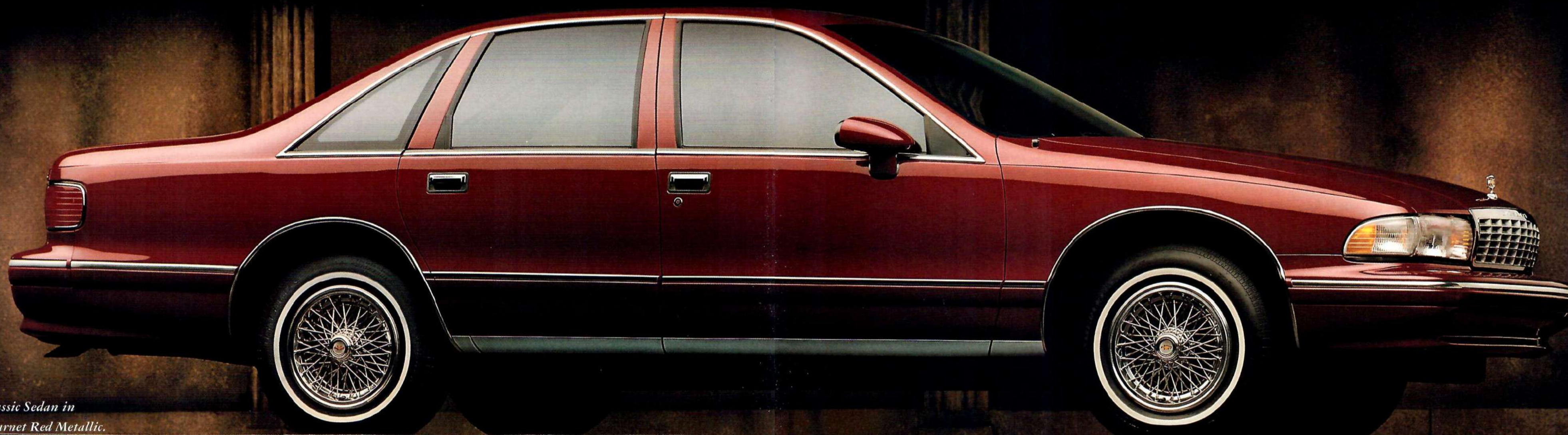
Caprice Classic Sedan in Medium Garnet Red Metallic.

The spacious 20.4-cu.-ft. Caprice Classic trunk. An optional cargo net helps keep small packages secure.