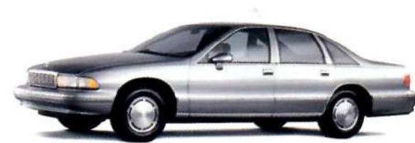
Caprice Classic Sedan

*When properly equipped with available options.