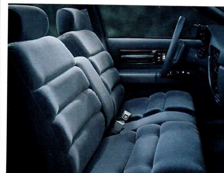
Caprice Classic LS Custom Cloth interior in Medium Blue.

A Delco AM/FM stereo with a seek-scan feature, cassette tape player and digital clock is standard in Caprice Classic LS. Or you may order the optional Delco AM/FM stereo with integral CD player and Delco-Loc II security feature. Both systems provide sound that is precisely tailored to the interior acoustics of the Caprice Classic.