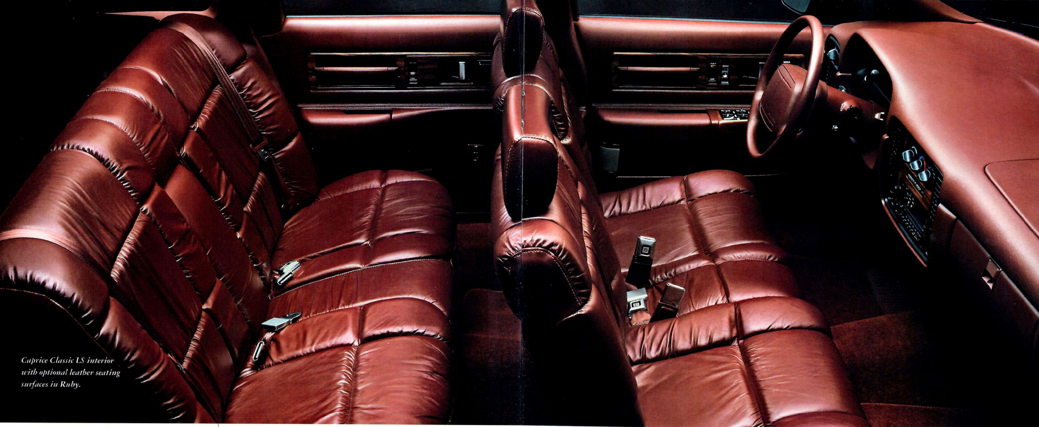
Caprice Classic LS interior with optional leather seating surfaces in Ruby.