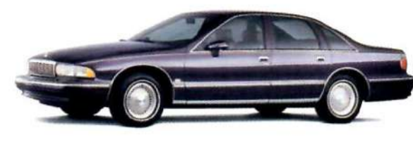
Caprice Classic LS Sedan