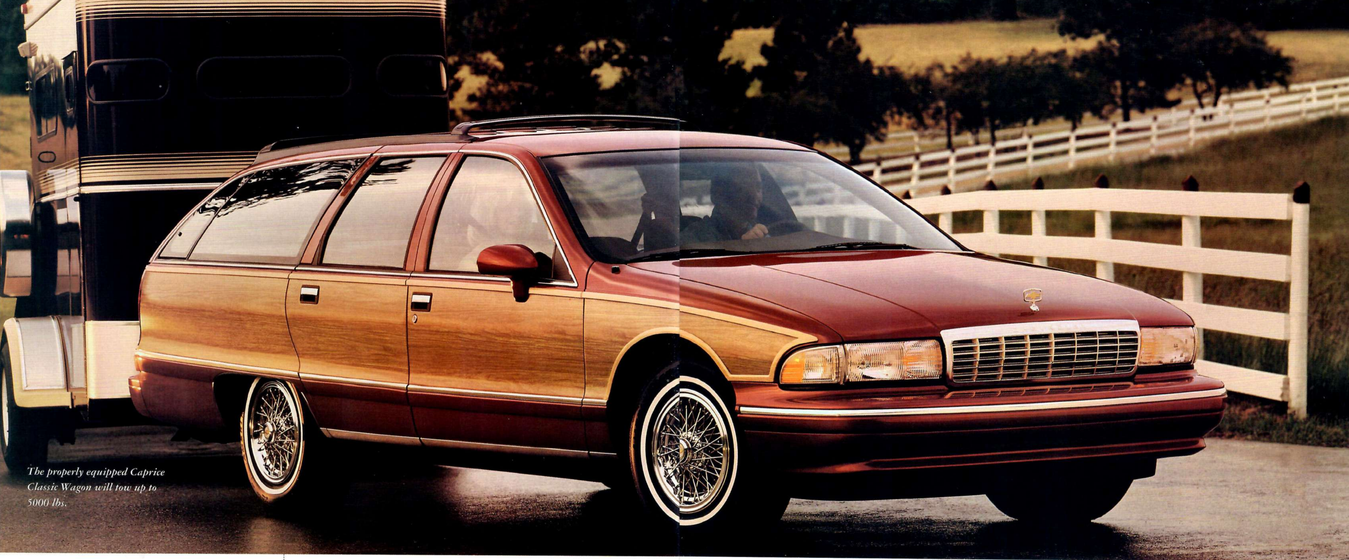
The properly equipped Caprice Classic Wagon will tow up to 5000 lbs.

Caprice Classic Wagon is the first-class way to travel. You enjoy limousine-like quiet and a beautifully smooth highway ride.