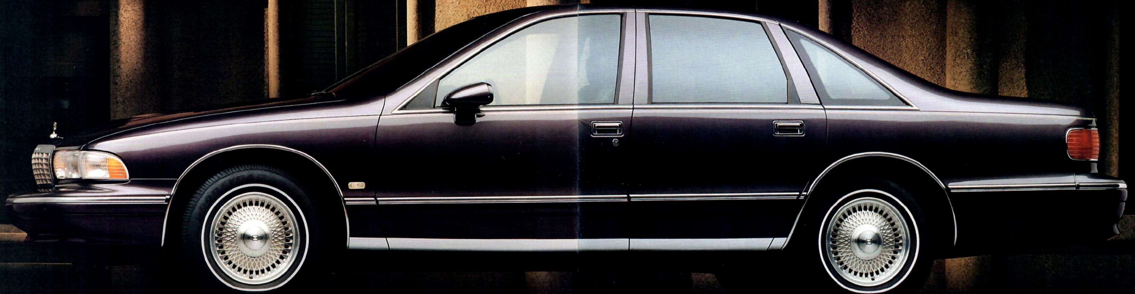
Caprice Classic LS Sedan in Purple Pearl Metallic.

*Always wear safety belts, even with air bags.