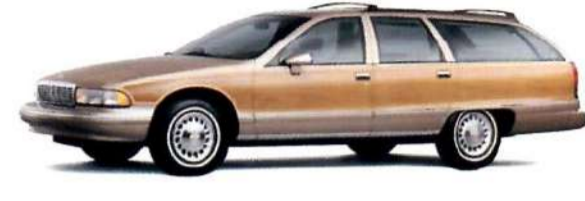
Caprice Classic Wagon