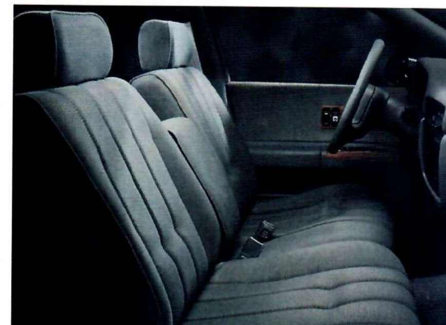
Caprice Classic interior with optional 55/45 split-bench front seat in Gray.

But the greatest luxury of all may be the stretch-out room for six adults. No Mercedes-Benz, no Lexus, and no BMW offers a larger, more accommodating interior than Caprice Classic.