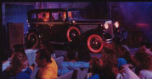
Witness a classic gangster shoot-out in 'The Great Movie Ride.'

THE Heartbeat OF AMERICA TODAY'S CHEVROLET