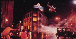
Take a fascinating backlot stroll down a classic New York street.