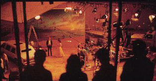
Experience live soundstage productions behind the scenes.