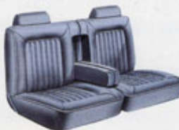
Optional Caprice Classic cloth 50/50 front seat with twin pull-down center armrests and reclining driver and passenger seat-backs.