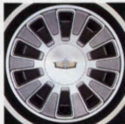
Optional Custom wheel cover (standard on Brougham models).