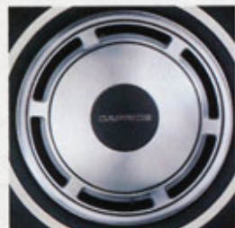
Caprice Classic standard wheel cover.