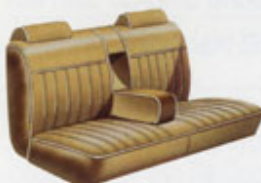
Caprice Classic vinyl bench seat with pull-down center armrest (wagon only).