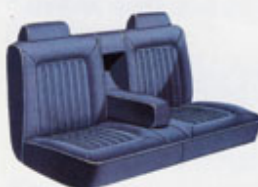
Caprice Classic cloth bench seat with pull-down center armrest.