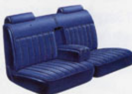
Optional Caprice Classic vinyl 50/50 bench seat with twin pull-down center armrests and reclining driver and passenger seat-backs (wagon only).