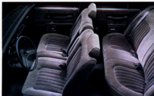
The luxurious Caprice Classic Sedan interior offers full-size comfort for six passengers. Optional 50/50 front seat with twin pull-down center armrests shown.

Caprice continues to feature Full Coil suspension for a beautifully smooth ride, full-frame construction and a proven rear-drive design.