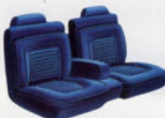
Caprice Classic Brougham/Brougham LS cloth 45/55 seat with pull-down center armrest and reclining driver and passenger seat-backs. Leather seating surfaces are optional.