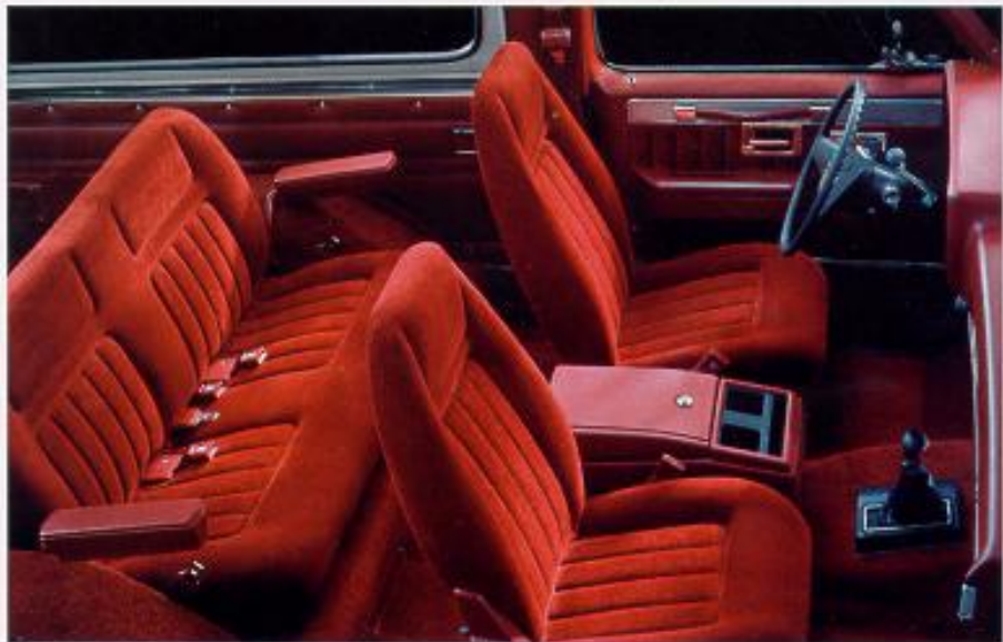
Full-Size Blazer interior with optional Silverado trim.

Shown on front cover: Full-Size Blazer with optional Silverado trim and other options. Tires supplied by various manufacturers.