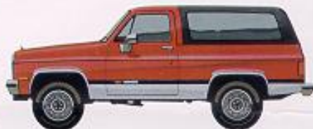
Blazer Silverado with optional Rally Wheels and optional Conventional Two-Tone.

Silverado. Chrome trim on grille, dual quad halogen headlamps, rub strip on rear bumper, bright accent on front bumper rub strip and black body-side moldings, bright wheel-opening moldings, full wheel covers.