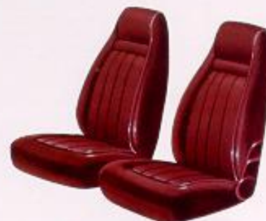
Custom Cloth reclining high-back bucket seats: optional in Silverado, not available in Scottsdale.

Silverado. High-back reclining front bucket seats with choice of Custom Vinyl or Custom Cloth trim; color-keyed carpeting; foam-backed cloth headliner; extra insulation in floor, color-keyed door trim panels and headliner; power door locks; headlamps-on warning buzzer; Custom steering wheel; black vinyl spare tire cover; electric tailgate window; door-closing assist straps; center console with storage and beverage pockets.