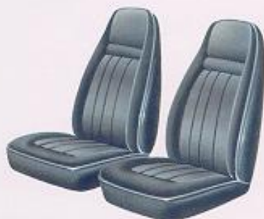
Custom Vinyl high-back bucket seats: standard in Scottsdale (reclining version standard in Silverado, optional in Scottsdale).

Scottsdale. High-back front bucket seats with Custom Vinyl trim (an optional rear bench seat in matching trim expands seating to five); AM radio; embossed black rubber floor mats in front and rear seat areas; full-length, color-keyed plastic headliner.