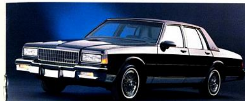
Caprice Classic Brougham Sedan with optional body-side moldings, cornering lamps, wire wheel covers and other options.

We proudly present Caprice Classic Brougham as the most exclusive way to say Chevrolet. From its stand-up hood ornament to bold taillight ensemble, Brougham quietly announces your preference for formal elegance in a highly contemporary motor car.