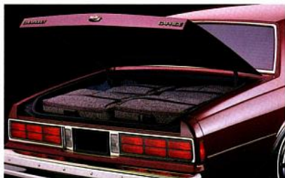
A roomy 20.9-cu.-ft. trunk is one of Caprice's many virtues.