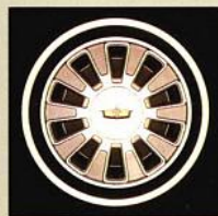
Custom wheel covers (standard on Caprice Classic Brougham).