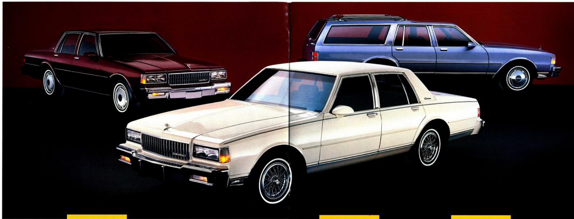
Caprice model Sedan (shown).