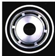
Standard full wheel cover (Caprice and Caprice Classic models).