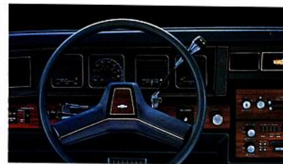
Brougham instrument panel with optional Special Instrumentation.

It is hard to imagine a more accommodating travel companion than Caprice Classic Brougham. This car's six-passenger interior is not merely luxurious, it is an environment of decided character.