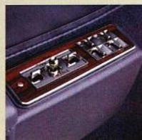
Power windows and power seat controls.