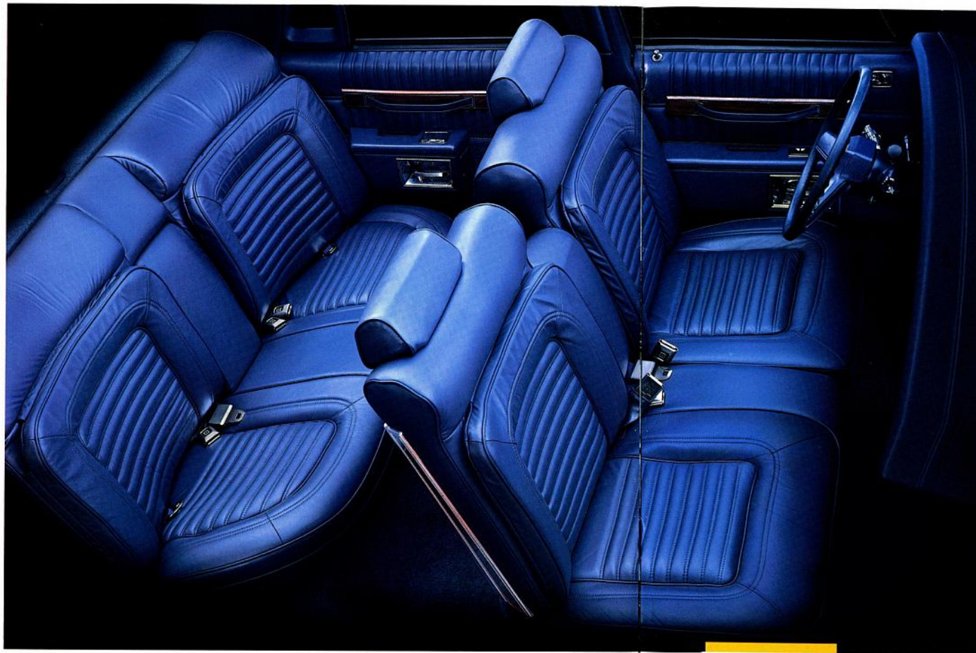
Caprice Classic Brougham interior, shown with optional genuine leather seating surfaces.