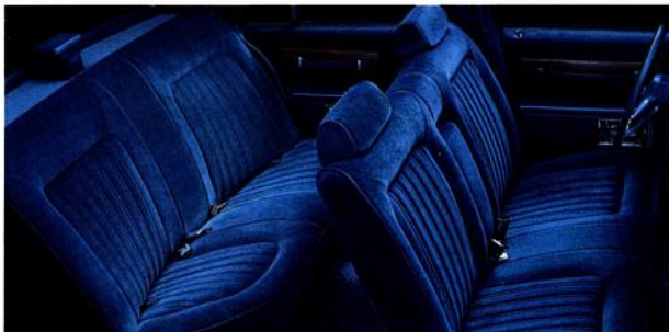
Caprice Classic Sedan interior.