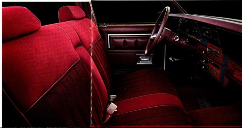
Standard cloth interior features foam-cushioned cloth seats and a front pull-down center armrest.

Caprice Sedan is one of America's lowest-priced full-size cars. Yet it offers a generous level of standard equipment that is matched by few cars.