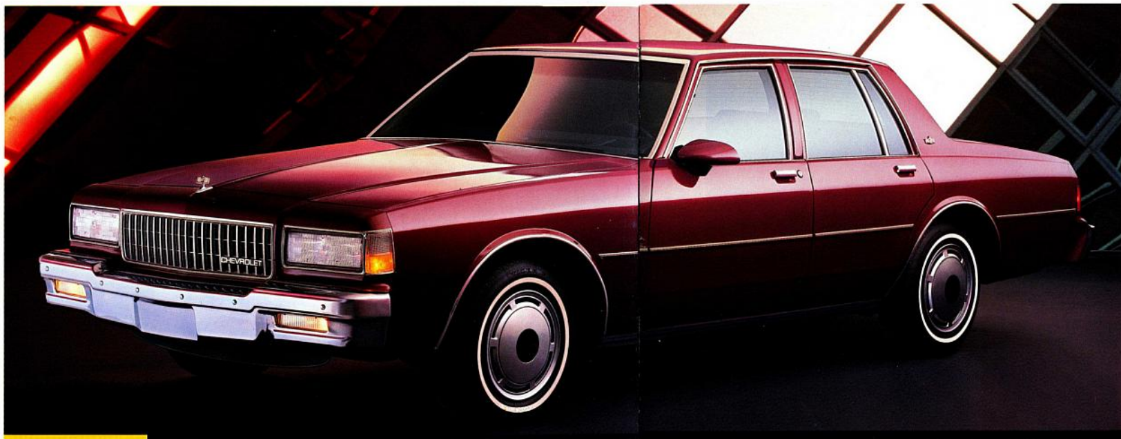
Caprice Sedan with optional body-side and wheel-opening moldings.