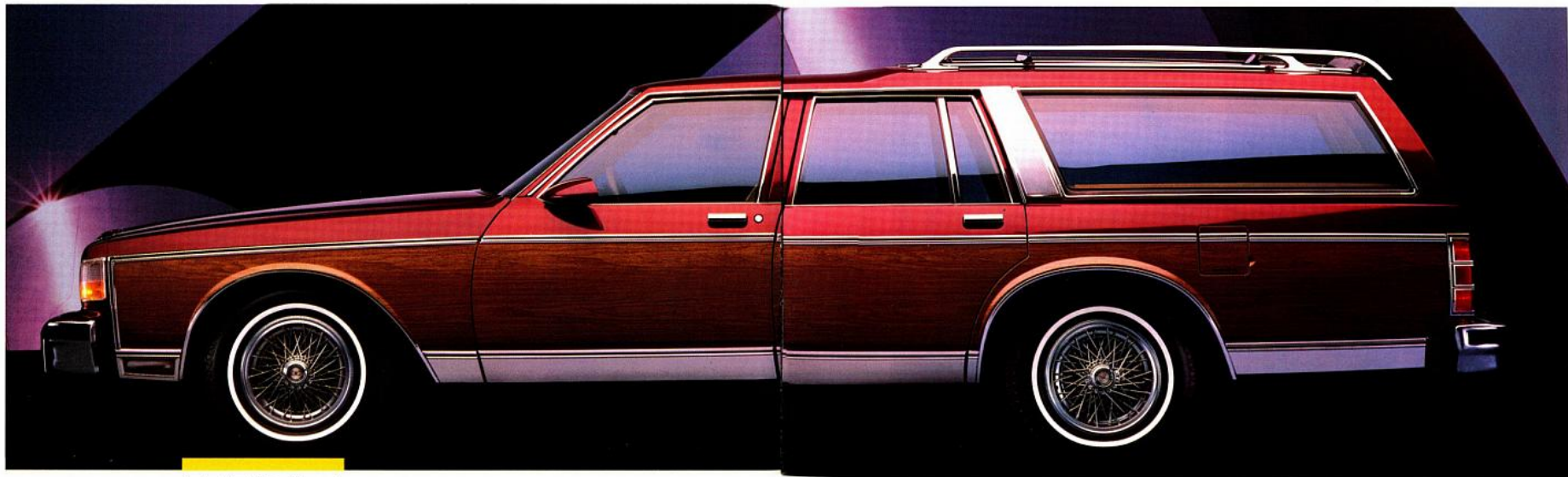
Caprice Classic Estate Wagon with optional wire wheel covers, roof carrier and other options.

Caprice Classic, America's best-selling full-size station wagon, offers convincing proof that bigger is often measurably better.