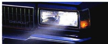
Composite-style halogen headlamps feature flush-fitting lenses and replaceable bulbs.

windshield wiper/washer) • Stand-up hood ornament • Tinted glass, all windows.