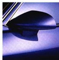
Aero-style dual sport mirrors (left-hand remote, right-hand manual).

A comprehensive array of standard features is one reason Chevrolet Caprice is one of today's best automotive values.