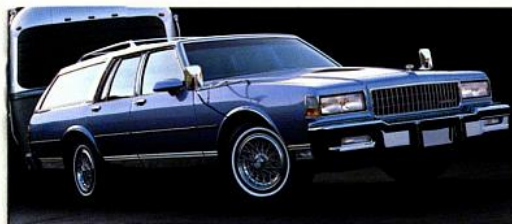
Caprice Classic Wagon with optional roof carrier, body-side moldings and other options.