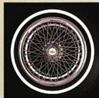
Wire wheel covers with integral locks.