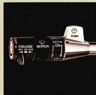
Electronic speed control with accelerate/decelerate and resume features.

*Not available Brougham LS or Estate Wagon.