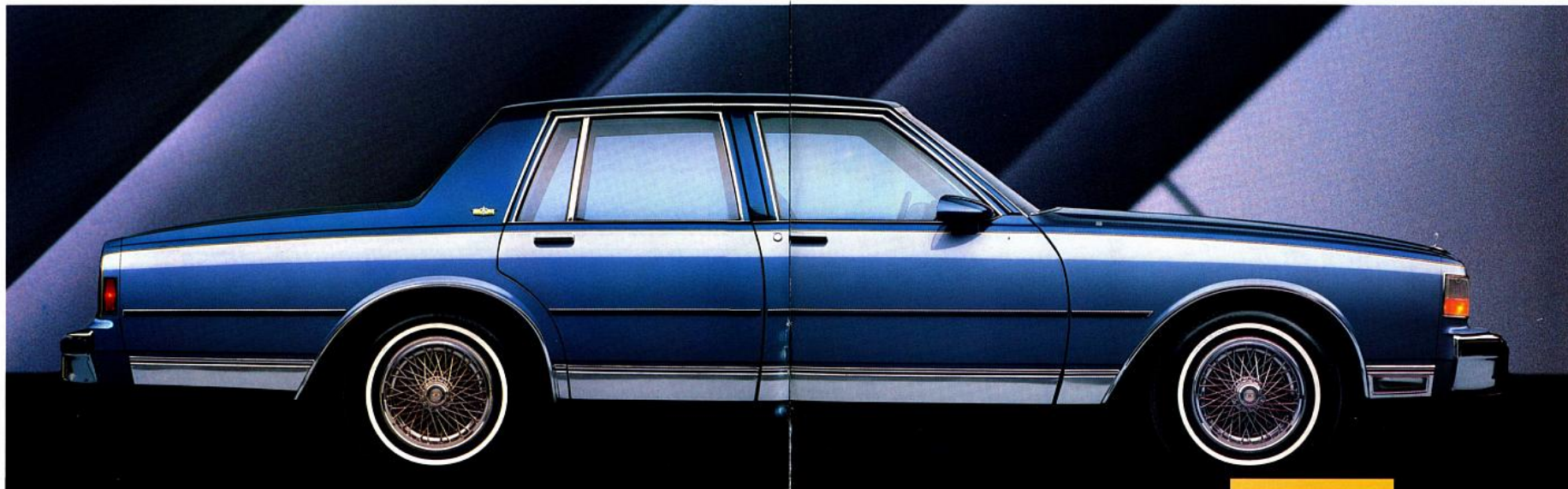
Caprice Classic Sedan with optional body-side moldings, wire wheel covers and other options.

Uncompromised room, ride, comfort and style. These are the attributes of an American institution, Caprice Classic by Chevrolet.