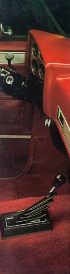
The optional Silverado interior, shown in Burgundy Custom Vinyl.

The front passenger seat slides forward for ease of access to the optional rear bench. A gentle push then returns the seat to its preset position.