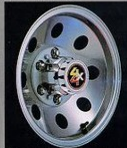
Optional forged aluminum wheels.

Blazer 4x4 in Black, shown with the following optional items: Silverado trim, luggage rack (dealer-installed), deep-tinted windows, sliding side windows, power rear window, rear window defogger and styled wheels. Tires supplied by various manufacturers.