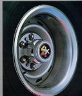
Optional Rally Wheels.