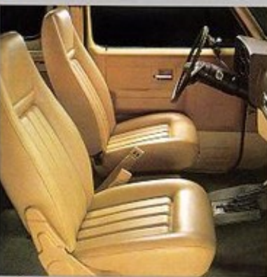
The standard Custom Deluxe interior, shown in Saddle vinyl.

Note: Optional rear passenger seats will match front seat trim. ■ Standard ■ Optional ■ Not Available