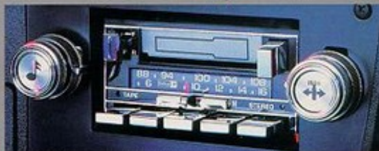
Optional AM/FM stereo with cassette deck, Seek and Scan.

* Gas. Both Gas and Diesel. * 32 gallon for diesel models.