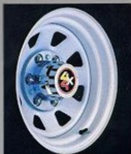
Optional styled wheels.