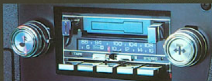
GM-Delco AM/FM stereo radio with cassette deck