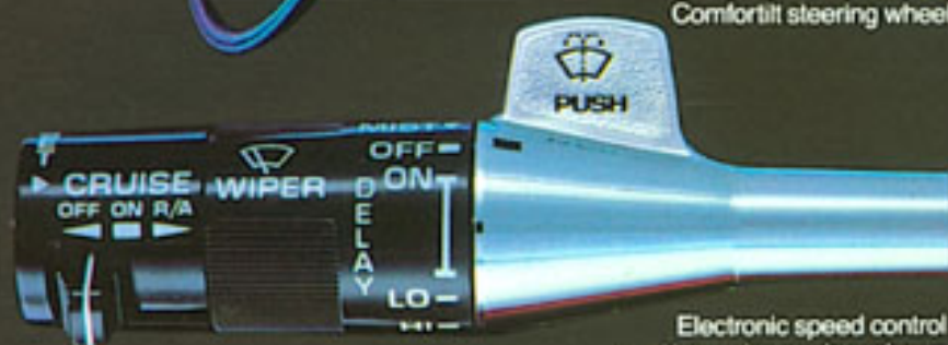
Electronic speed control and intermittent wiper shown on standard multi-function switch.