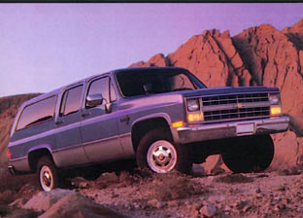
K20 Suburban Scottsdale Special Two-Tone in Light Blue and Silver.

*See Trailering Chart, page 8 for details.