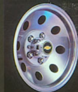
Cast aluminum wheels