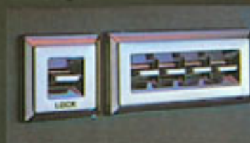
Power door locks Power windows