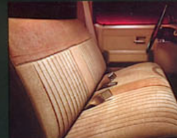
Scottsdale trim in Saddle Tan Custom Cloth.