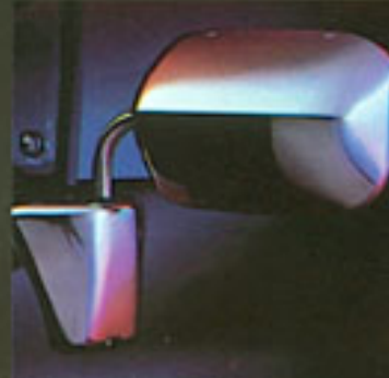
Below Eyeline mirror