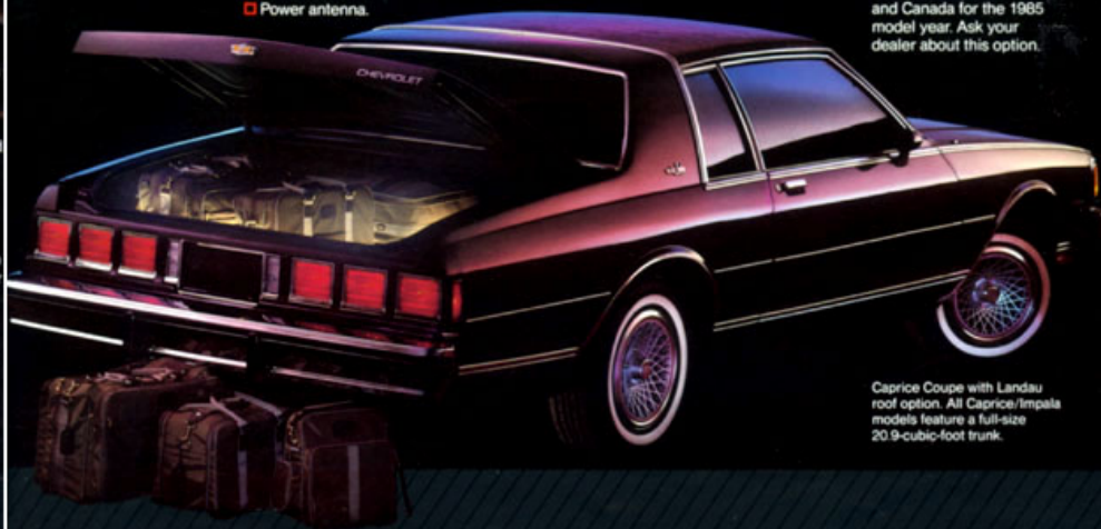
Caprice Coupe with Landau roof option. All Caprice/Impala models feature a full-size 20.9-cubic-foot trunk.

An option that offers service protection in addition to that provided by GM's new-vehicle limited warranty. Available only in the U.S. and Canada for the 1985 model year. Ask your dealer about this option.