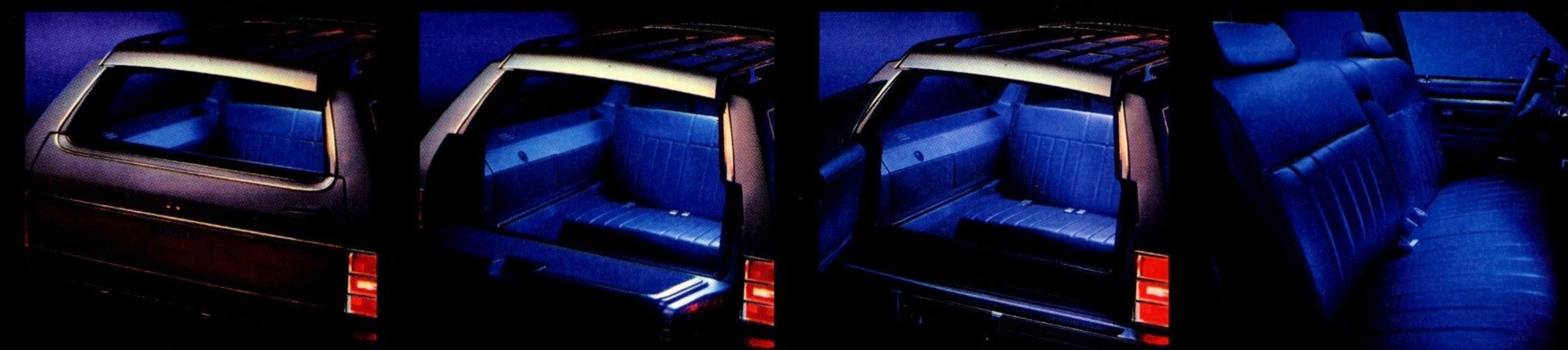
Caprice Classic Wagon's three-way tailgate with power window permits easy loading of packages, people or cargo. The standard vinyl seat, shown far right, features a pull-down centre armrest.