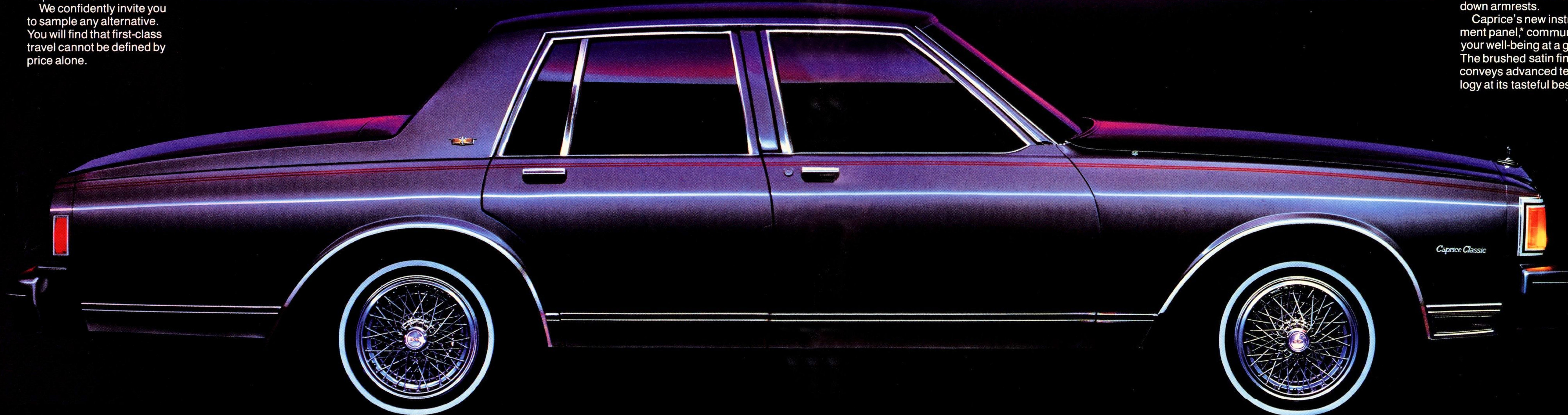
Caprice Classic Sedan shown above and on front cover.

Caprice's new instrument panel,* communicates your well-being at a glance. The brushed satin finish conveys advanced technology at its tasteful best.