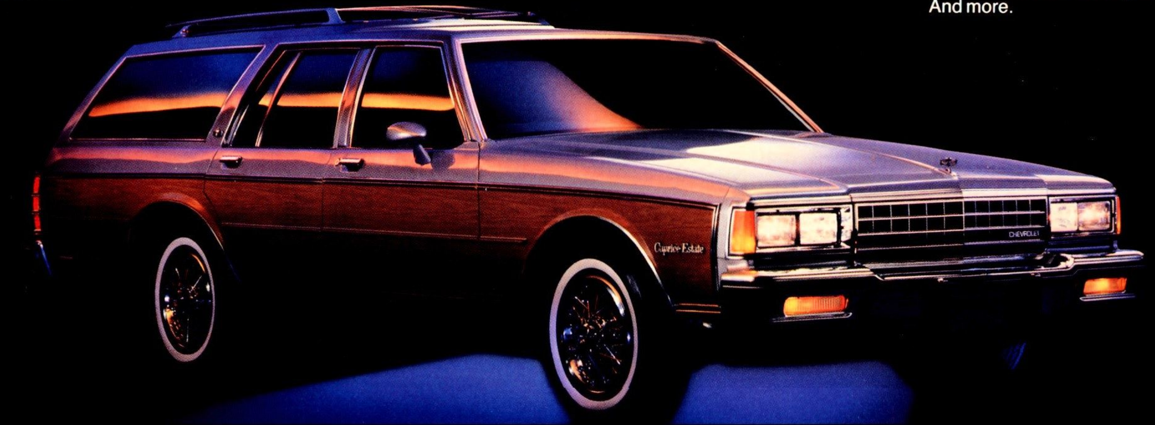
Caprice Classic Station Wagon with available Estate package.