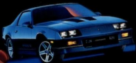
Camaro IROC-Z Sport Coupe.

■ Power front disc/rear drum brakes are standard; 4-wheel power disc brakes optional.