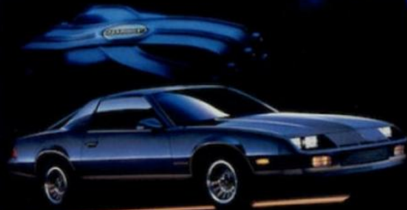
Camaro Berlinetta Coupe.

Graphic equalizer and cassette player optional.