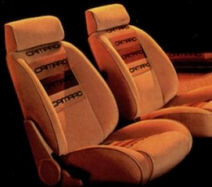
L/S Contour seat features 18 adjustment variations on the driver's side.