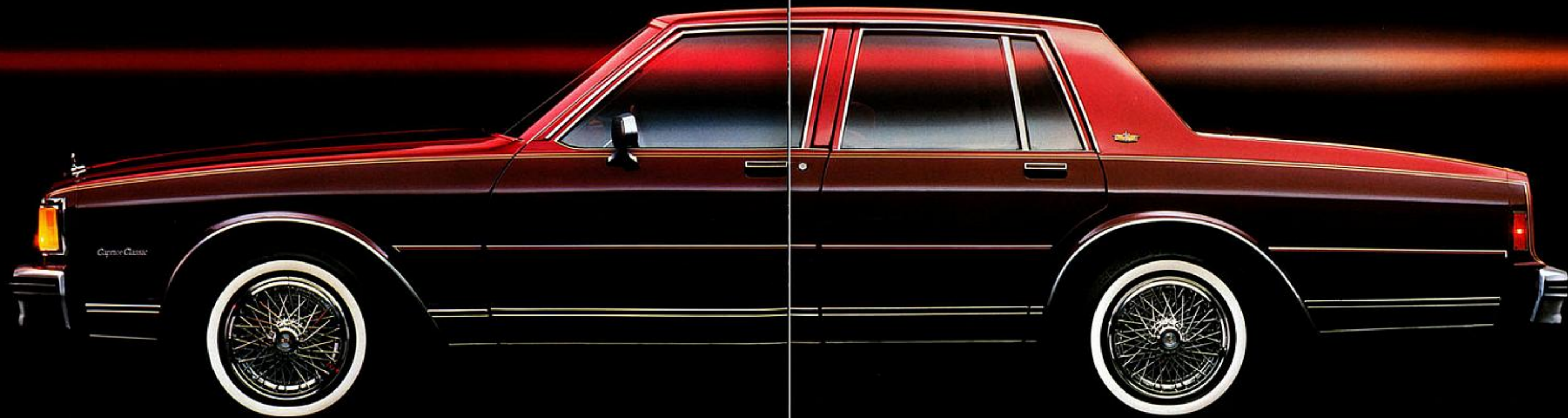
Caprice Classic Sedan.

isolation. Only then will you understand why Caprice was the only full-size car on Car and Driver magazine's list of "Ten Best Cars." Foreign or domestic (January 1983). You can spend more trying to find these virtues in other cars. But why should you?