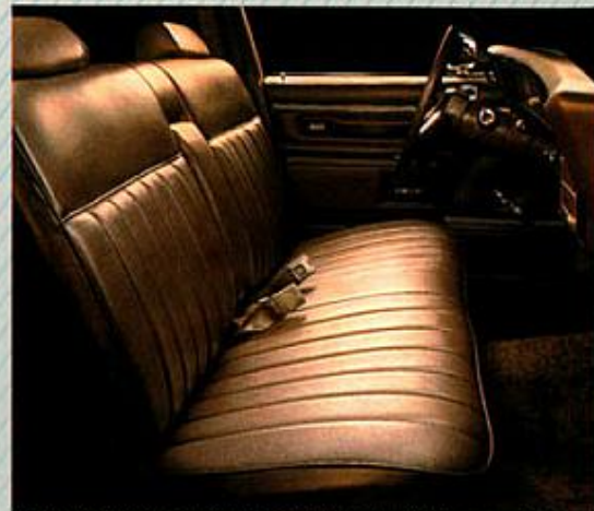
Caprice Classic Wagon with standard vinyl seat and folding armrest.