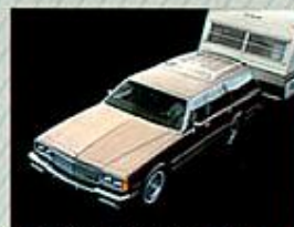
Caprice Classic Wagon can be equipped to be a powerful towing vehicle. See the Chevy Recreation & Trailering Guide for details.

Here's how to get even more of a good thing. Choose Caprice Classic Station Wagon. Get the ride, comfort and luxury of a Caprice. Plus, roomy accommodations for up to eight passengers with the standard third seat. Plus, 87.9 cubic feet of cargo capacity with rear seats down. These two