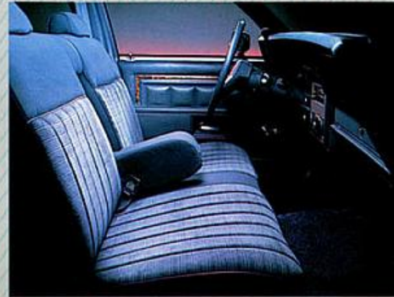
Impala standard cloth bench seat with fold-down center armrest.

Impala. Full-Size in Every Way but Price. Even More Comfort Than Before.