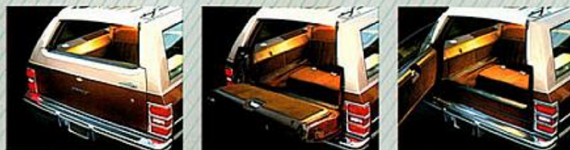
Caprice Classic Wagon's three-way tailgate permits easy loading of packages, cargo or people.