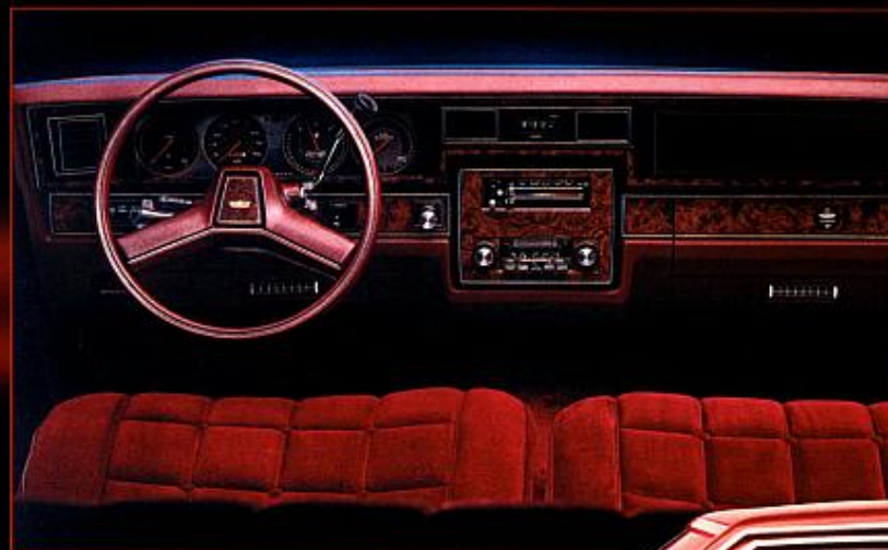
Caprice Classic instrument panel. Note: Speedometers in Canada have major scale in km/h, secondary in MPH, and odometer in kilometres.

isolation from road and wind noise. Only then will you understand why Caprice was the only full-size car on Car and Driver magazine's list of "10 Best Cars." Foreign or domestic. (January 1983). You can spend more trying to find these virtues in other cars. But why should you?