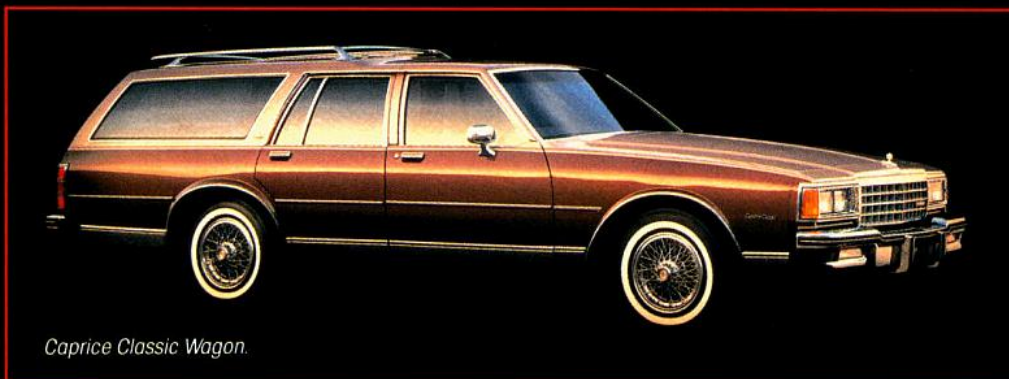
Caprice Classic Wagon.

Choose Caprice Classic Station Wagon and you get the ride, comfort and luxury of a Caprice. Plus 87.9 cubic feet of cargo capacity. And roomy accommodations for eight passengers with standard third seat.