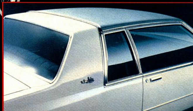
Landau Equipment package available for Coupe only.