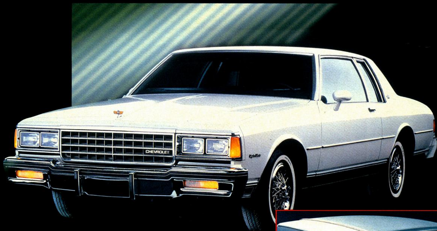
Caprice Classic Coupe.