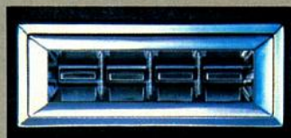
...and power windows are among the many options available.