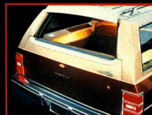
Caprice Classic Wagon's three-way tailgate permits easy loading of packages, cargo or people.