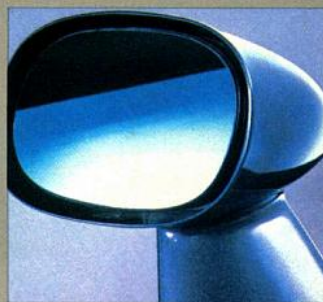
Right and left hand remote controlled Sport mirrors...