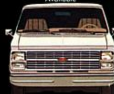
G30 Sportvan (125.0" W.B.) 12-Passenger Seating Available