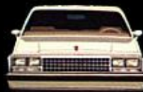
Malibu Station Wagon (108.1" W.B.) 6-Passenger