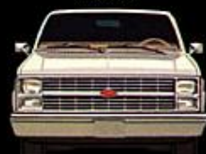
C10 Suburban Panel Doors (129.5" W.B.) 9-Passenger Seating Available