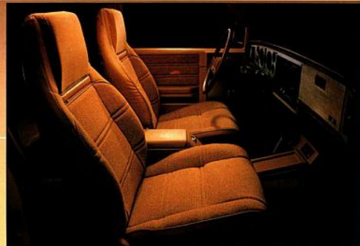
Optional Chevy S-10 Blazer Tahoe interior.