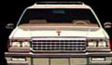
Caprice Classic Station Wagon (116.0" W.B.) 8-Passenger