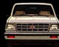
S-10 Blazer (100.5" W.B.) 4-Passenger Seating Available