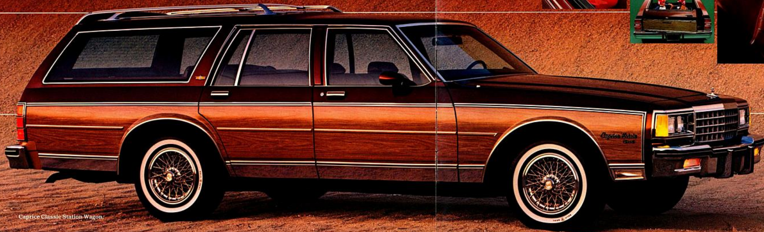
Caprice Classic Station Wagon.