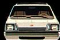
Cavalier Station Wagon (101.2" W.B.) 5-Passenger