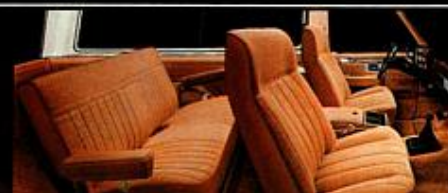
The optional Silverado interior. With available rear seat, it carries five adults.