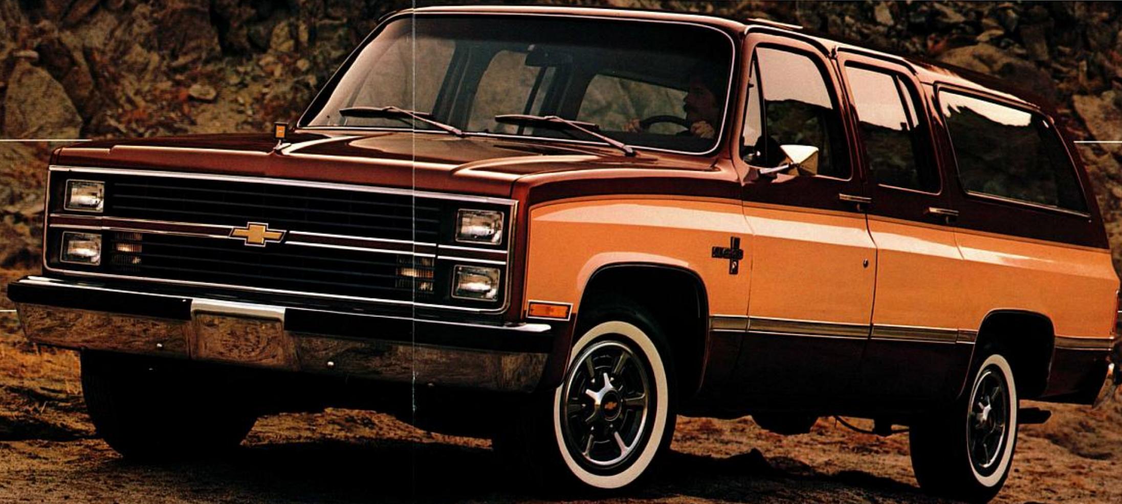
C20 Suburban Silverado.