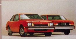
Cavalier Coupe. Also available but not illustrated: Cavalier Sedan and Wagon models.

S - Standard EC - Optional at Extra Cost NA - Not Available