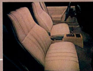
Cavalier standard interior with reclining contoured front bucket seats.