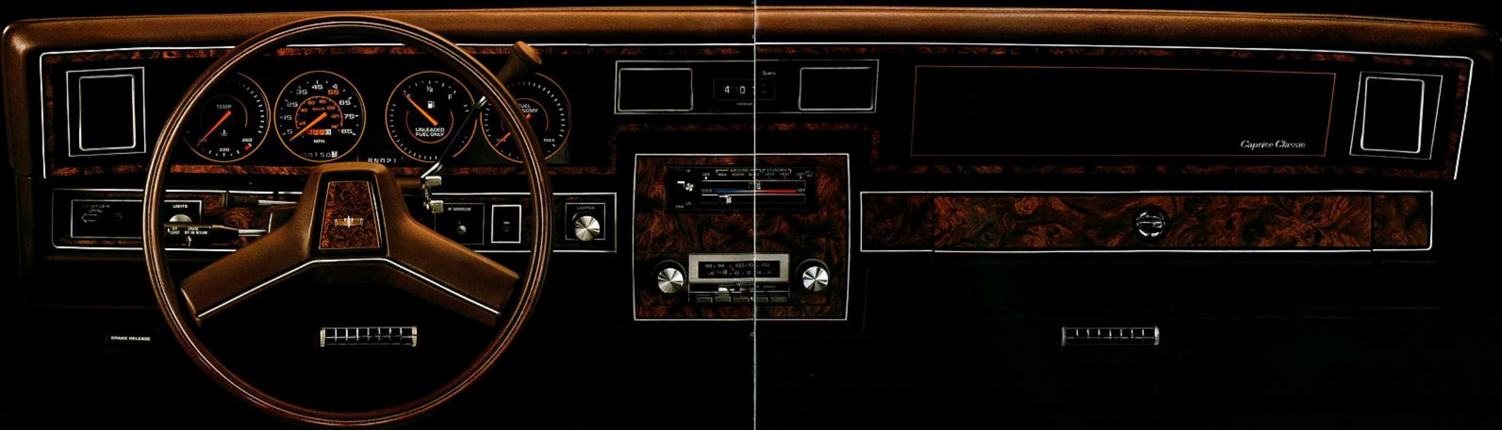
Caprice Classic instrument panel.

Behind the wheel you look over instruments that are conveniently located, easy to read, easy to reach.