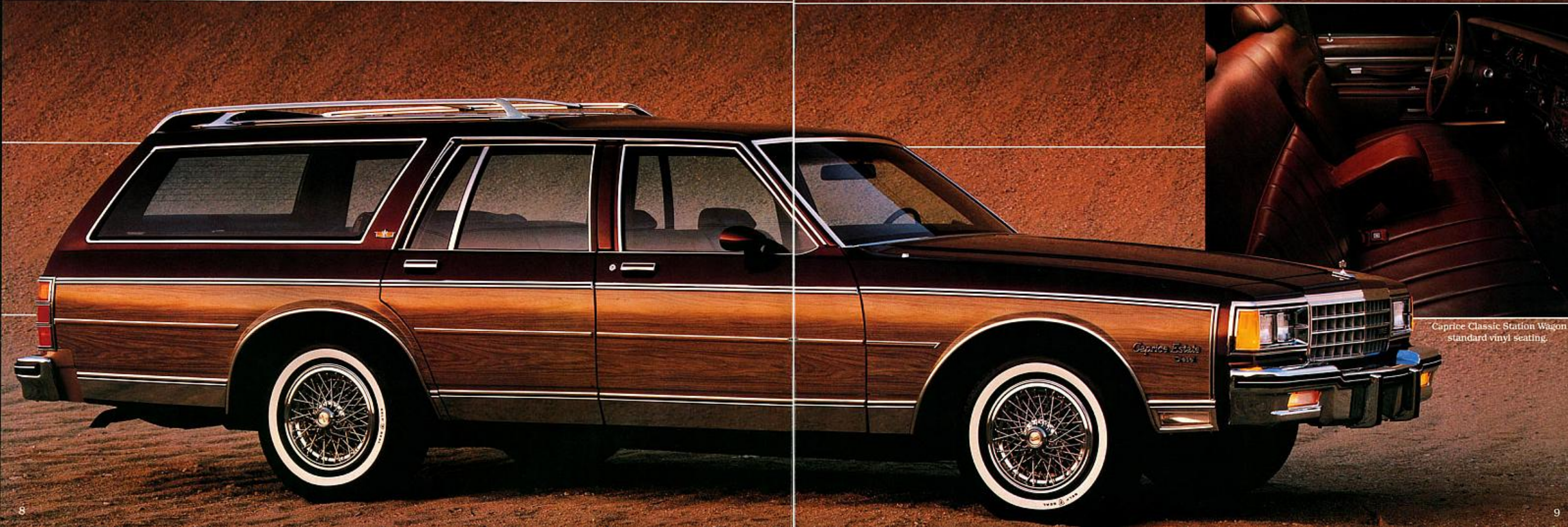
Caprice Classic Station Wagon standard vinyl seating.

eight passengers with the standard third seat. That's only part of the story. The 1983 Chevrolet Wagon catalog has full details.