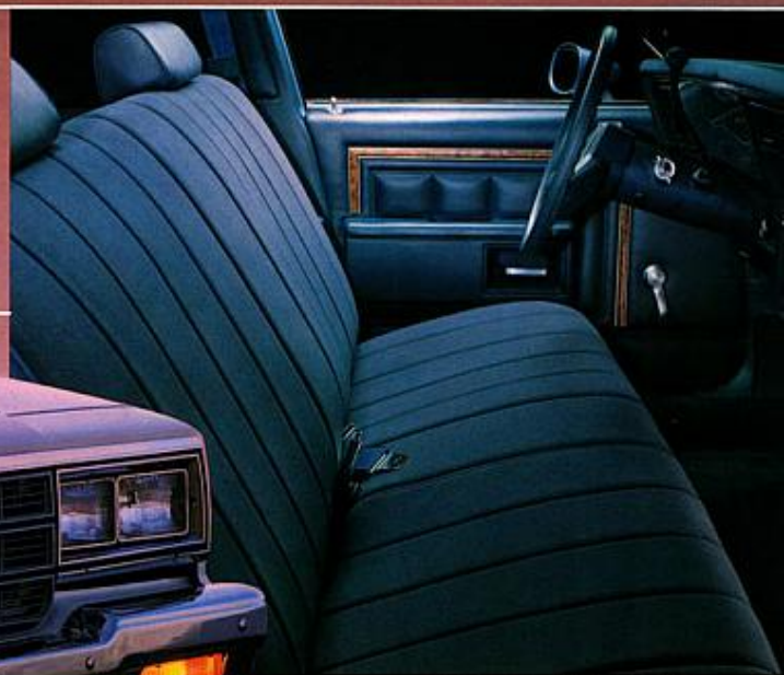
Impala standard cloth seating.