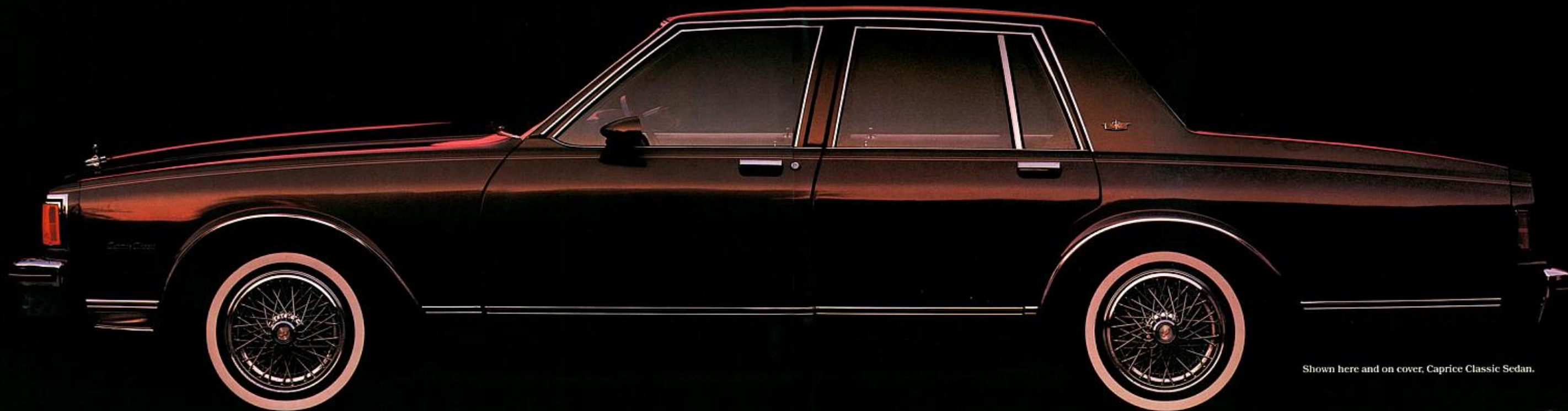
Shown here and on cover, Caprice Classic Sedan.

better value for your driving pleasure. Feature for feature. Comfort for comfort. Dollar for dollar. You can spend more, but why?