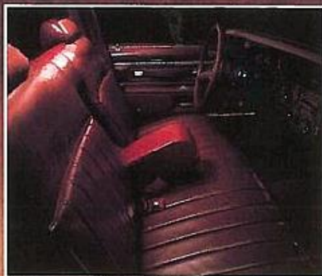
Caprice Classic Station Wagon standard vinyl seating

gate window and a three-way door-gate. The security of lockable storage compartments. The ability to carry 87.9 cubic feet of cargo - or you can have seating for up to eight passengers with the standard third seat.