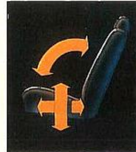
Six-way power seats.

Note: Speedometers in Canada have major scale in km/h, secondary in MPH and odometer in kilometres.