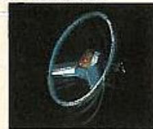
Comfortilt steering wheel.