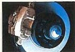
Power front disc/rear drum brake system standard.