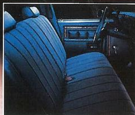
Impala standard cloth seating

belted radial ply tires, colour-keyed cut-pile carpeting, extensive anti-corrosion measures and much more built-in Chevrolet value. Inside, there's room for six adults to stretch out in full-foam cushion comfort. And a trunk able to hold almost 21