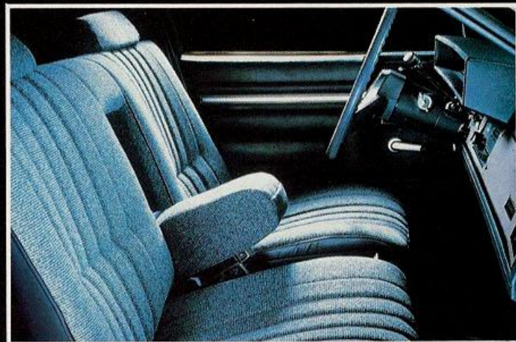
Celebrity standard front bench seat with folding centre armrest.