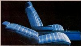
Reclining 45/45 driver and passenger seat backs.