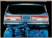
16.2 cu. ft. of trunk space.