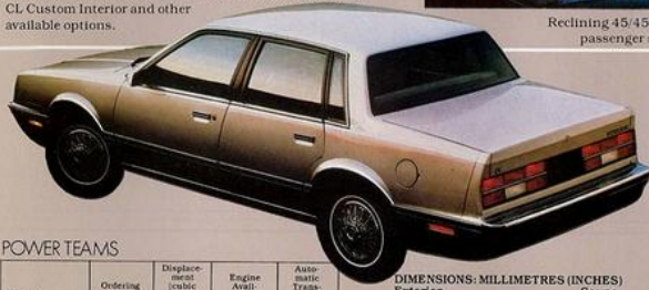
Celebrity Sedan shown in Custom Two-Tone Silver/White, CL Custom Interior and other available options.