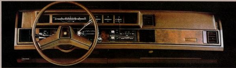
Celebrity CL instrument panel. Note: Speedometers in Canada have major scale in km/h, secondary scale in MPH and odometer in kilometres.