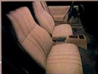
Cavalier standard interior with reclining contoured front bucket seats.