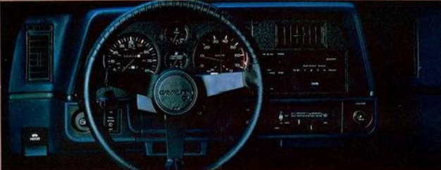
Cavalier CS instrument panel shown with available Special Instrumentation, new electronically tuned AM/FM stereo radio with cassette tape and digital clock, and air conditioning.