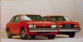
Cavalier Coupe. Also available but not illustrated: Cavalier Sedan and Wagon models.

Manual lap/shoulder belts with push-button buckles for driver and right front passenger (driver's side includes visual and audible warning system) ■ Manual lap belts with push-button buckles for rear passenger positions including centre inside door locks ■ High-strength safety door latches and hinges ■ Inertia-type folding front seat-back latches ■ Energy-absorbing instrument panel and front seat-back tops ■ Laminated safety glass windshield/tempered safety glass side and rear windows ■ Safety armrests ■ Standard identification symbols for controls and displays ■ Front seat head restraints for driver and right front passenger (adjustable or integral).