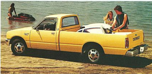
Chevy 2WD Diesel LUV, 7½-ft. cargo box model in Marigold Yellow.

To obtain EPA fuel economy estimates for Chevrolet light-duty trucks, check the wall poster at your dealer's showroom.