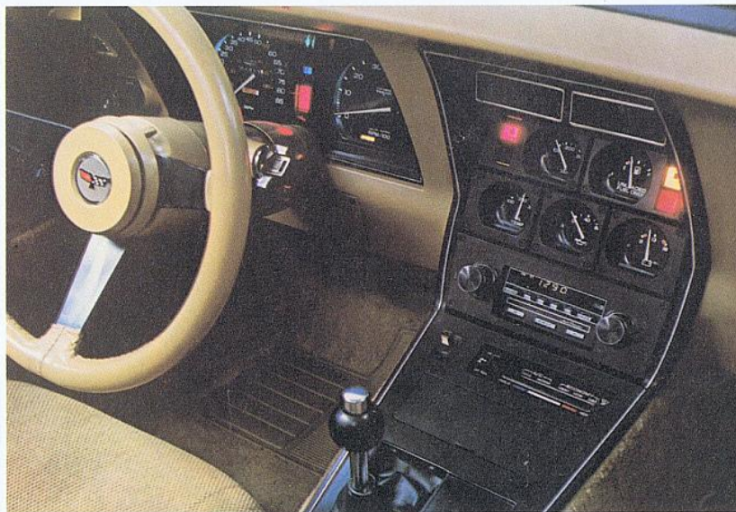
Aircraft-style centre console and full gauge instrumentation are standard. NOTE: Speedometers in Canada have major scale in km/h, secondary in mph and