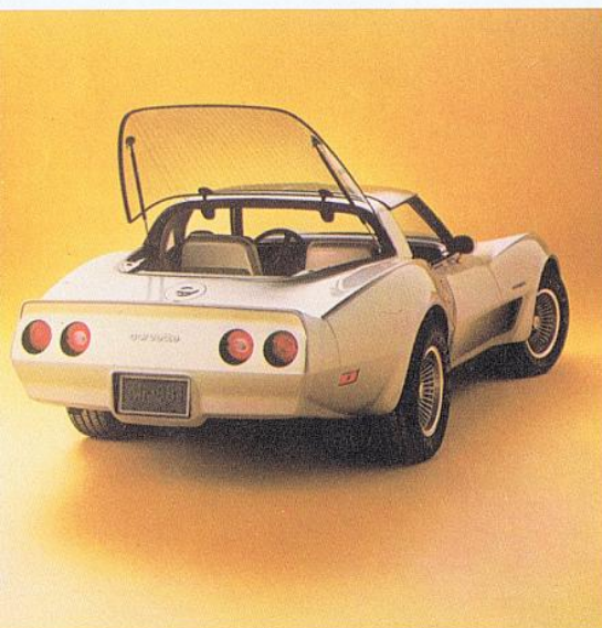
Frameless glass-hatch design with remote release is standard on the "Collector Edition" Hatchback Coupe.