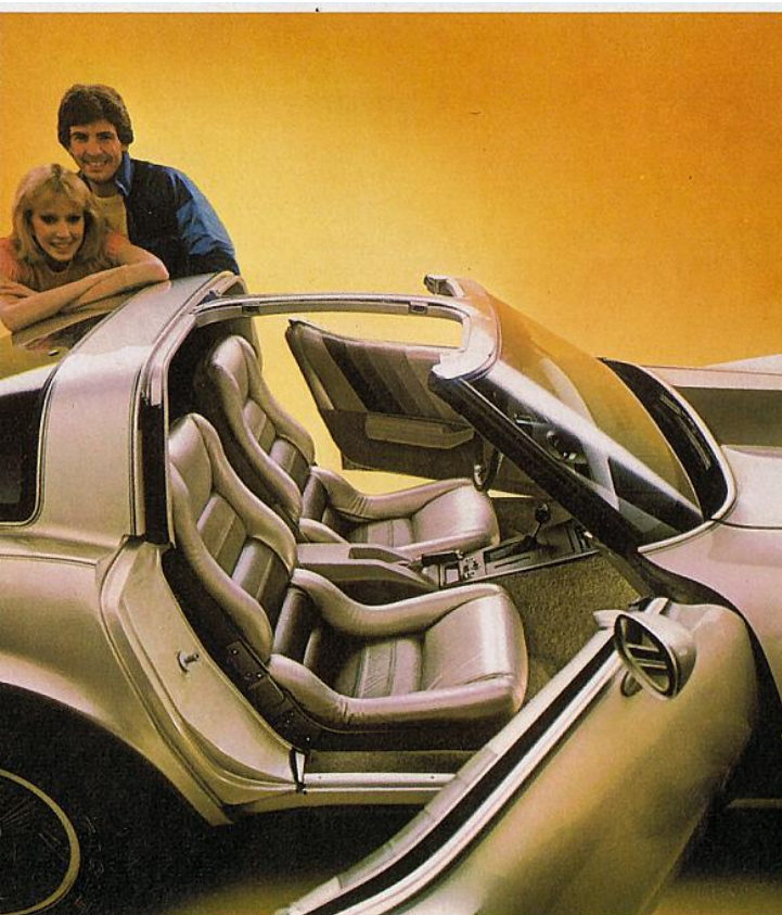
Multi-tone full leather seats highlight the "Collector Edition" special interior.