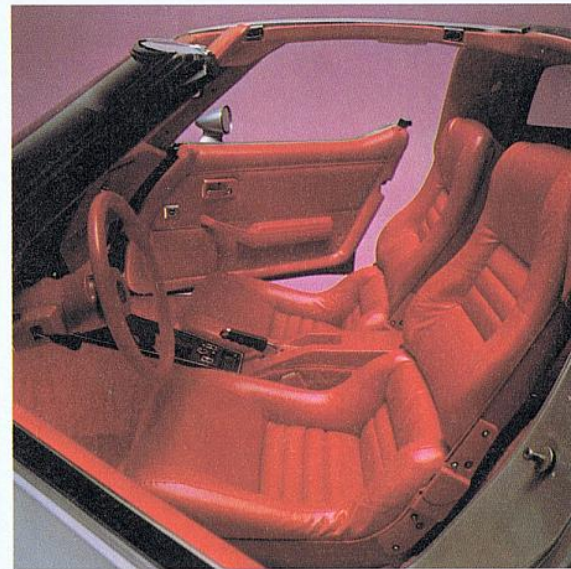
Corvette standard interior.