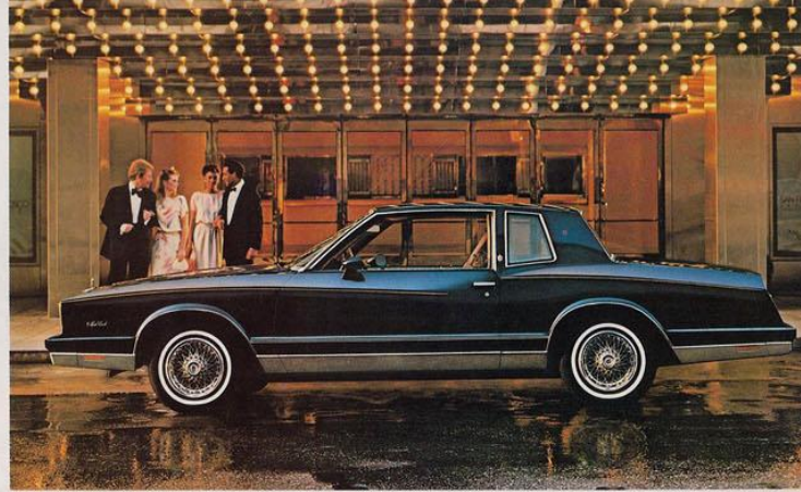
Monte Carlo Sport Coupe.

Examine this personal car from Chevrolet and see if it doesn't satisfy your demanding tastes. The 1982 Monte Carlo. It's a matter of personal pride.