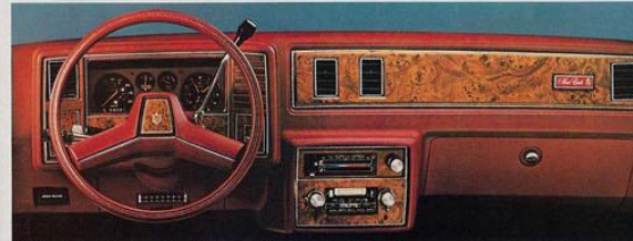
Monte Carlo instrument panel shown with optional gauge package. NOTE: Speedometers in Canada have major scale in km/h, secondary in MPH and odometer in kilometres.