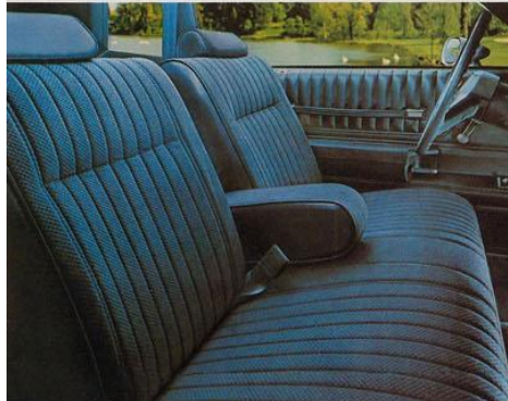
Monte Carlo's standard interior.