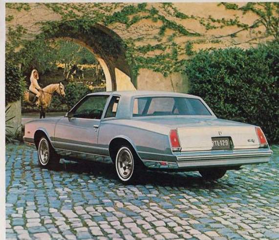
Monte Carlo Sport Coupe with optional Landau roof.