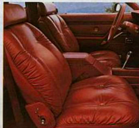
Optional Leather-and-Vinyl Bucket Seats

Cordoba's instrument panel gives you the best of both worlds. Modular construction for easy servicing balanced with the styling of walnut-like inserts. Controls are within comfortable reach. Gauges feature quick read-out. It's easy on the eyes and lets you know what's going on.