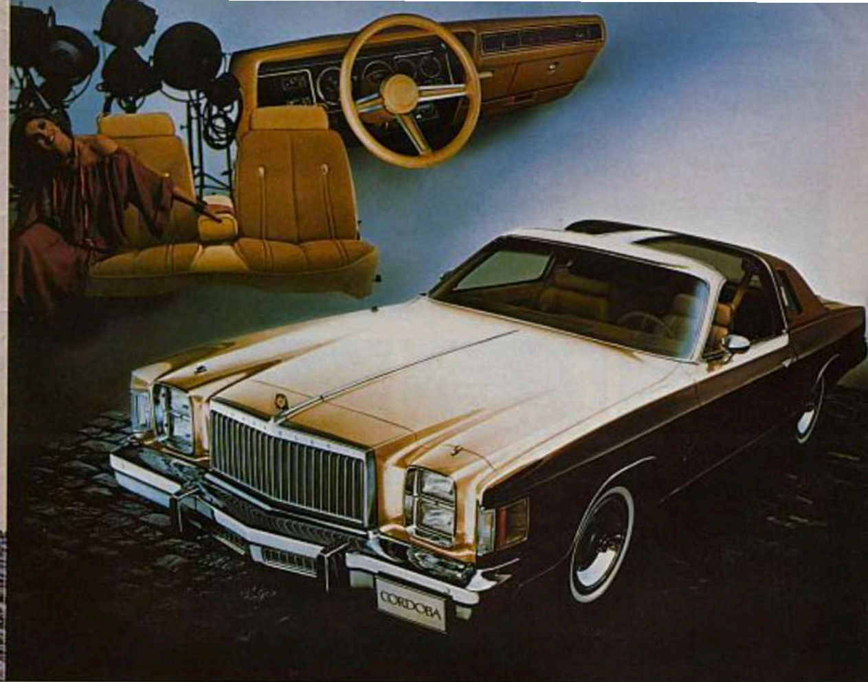
Chrysler Cordoba with Optional Two-Tone Paint and T-Bar Roof