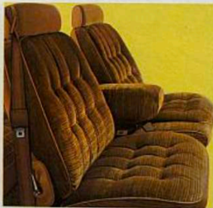
Optional Cloth 60/40 Bench Seats

Discover or rediscover the joy of driving . . . in a '79 Chrysler Cordoba . . . the driver's car. It's a luxurious personal car. There's more to the Cordoba experience. There's responsiveness, quiet, and comfort. Cordoba is an uncommon car at a time when cars are tending to become more alike.