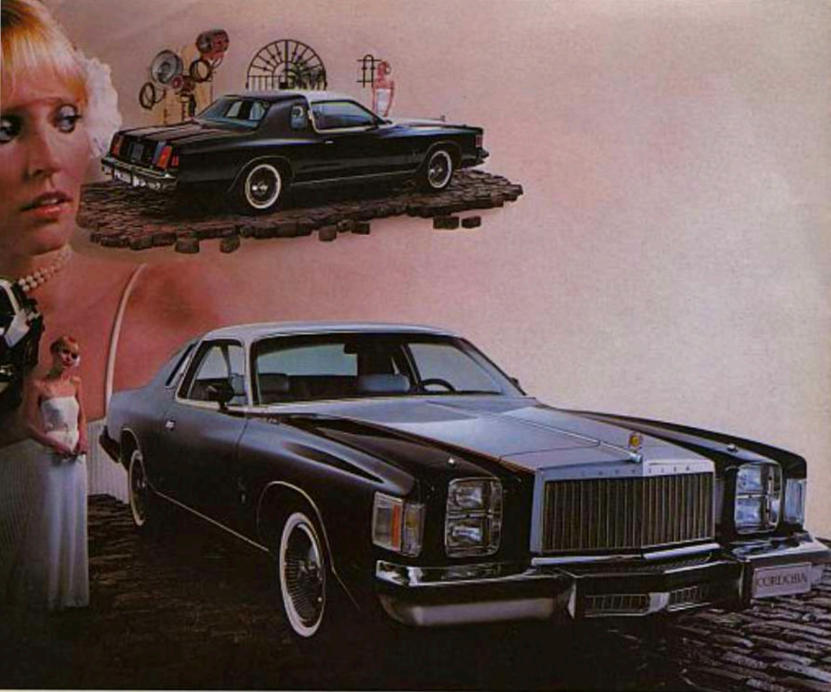
Chrysler Cordoba with Optional Special Appearance Package