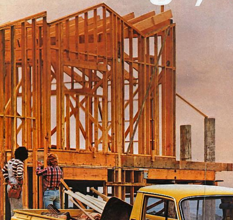
Chevy LUV—7½-foot box