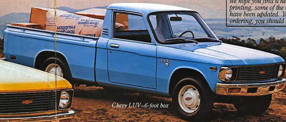
Chevy LUV—6-foot box