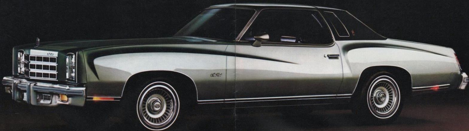
Monte Carlo Le Mans Coupe. Shown with available white stripe tires, bumper guards and bumper rub strips. (Shown also on cover.) Many Options and Custom Features are available for Monte Carlo. Some are illustrated or described in this catalogue.