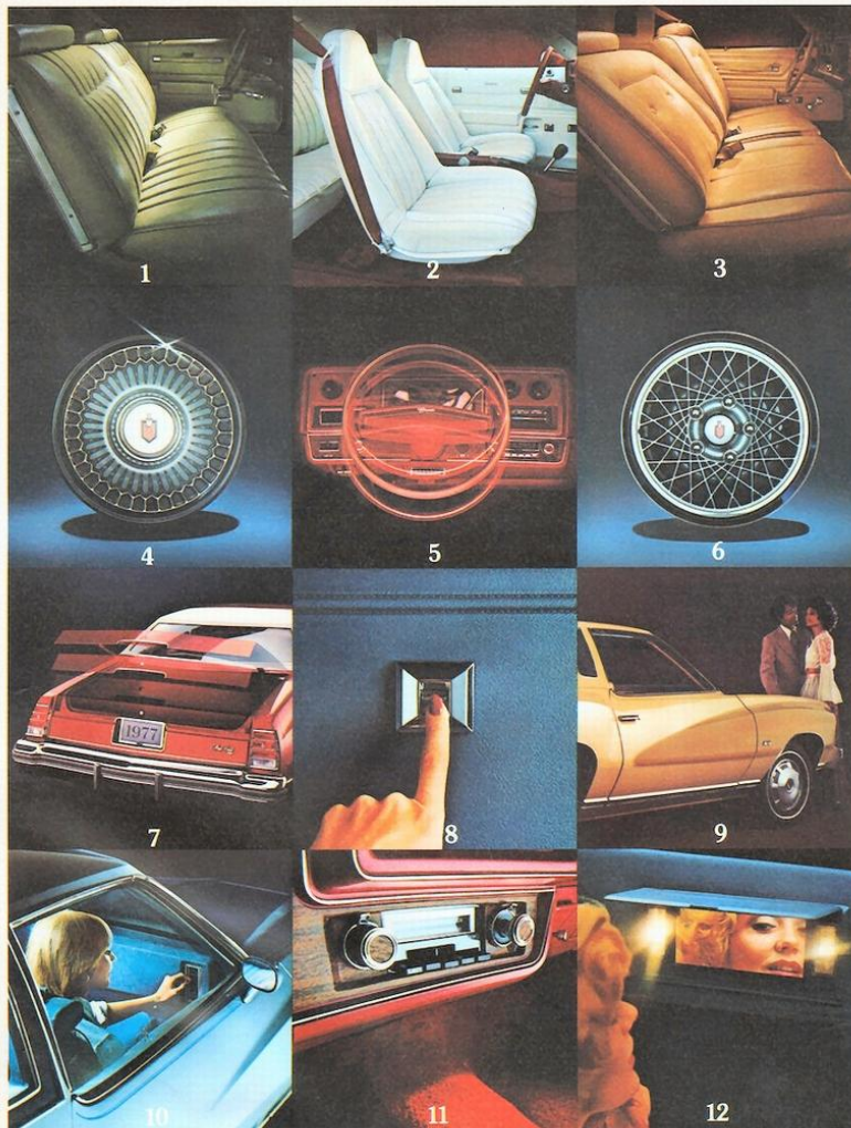
Monte Carlo Coupe with available padded full vinyl roof, sport mirrors, deluxe wheel covers, white stripe tires, bumper guards and bumper rub strips.