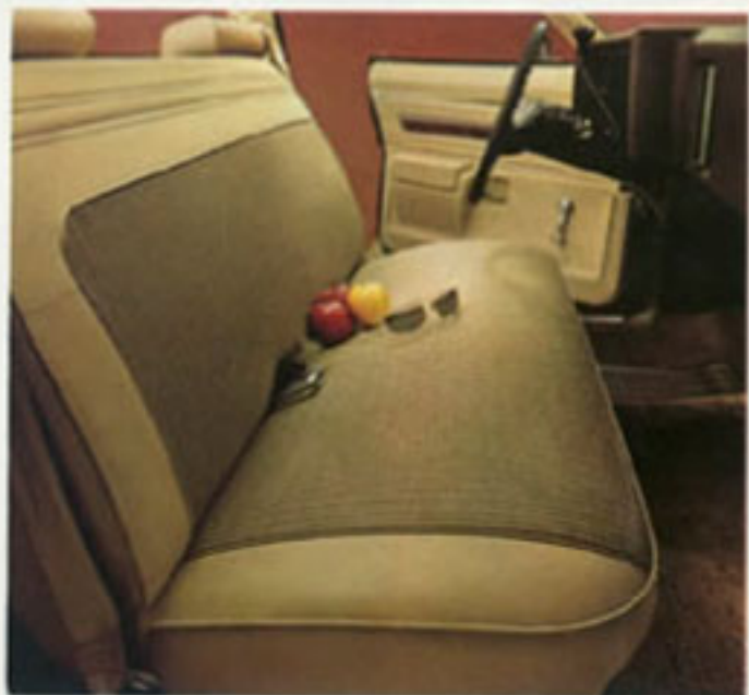
Left: Malibu Coupe.