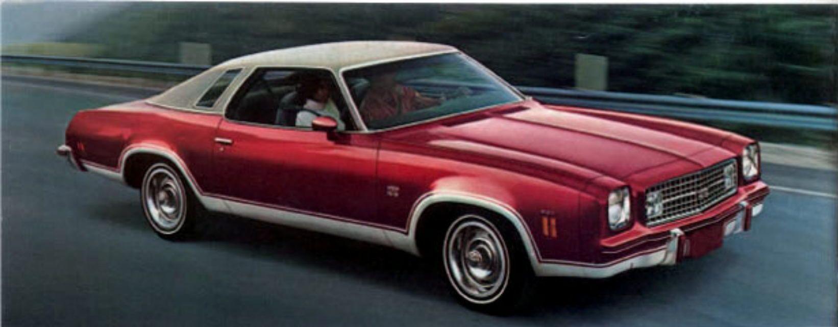
Above: Laguna Type S-3 Colonnade Hardtop Coupe