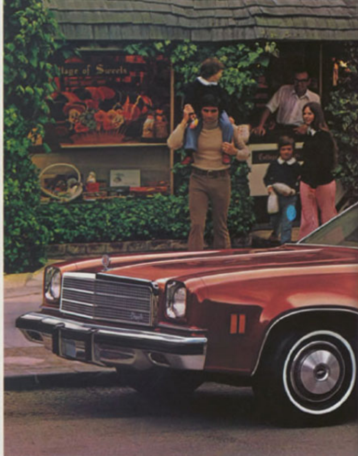
Shown here, two views of the Malibu Classic Sedan.