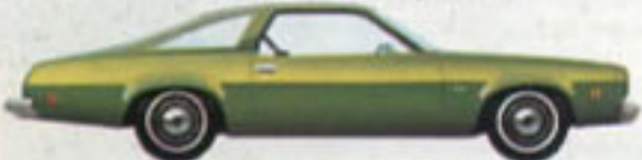
Malibu Colonnade Hardtop Coupe