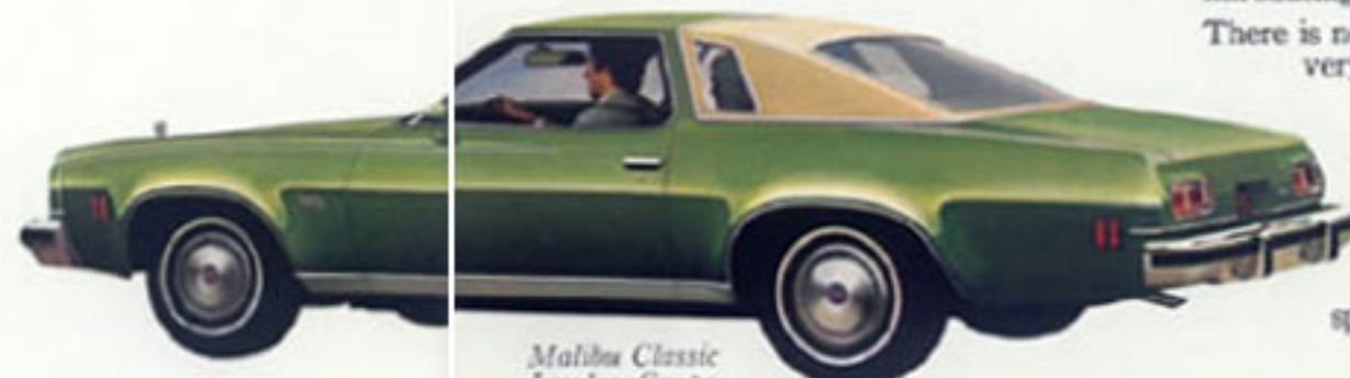
Malibu Classic Landau Coupe.

There is no reason why automotive luxury has to be confined to the very big and very expensive.