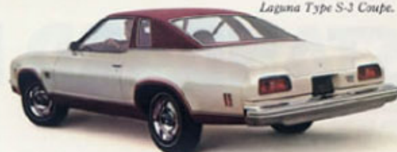
Laguna Type S-3 Coupe.

What a lot of cars dream about, Laguna Type S-3 calls standard. Including steel-belted radials and special radial-tuned suspension components.