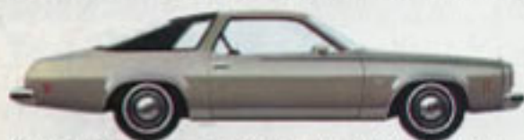
Malibu Classic Landau Colonnade Hardtop Coupe