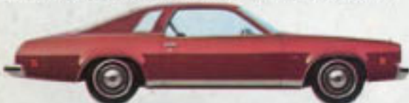
Malibu Classic Colonnade Hardtop Coupe