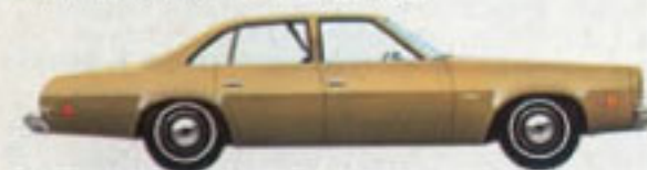
Malibu Colonnade Hardtop Sedan