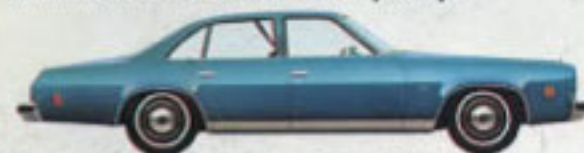
Malibu Classic Colonnade Hardtop Sedan