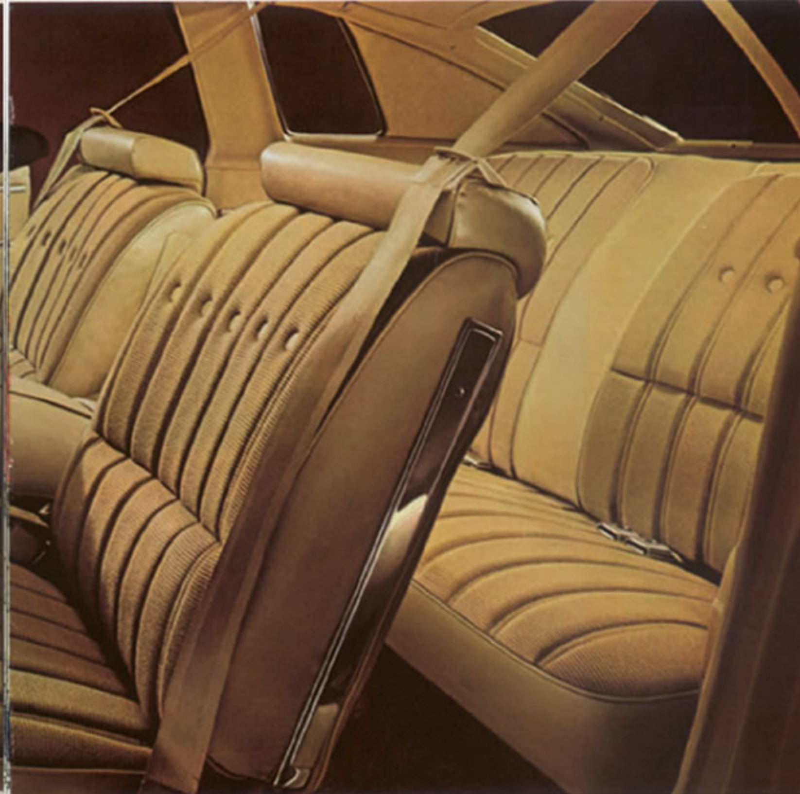
Malibu Classic interior and instrument panel.