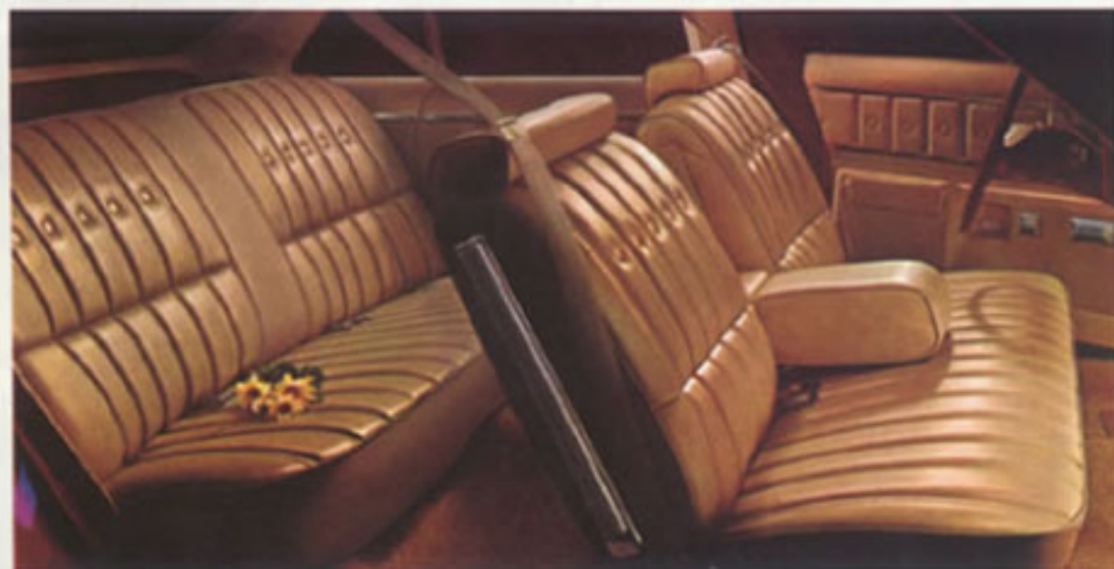
The Malibu Classic Sedan's luxurious seating space shown in available all-vinyl.