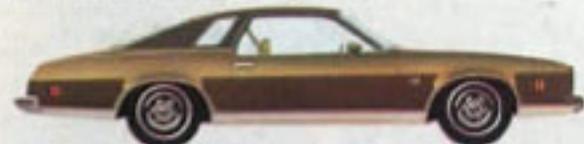
Laguna Type S-3 Colonnade Hardtop Coupe

Malibu Classic and Malibu also come in exciting station wagon models, in addition to the passenger car models described in this catalog. For information on all of Chevrolet's wide range of wagons, see your dealer for the 1974 Chevrolet wagon catalog.