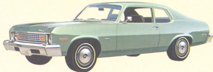
Nova Hatchback Coupe