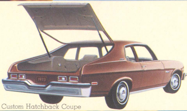
Nova Custom Hatchback Coupe