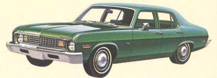
Nova 4-Door Sedan