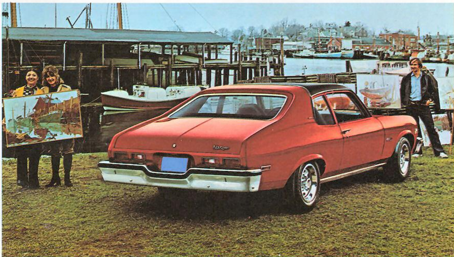
Nova Custom Hatchback

will tip off its low price. Certainly not its looks, ride, performance or handling ease.