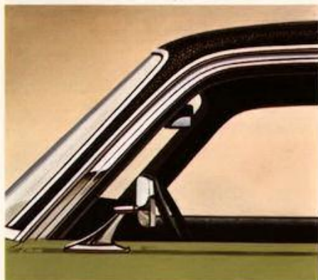
Full front door-glass styling. No ventipanes. A clean-lined, smooth-contoured look.