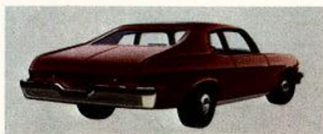
Nova Custom Hatchback Coupe