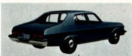
Nova Custom 4-Door Sedan