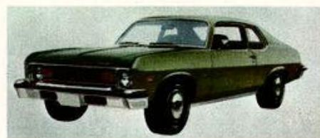
Nova Custom Coupe