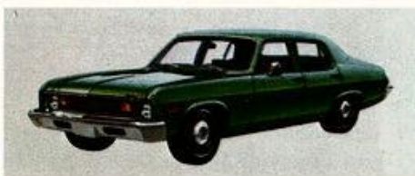
Nova 4-Door Sedan