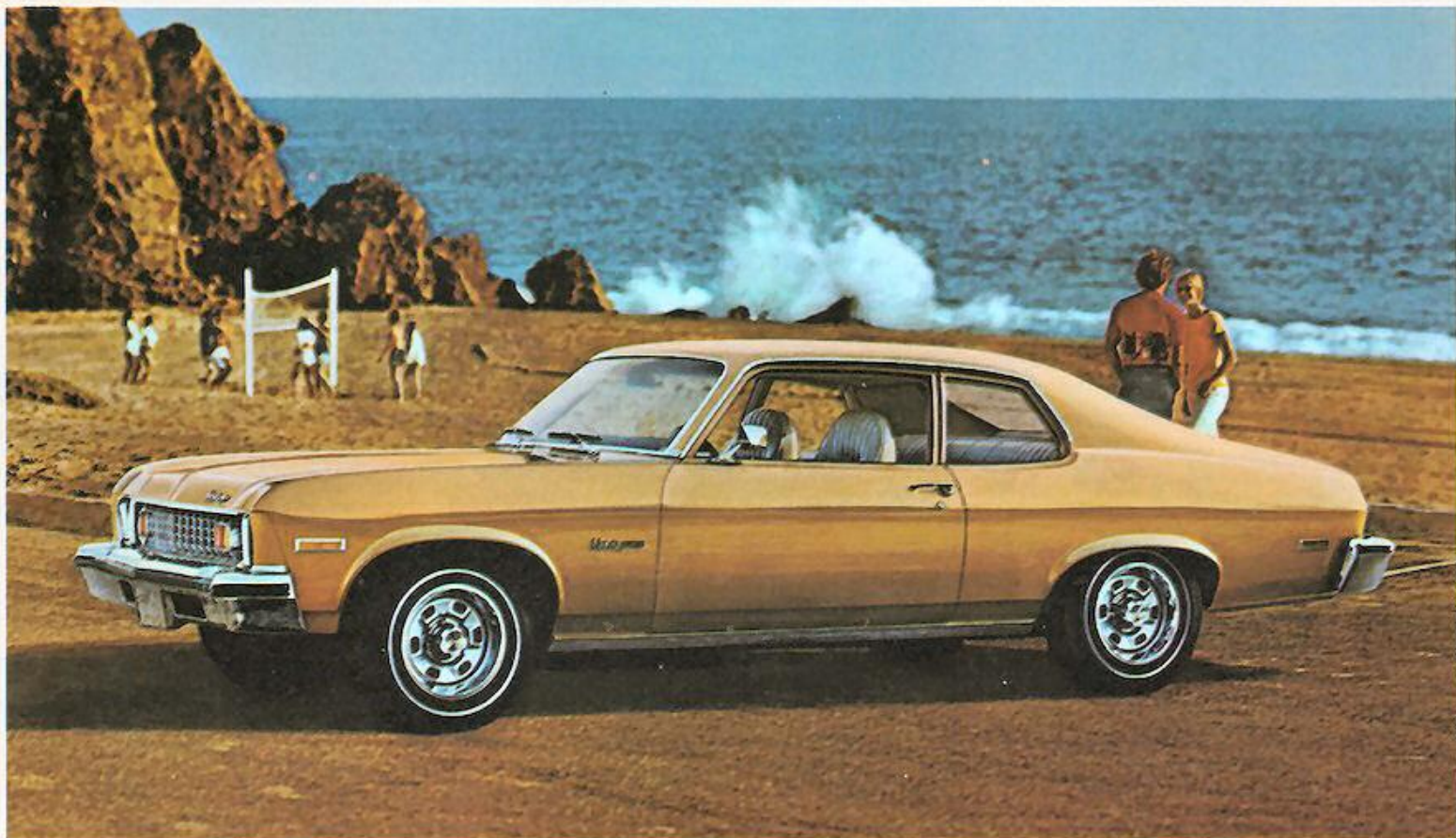
Nova Custom Coupe

Nova Custom Coupe. Sporty lines yet ever-so-practical. There's not much about the Nova Custom Coupe that