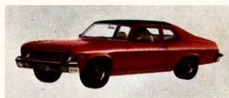
Nova Hatchback Coupe