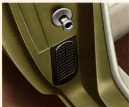
New flow-through ventilation system. When the car is moving, outside air circulates through the car, coming in through opened cowl side panels and exiting via air exhaust outlets in door pillars. When stopped, and heater blower is on, air enters through heater system ducts and exits through the above outlets.