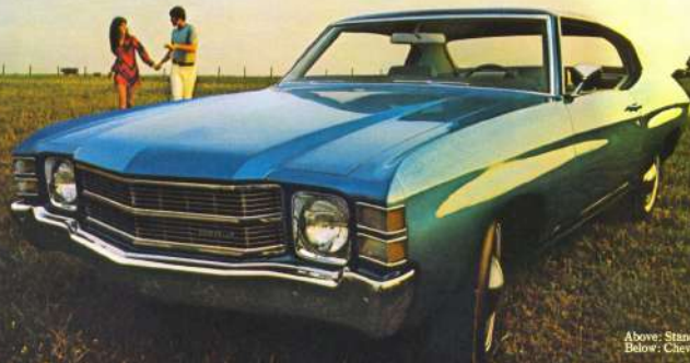
Above: Standard Chevelle cloth-and-vinyl interior. Below: Chevelle Sport Coupe.