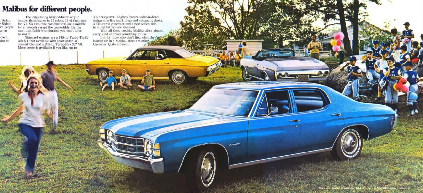
Circles are: Malibu Convertible, Malibu 4-Door Sedan, Malibu Sport Sedan.

But for those who don't find what they're looking for in a Malibu, there are other Chevelles. Quite different.